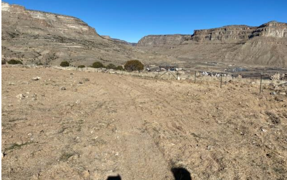
Photo 2: The middle portion of the TR-69 Repair Area. The photo was taken looking to the west.