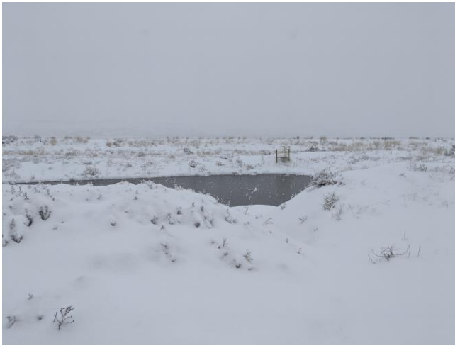
Rail Loop Pond.