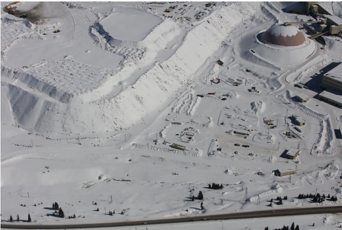
North 40 OSF

The McNulty and North 40 OSF's were observed. No abnormal conditions were noted. OSF's appear to be functioning within the established design criteria.