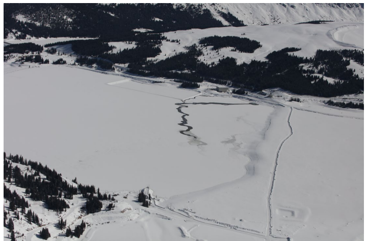
Tenmile Pond / 2 Dam