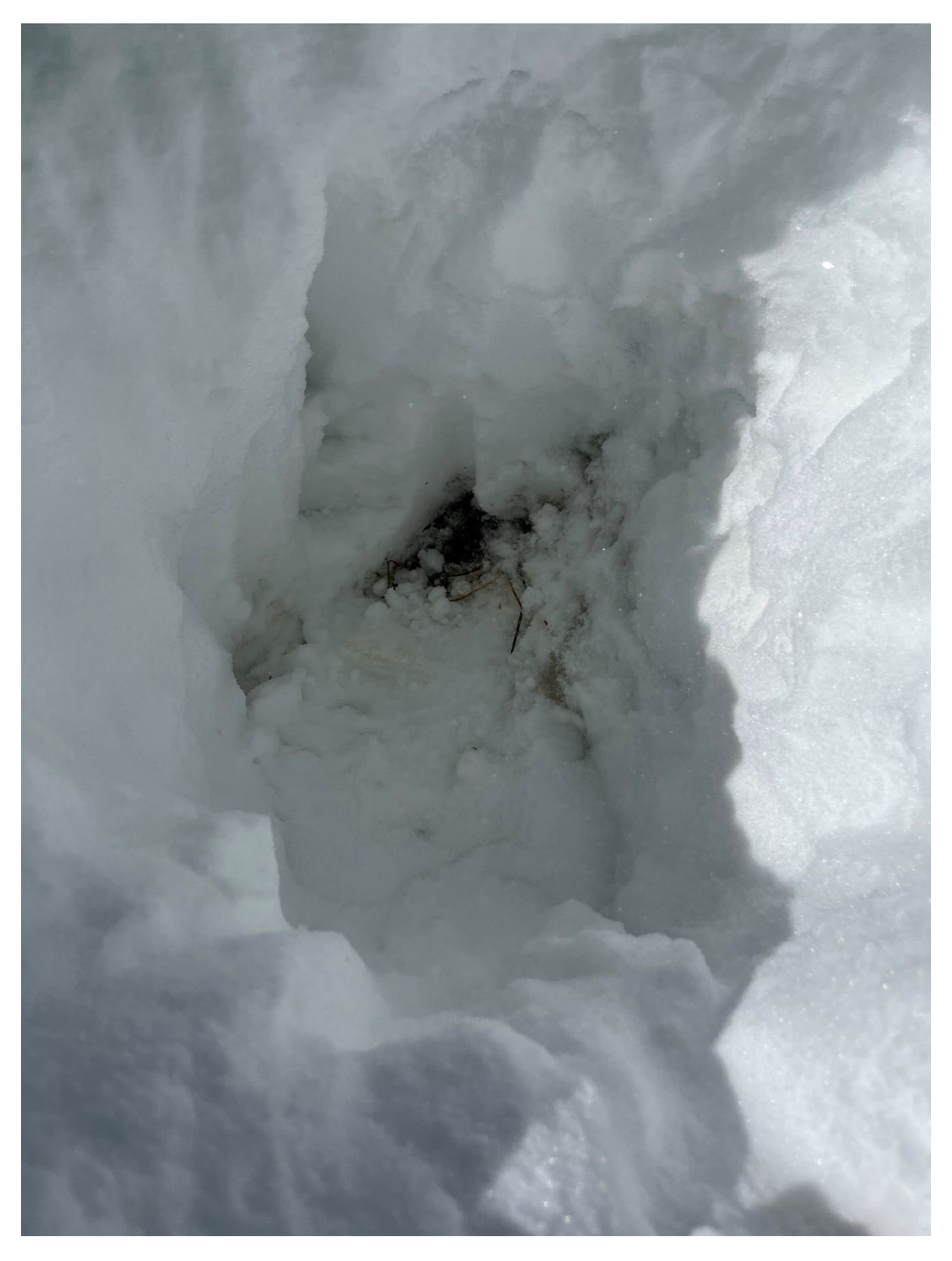
Photograph 3: View of the GV-06 surface water monitoring location after layer of ice was removed. No flowing water was observed at the location.