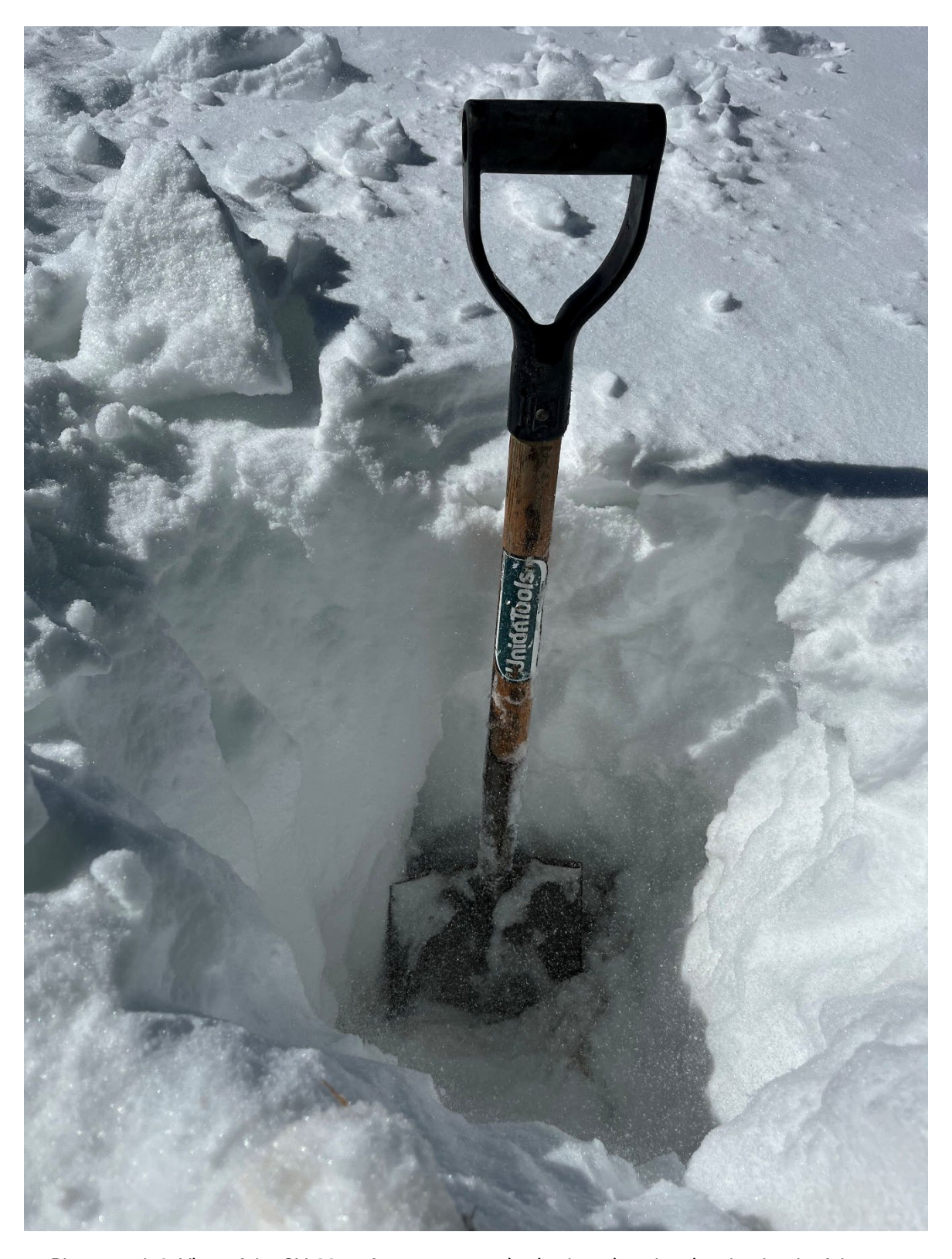
Photograph 3: View of the GV-06 surface water monitoring location showing the depth of the snow.