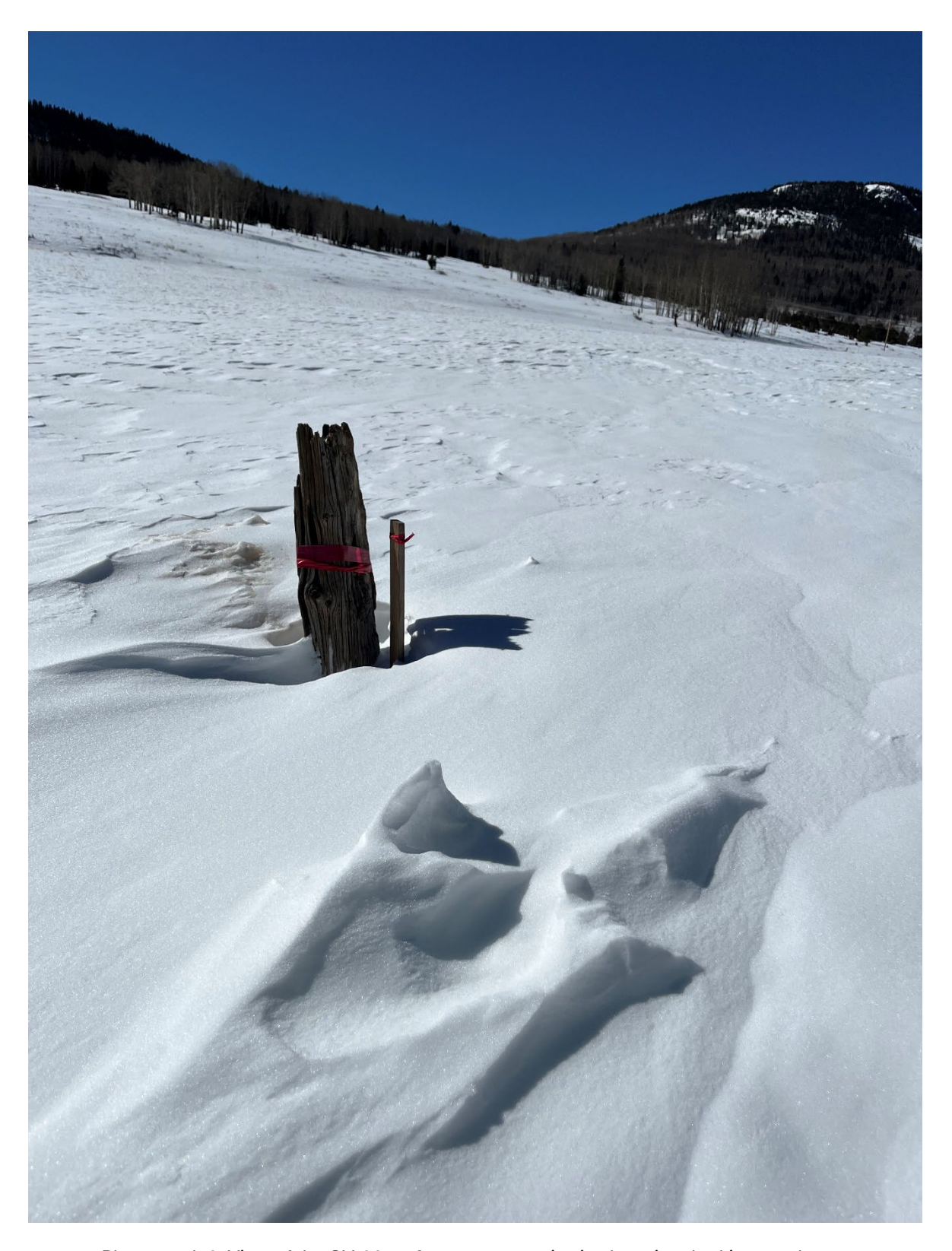
Photograph 2: View of the GV-06 surface water monitoring location, looking southwest