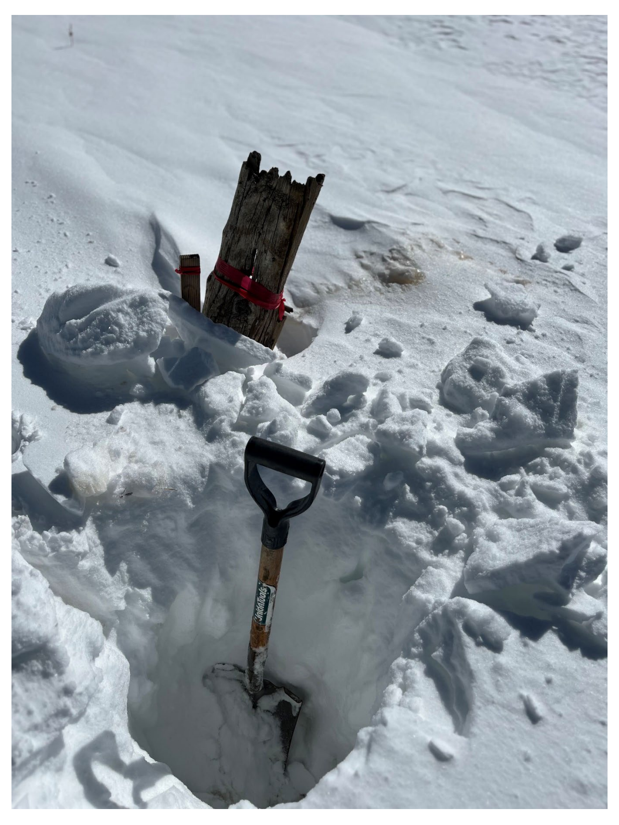
Photograph 3: View of the GV-06 surface water monitoring location. No flowing water was observed at the location.