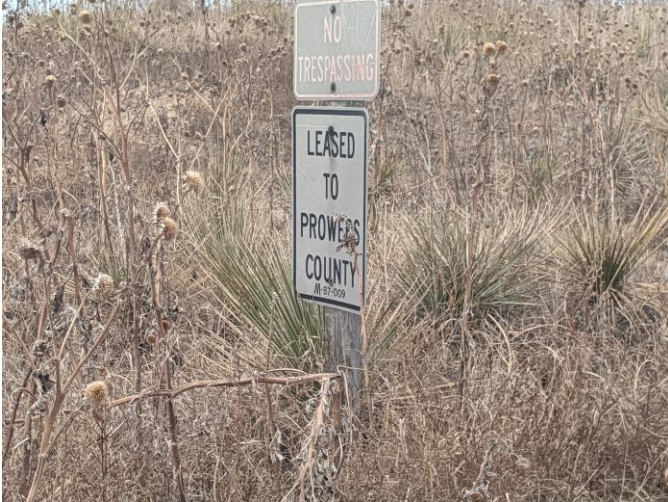
Mine identification sign.