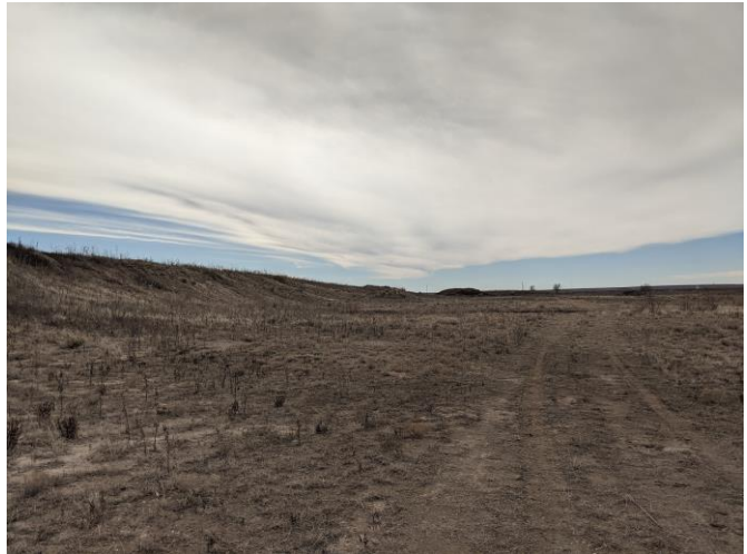
Pit area looking south.