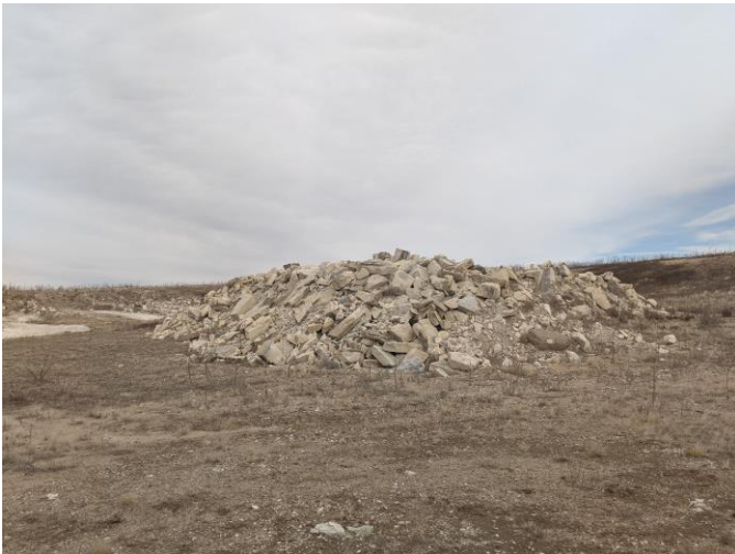
Material stockpile on site.