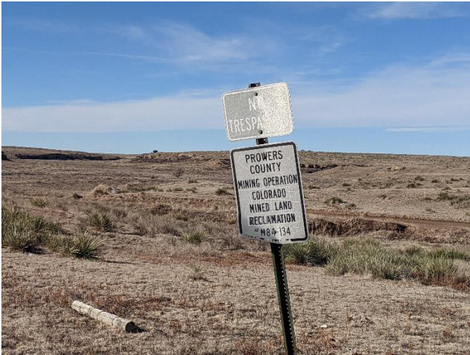
Mine identification sign at gated entrance.