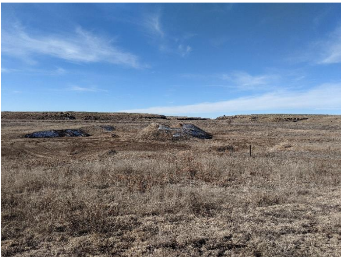
Mine site overview.