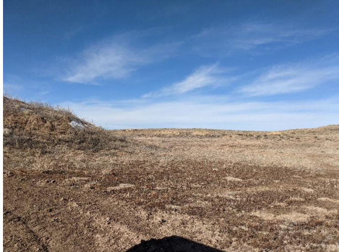
Vegetative growth along pit floor.