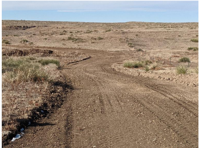
Mine access road.