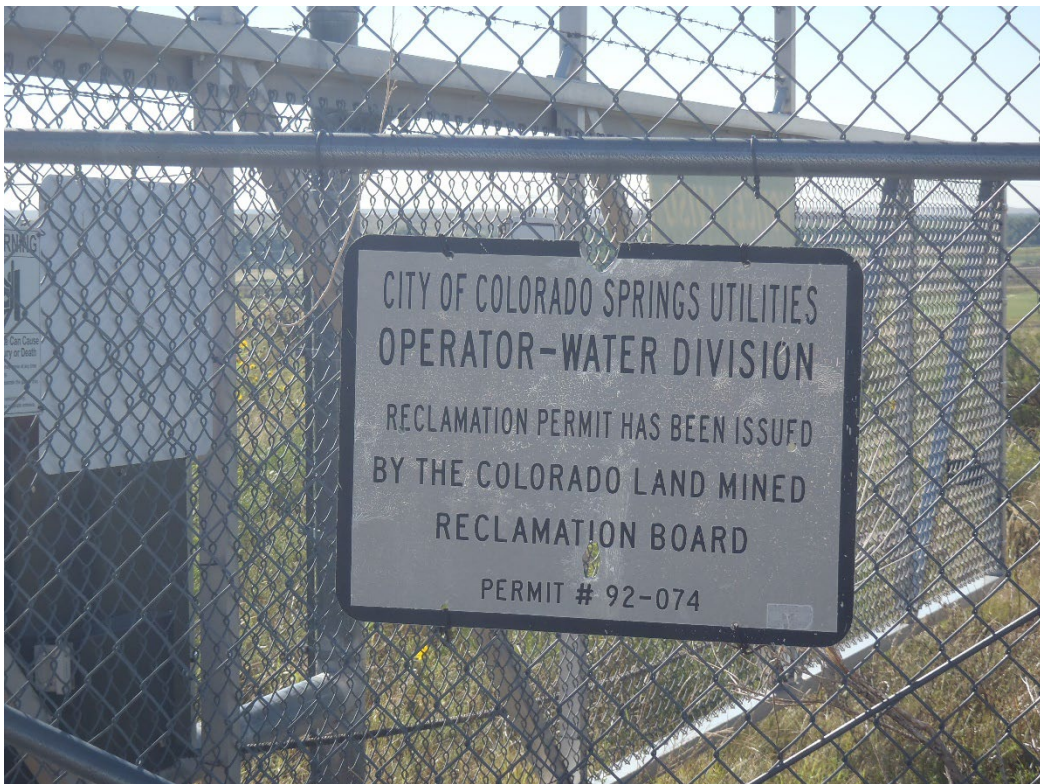
Photo 3. Permit sign at mine entrance.