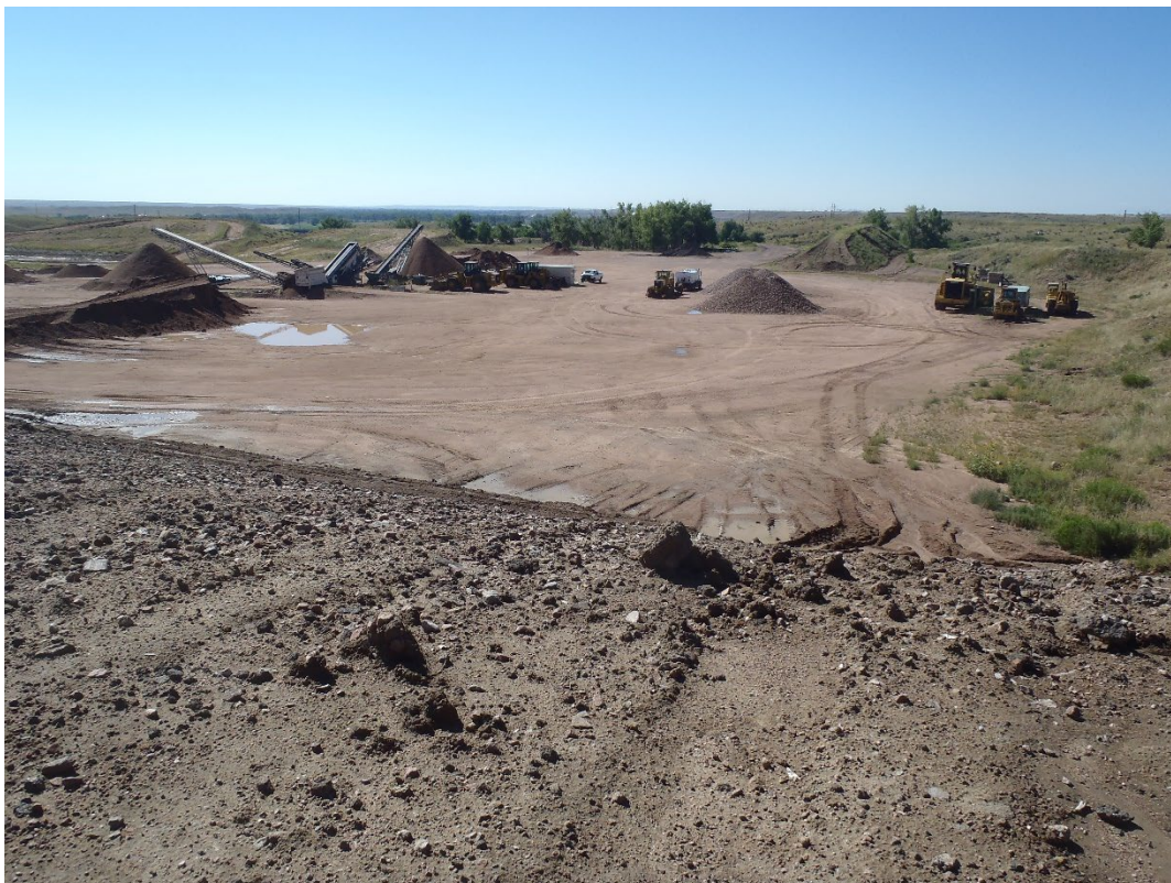
Photo 1. Pit floor and equipment (looking south from top of C&D landfill, note large puddles from rain).