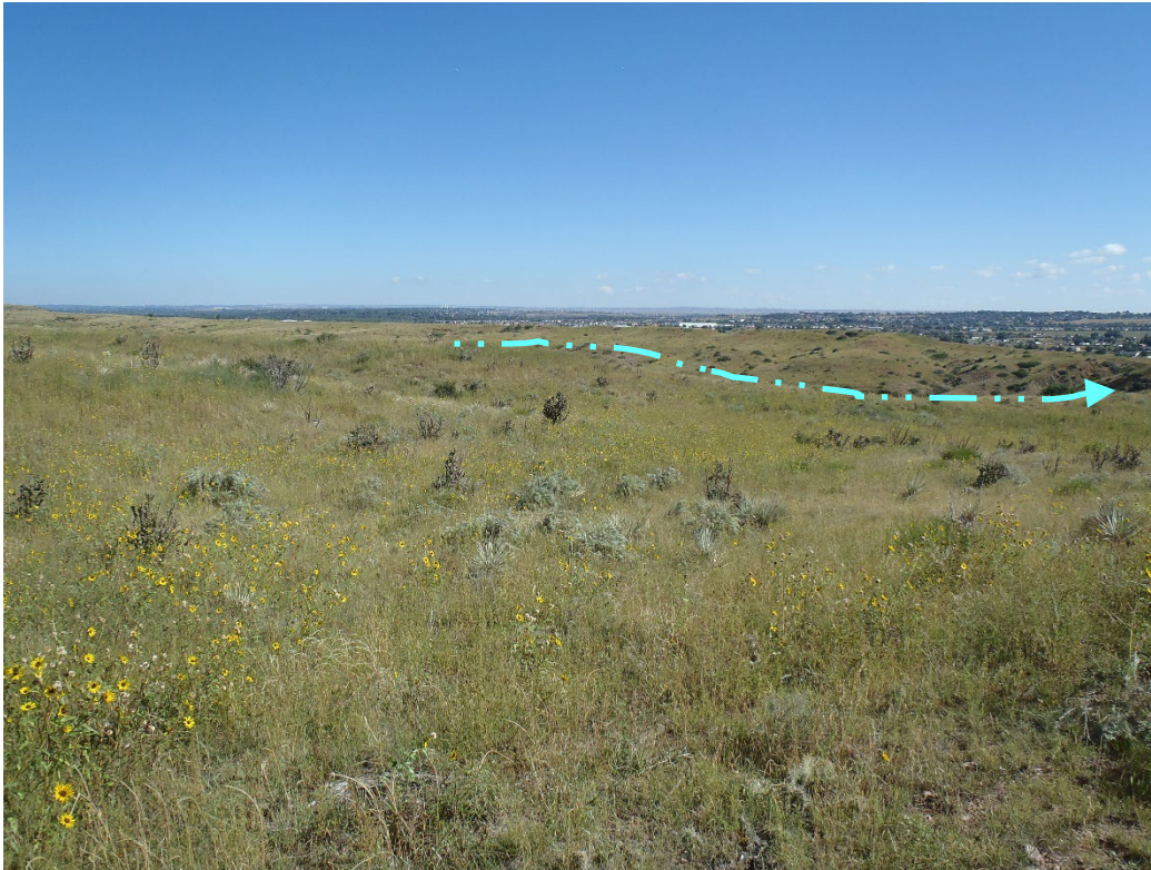
Photo 6. Unnamed drainage on NE side of expansion area – buried non-potable waterline beyond.

Joe Houghton City of Colorado Springs 121 S Tejon St, 4th Floor Colorado Springs, CO 80903