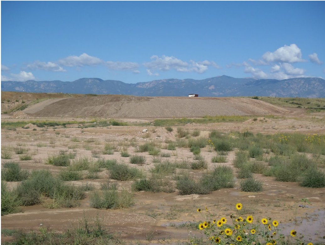
Photo 2. Construction & Demolition landfill on NW corner (looking NW).