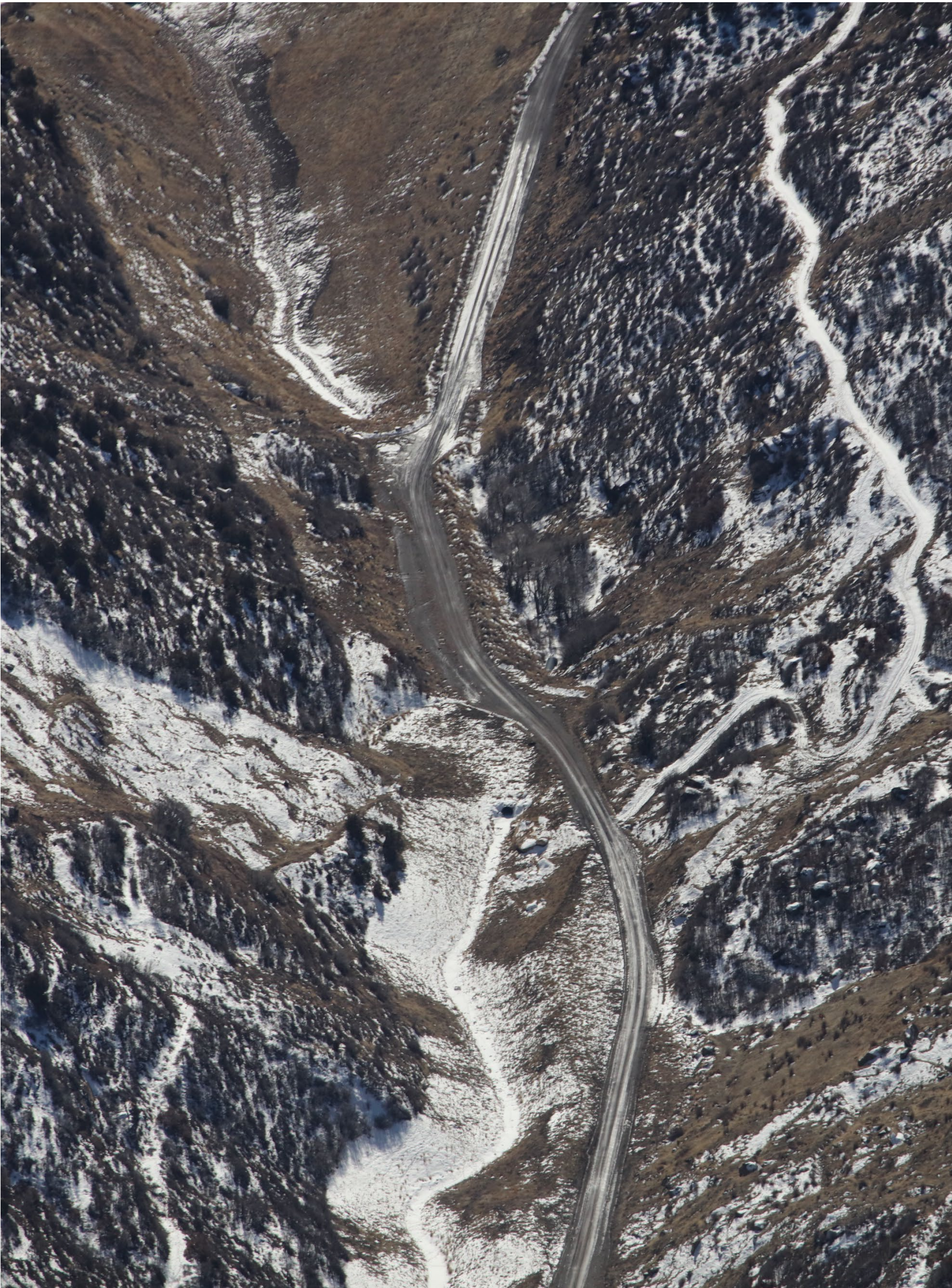
Figure 11: Middle Section of Elk Creek culvert. Powerline road on right, with vehicle tracks visible.

Number of Partial Inspection this Fiscal Year: 6