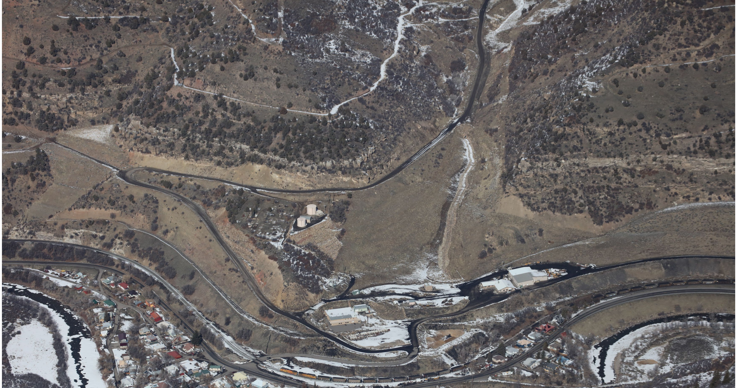
Figure 1: Main facilities from the south

Number of Partial Inspection this Fiscal Year: 6