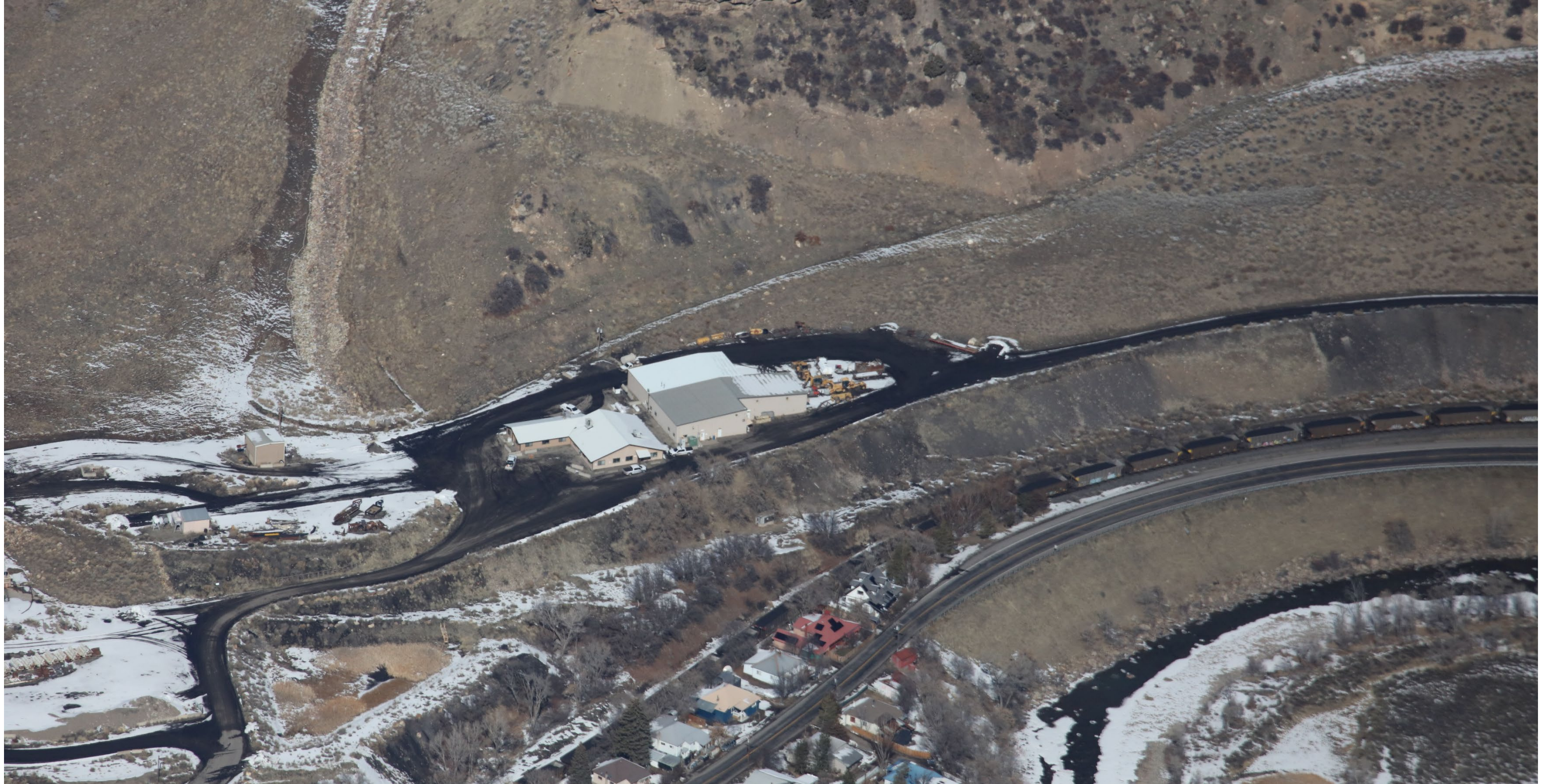
Figure 2: Office and shop, with Pond B in the lower left, and part of the reclaimed East Yard Fill in the upper right

Number of Partial Inspection this Fiscal Year: 6