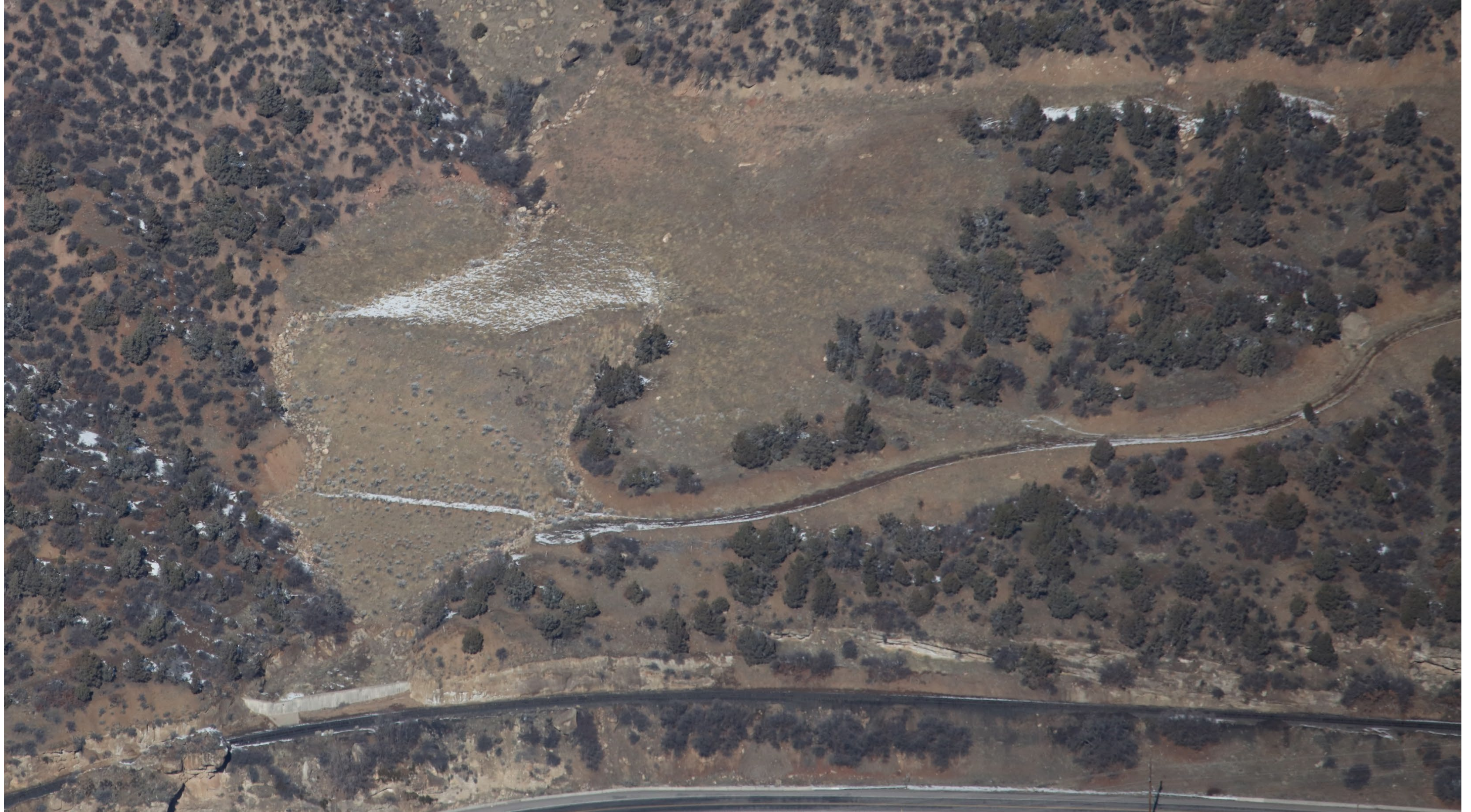
Figure 5: II West Valley Fill and Pond E

Number of Partial Inspection this Fiscal Year: 6