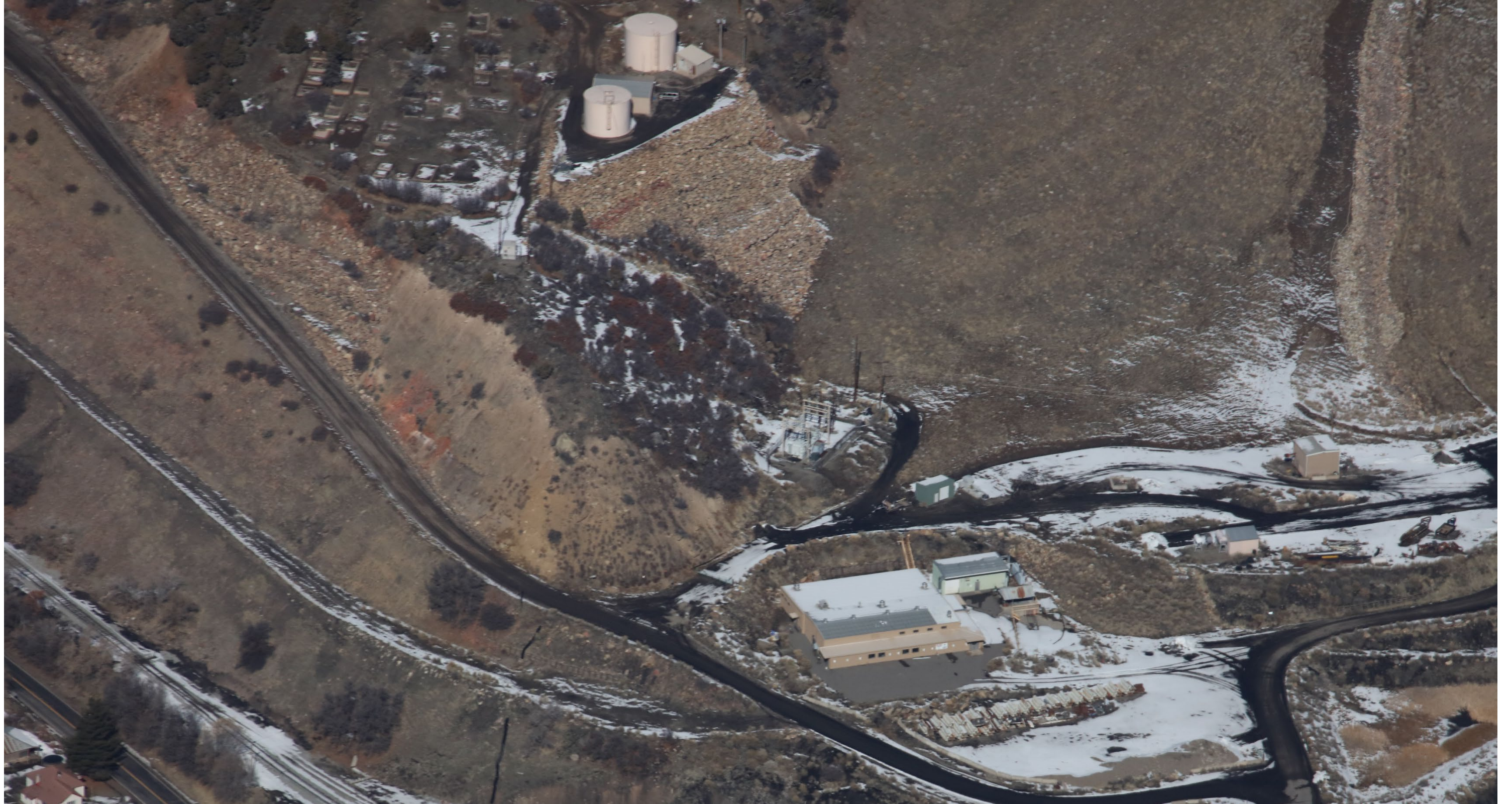
Figure 3: Cemetery, water treatment plant, substation and bath house

Number of Partial Inspection this Fiscal Year: 6