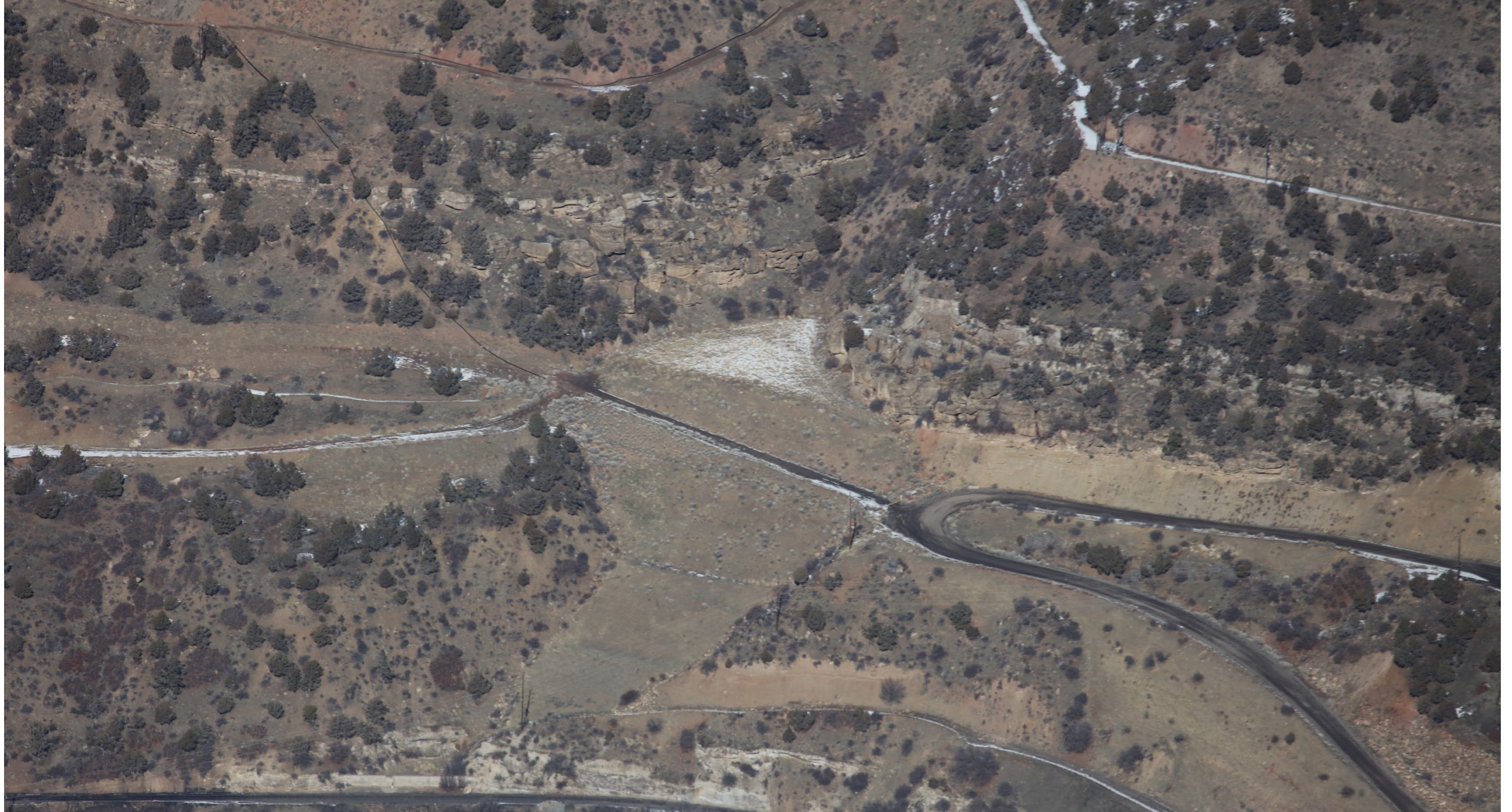
Figure 4: West Valley Fill and Pond C. The water pipeline installed by Gunnison Energy is visible in the upper left.

Number of Partial Inspection this Fiscal Year: 6