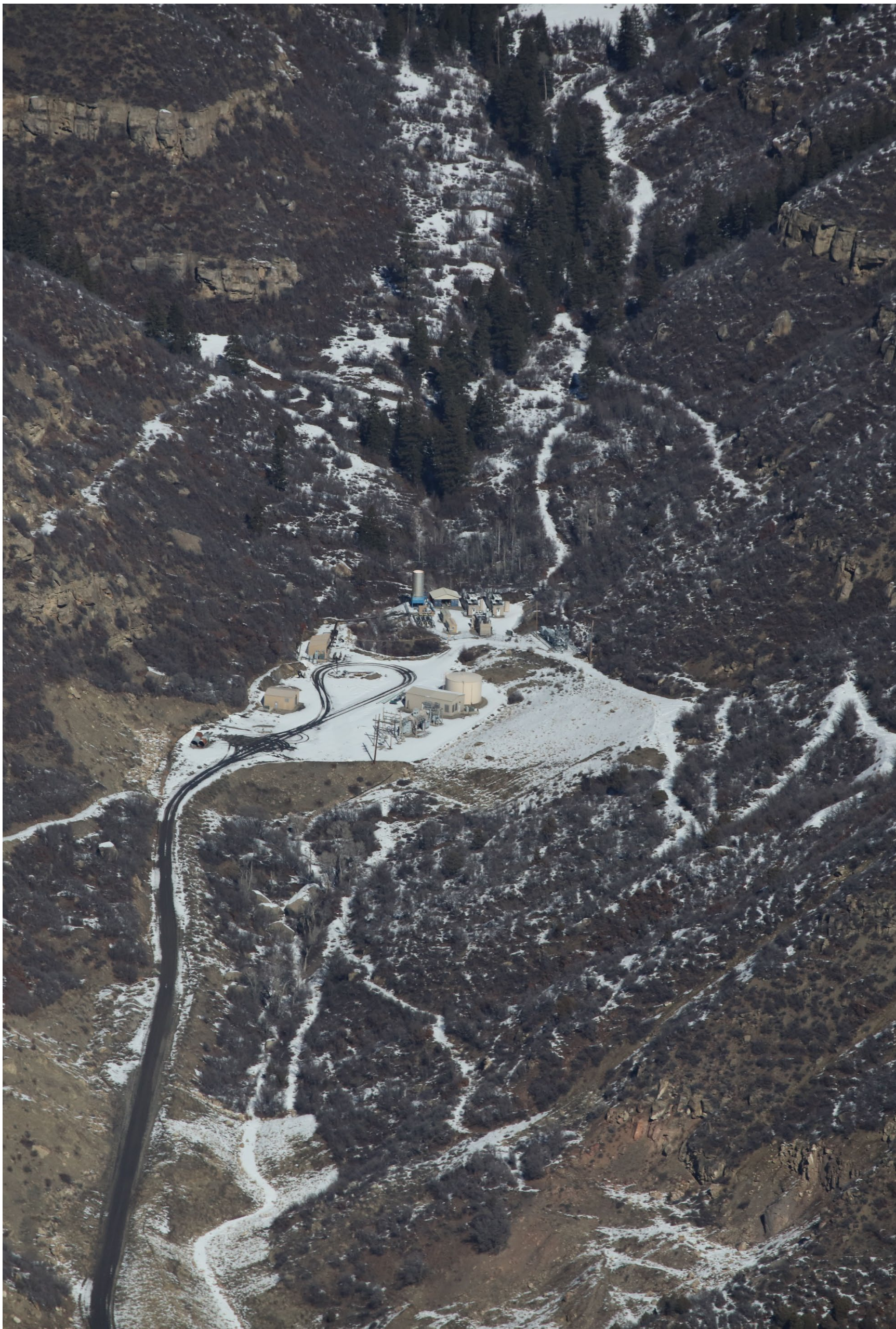
Figure 8: Upper Elk Creek facilities pad

Number of Partial Inspection this Fiscal Year: 6 Number of Complete Inspections this Fiscal Year: 2