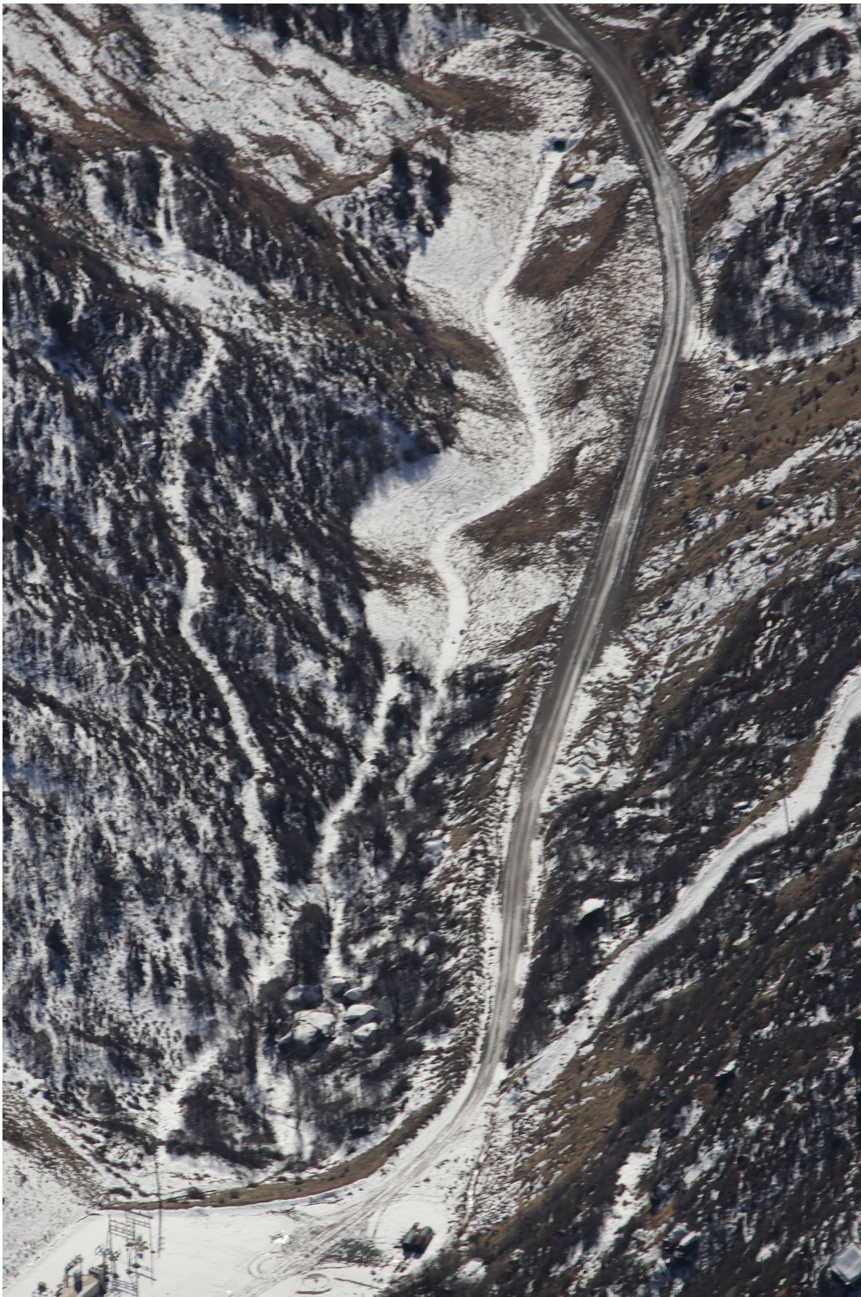
Figure 10: Upper section of reclaimed Elk Creek channel, from north

Number of Partial Inspection this Fiscal Year: 6 Number of Complete Inspections this Fiscal Year: 2