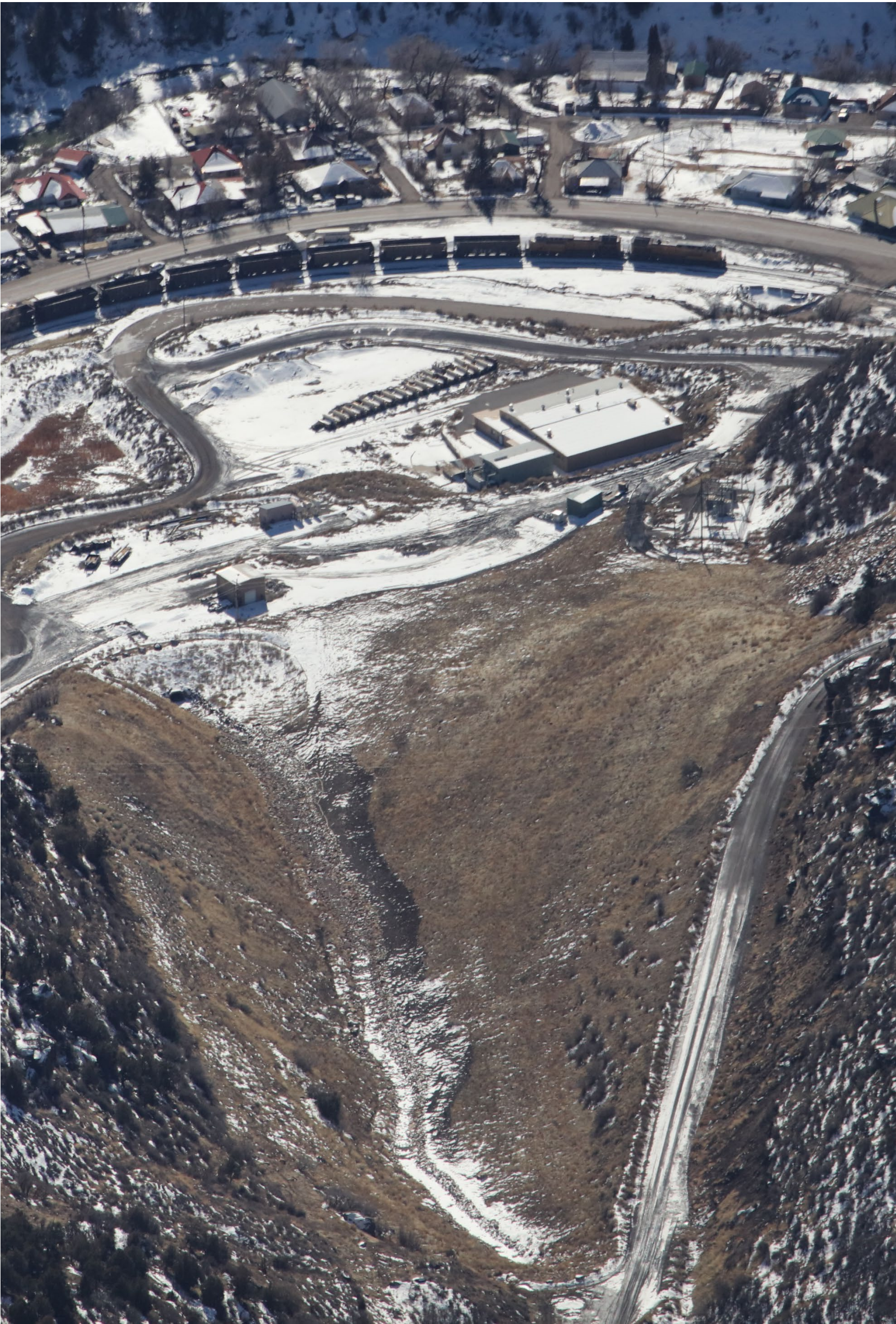
Figure 12: Lower section of reclaimed Elk Creek channel, from north

Number of Partial Inspection this Fiscal Year: 6