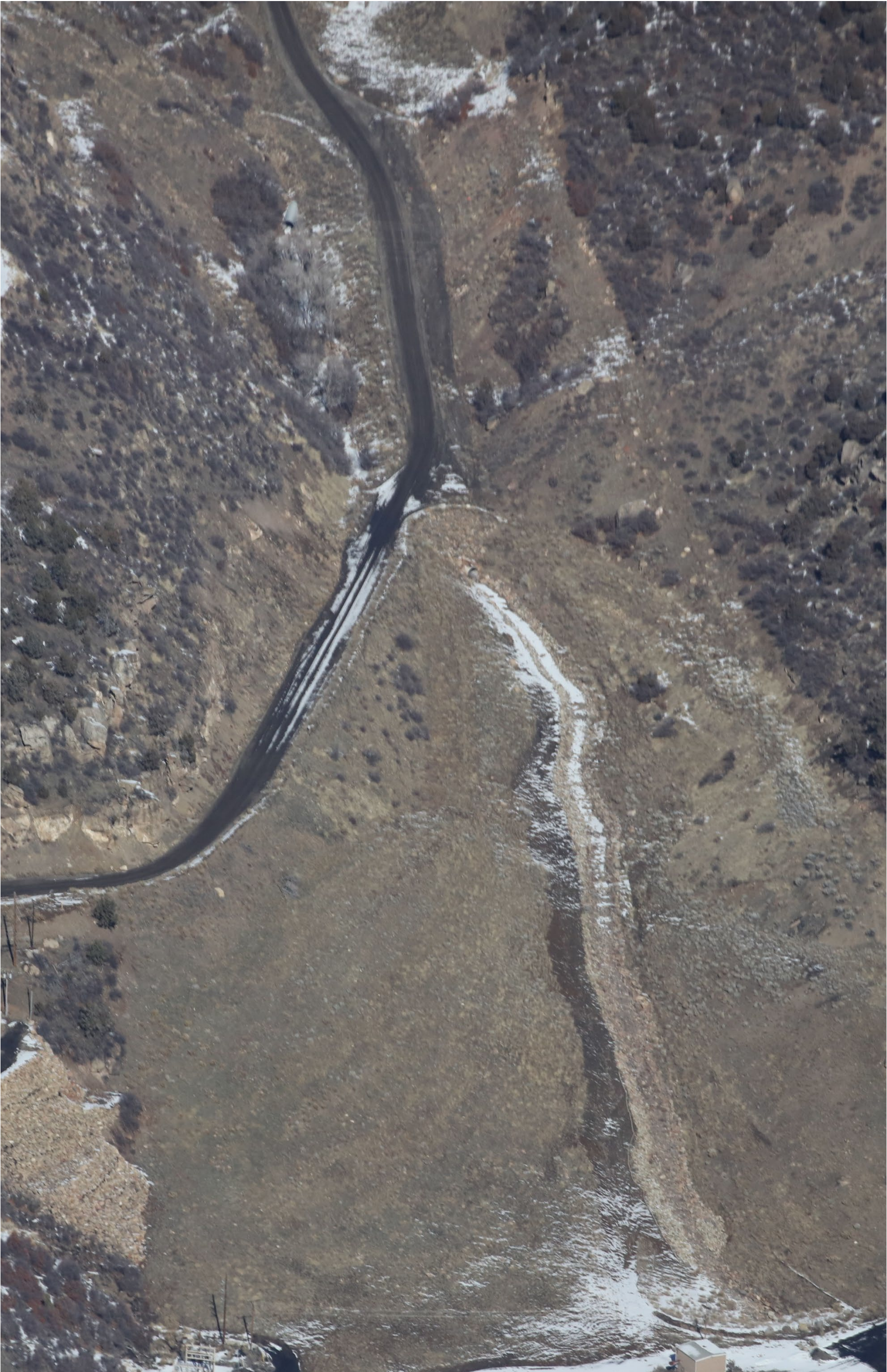
Figure 6: Lower section of reclaimed Elk Creek channel

Number of Partial Inspection this Fiscal Year: 6