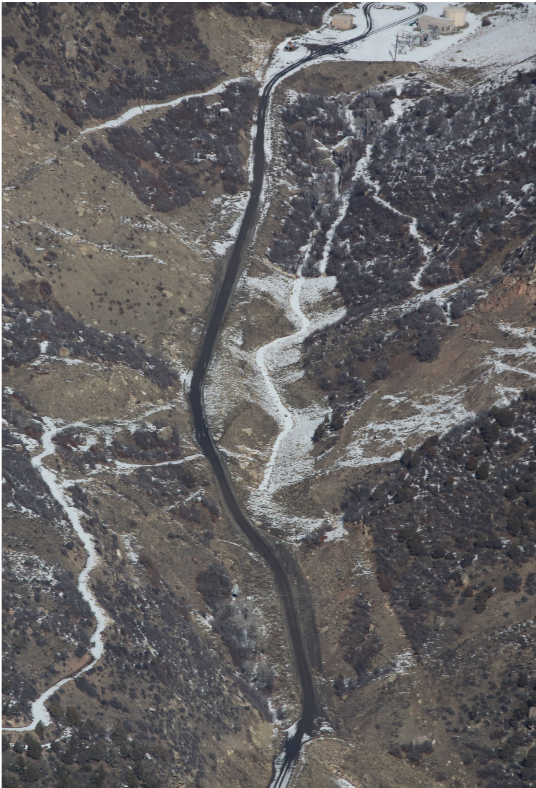
Figure 7: Upper section of reclaimed Elk Creek channel

Number of Partial Inspection this Fiscal Year: 6 Number of Complete Inspections this Fiscal Year: 2