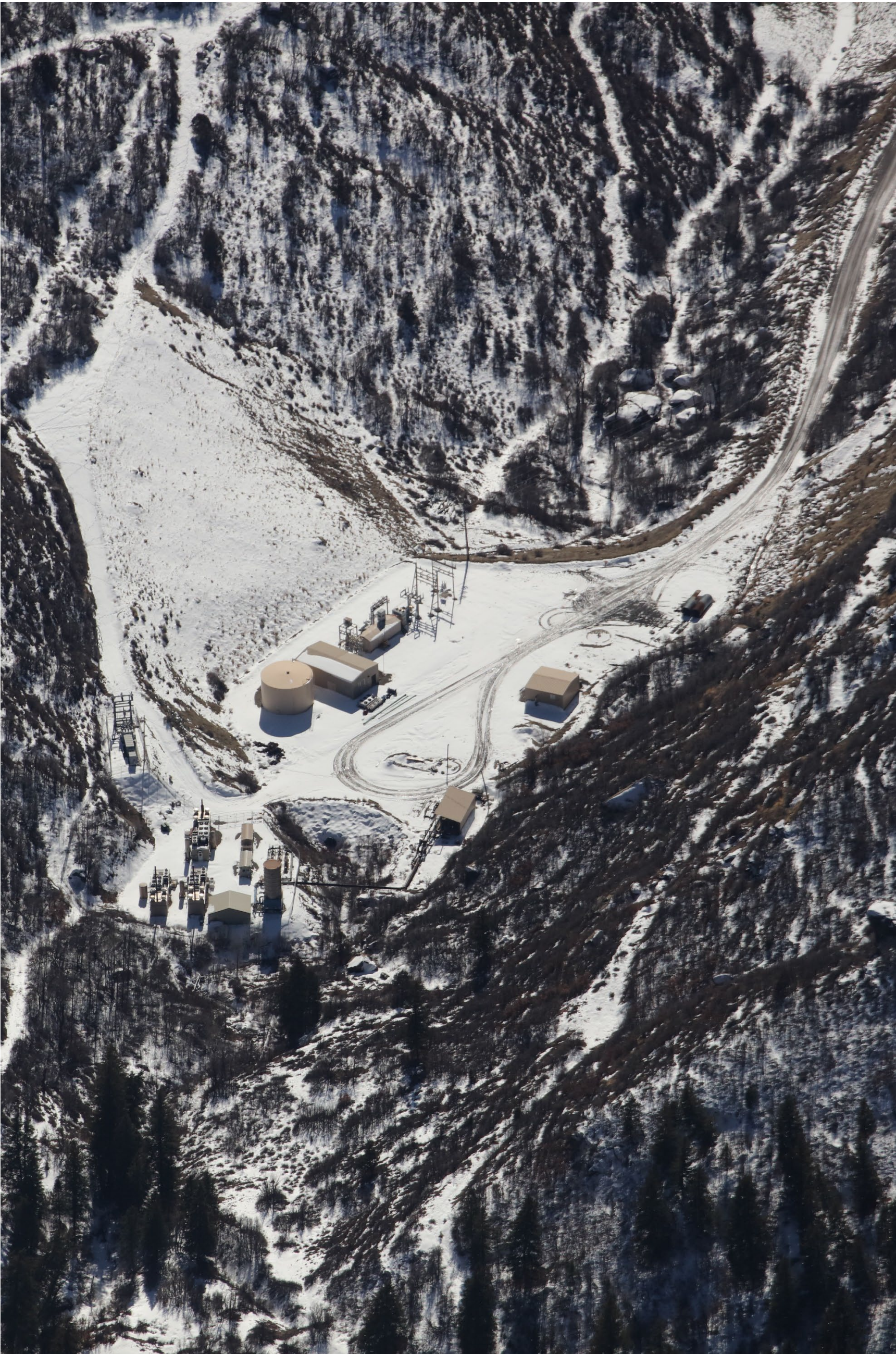
Figure 9: Upper Elk Creek facilities pad, from north

Number of Partial Inspection this Fiscal Year: 6 Number of Complete Inspections this Fiscal Year: 2