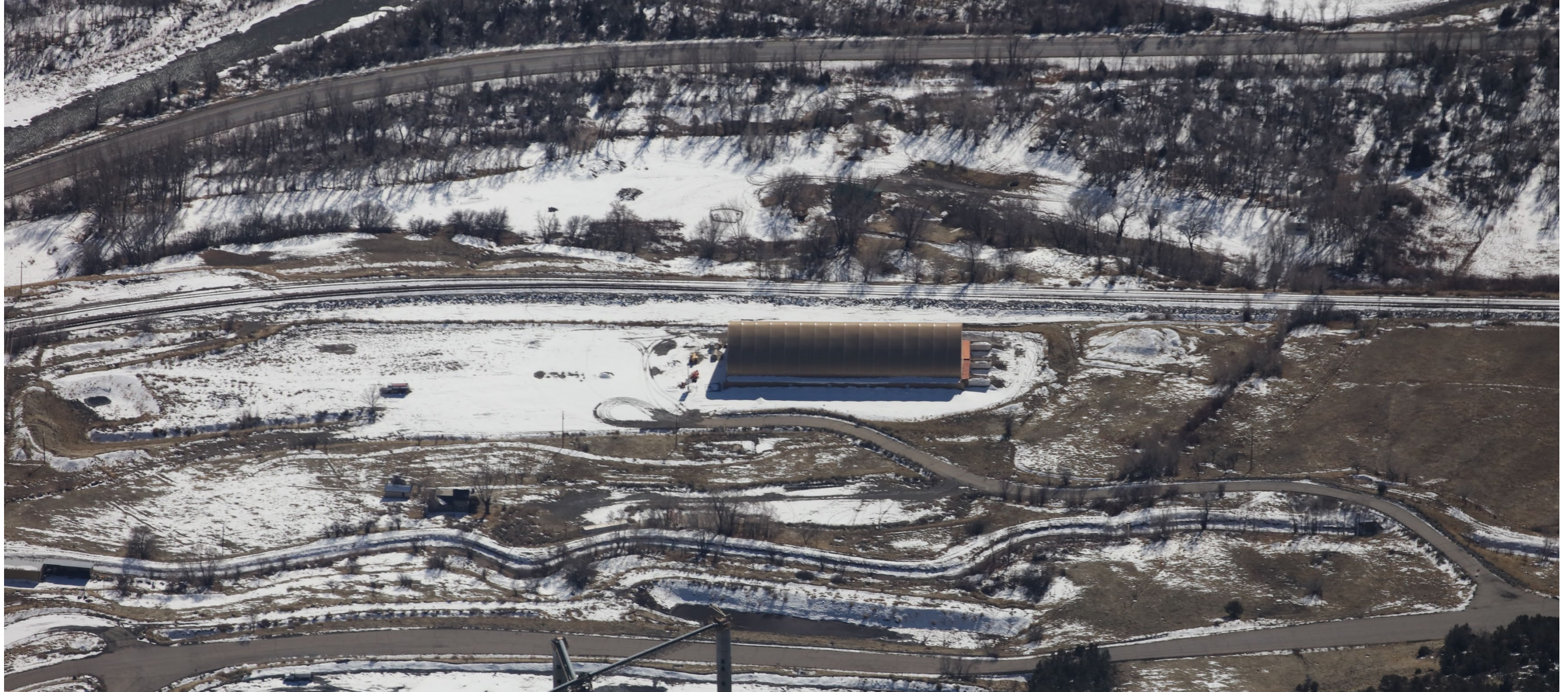
Figure 2: Terror Creek Loadout site from the north

Number of Partial Inspection this Fiscal Year: 6