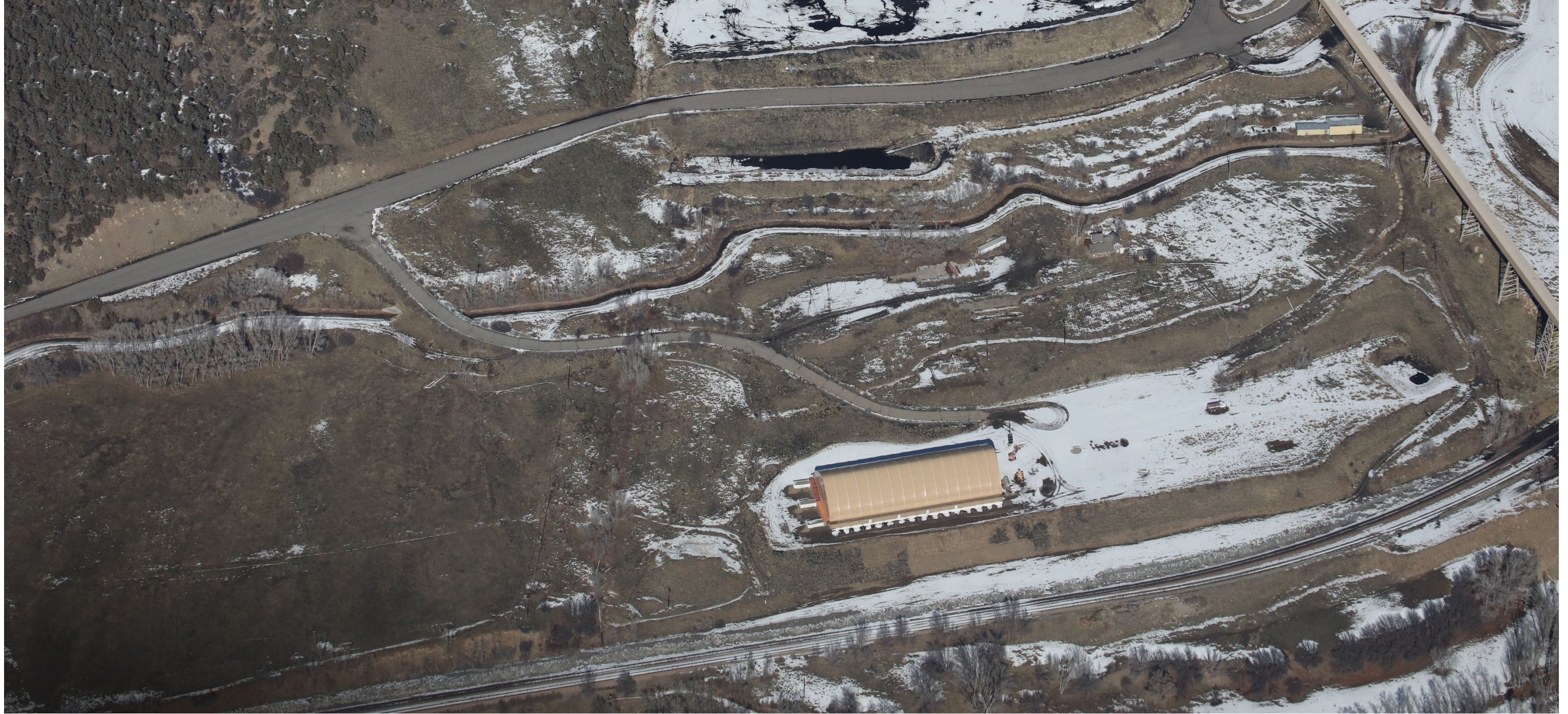
Figure 1: Terror Creek Loadout site from the south

Number of Partial Inspection this Fiscal Year: 6