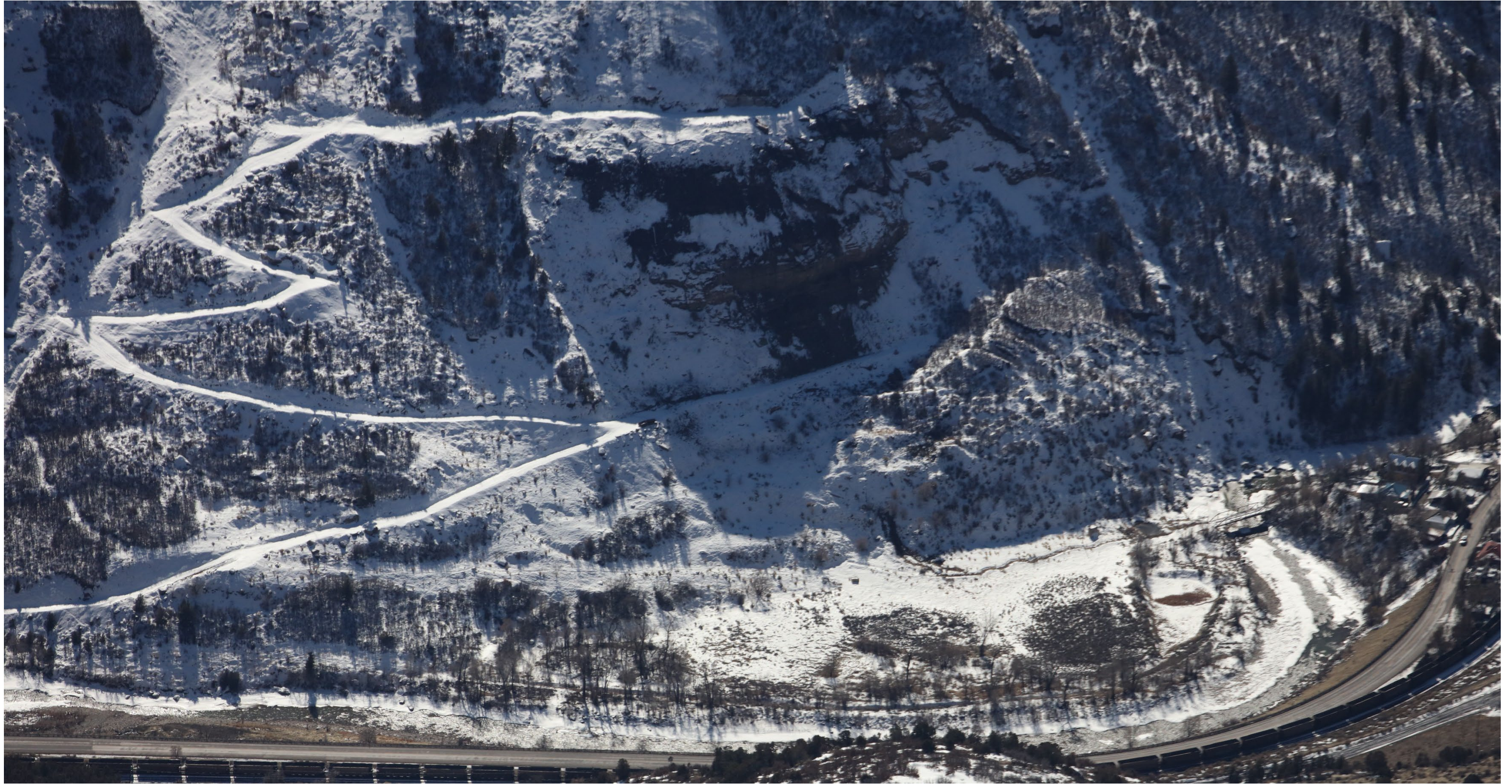
Figure 1: Bear Mine