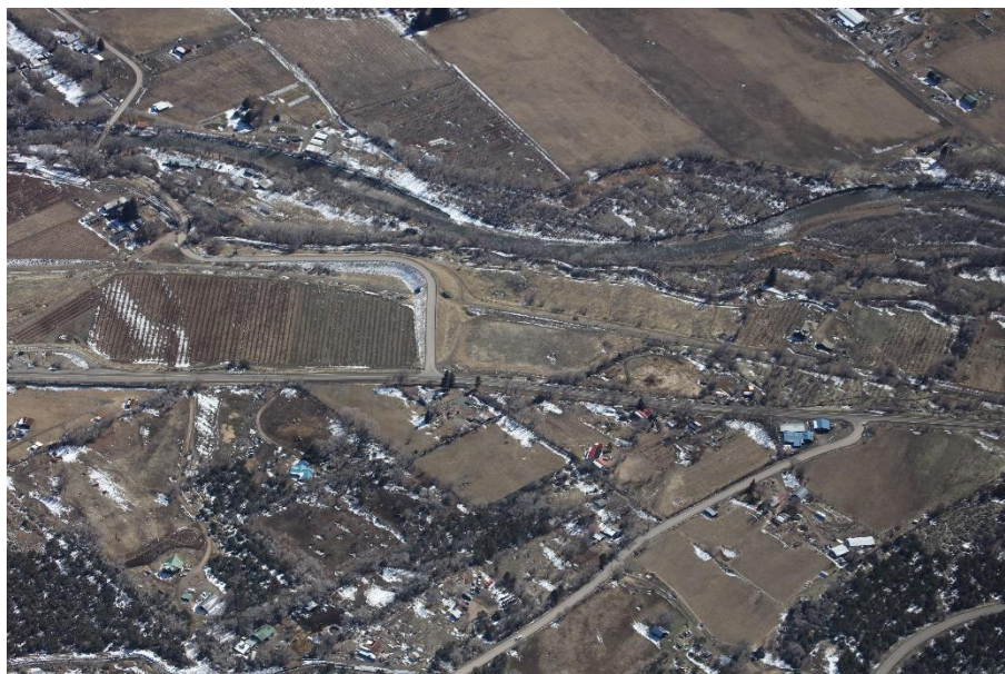
Coal storage area by highway, including pond

Number of Partial Inspection this Fiscal Year: 5