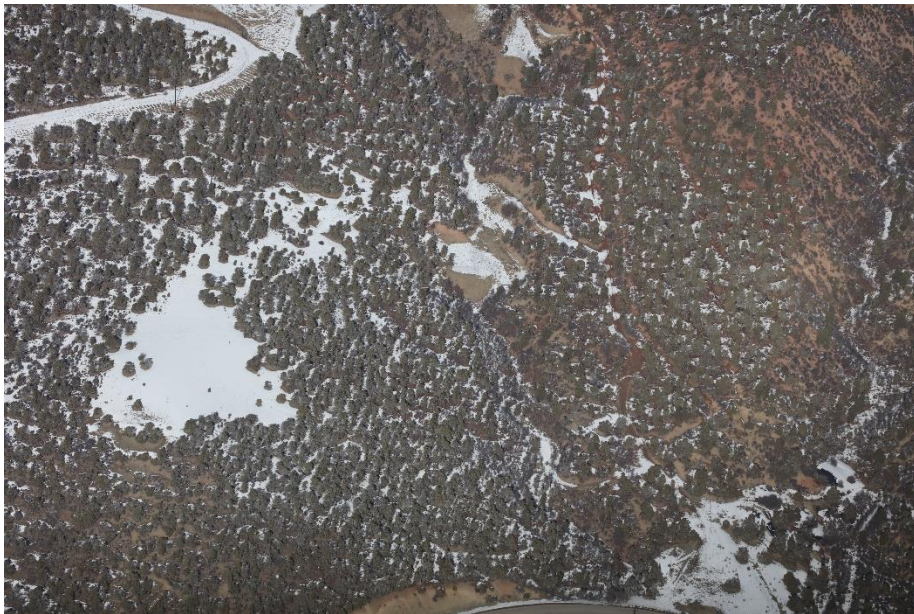
Drainage near Pond 3 and Pond 4

Number of Partial Inspection this Fiscal Year: 5