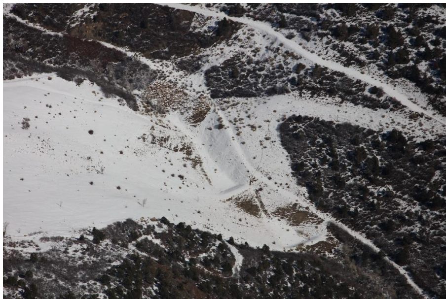
Lower portion of West Mine, including ponds