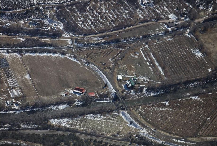
Loadout “Y” and adjacent bridge