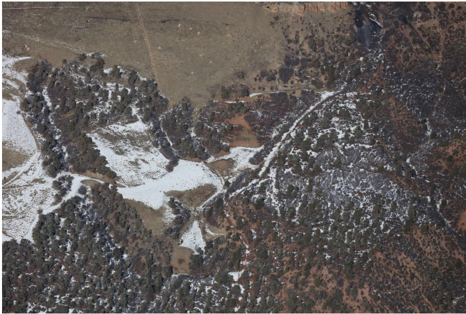
Drainage near Pond 1 and Pond 2