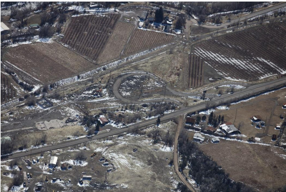
Western portion of loadout with entrance and substation

Number of Partial Inspection this Fiscal Year: 5