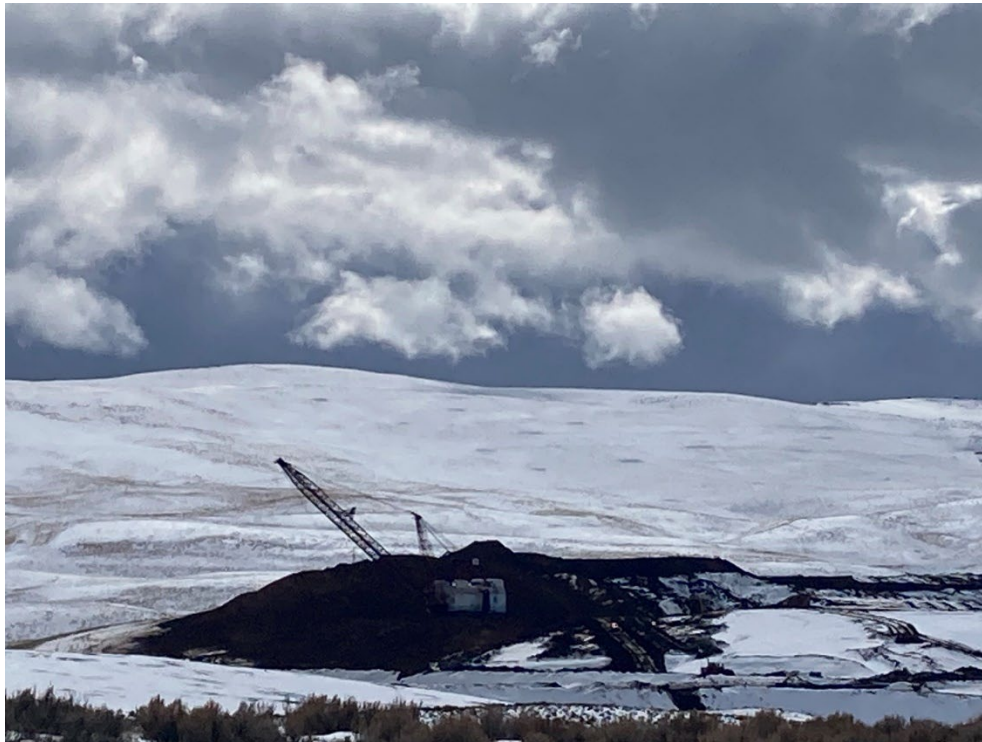
Photo 2: N Pit, and Queen Ann dragline from a distance looking south.

Number of Partial Inspection this Fiscal Year: 5