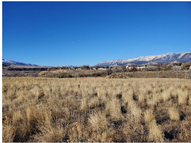
Photo 6: View to the southwest of undisturbed area to the northeast of the mining area.