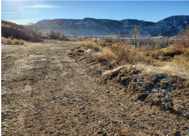
Photo 3: View to the southeast of berm to control sediment in mining area.