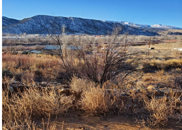
Photo 4: View to the south of Salt Cedar within the permit boundary.