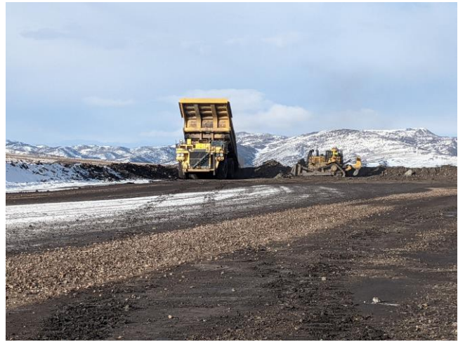
Spoil placement above Collom Pit.