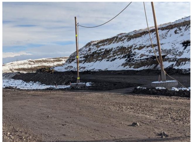
Fill placement at along entrance Collm Pit haul road.