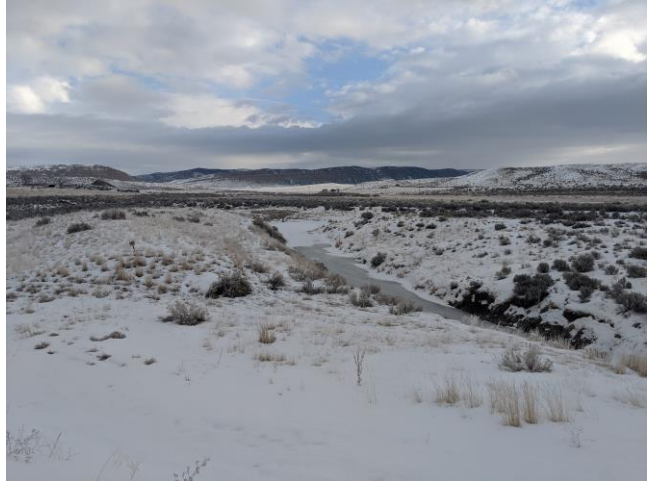
Stoker Siding Pond.