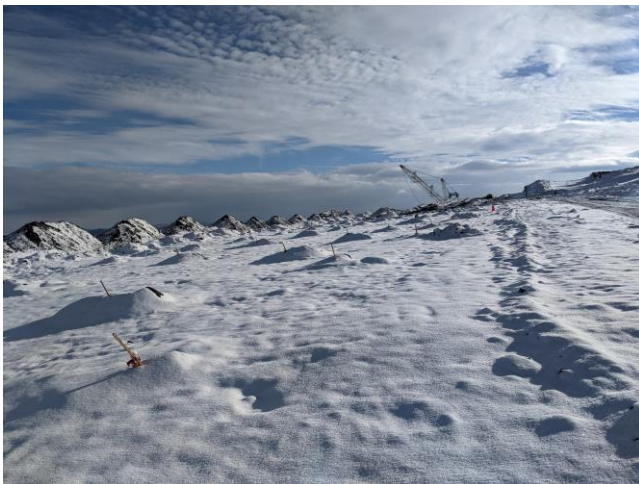
Blast holes at Collom Pit.

Marked blast holes were observed in overburden along the southern portion of the Collom Pit. The blast was not observed and did not occur during the inspection.