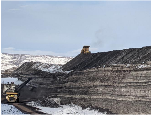
Spoil placement above Collom Pit.

Excess spoil was being hauled by truck/shovel operations to the Collom Spoil Pile. Spoil was currently being placed just above the northwestern section of the Collom Pit highwall.