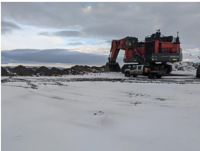
Excavator on top of South Taylor Spoil Pile.

Additional fill placement was observed along the entrance of the eastern section of the Collom Pit. It appeared this spoil was to ramp up to from the current elevation of the Collom in-pit haul road to this portion of the Collom Pit. No issues were observed.