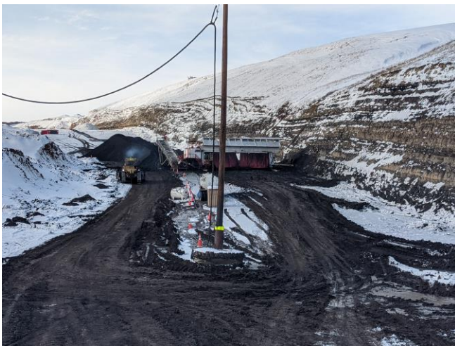
Highwall mining operations in Little Collom Gulch.

Highwall mining operations were currently in the Little Collom Gulch operating to west. Operations appear to moving to the north based on the previous Division's inspection.