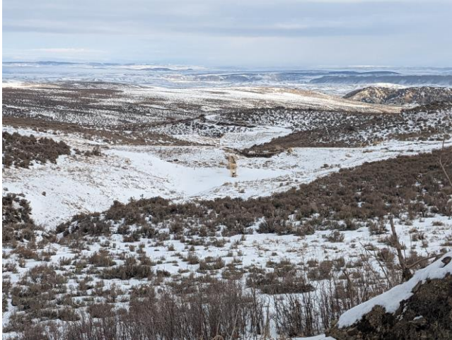
Section 36 Pond.

Ponds associated with the Gossard Loadout were inspected. This included the Stoker Siding, Gossard and Rail Loop. Each pond held water during the inspection. The Rail Loop and Gossard Pond are designed for full containment and do not discharge. Discharge could not be observed at the Stoker Siding Pond from the vantage point of the picture. Each pond was stable with no issues.