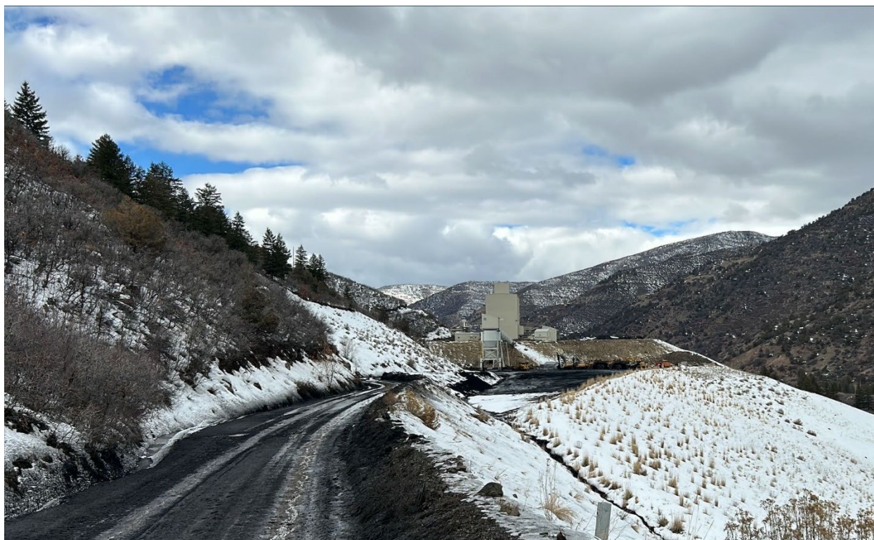
Figure 4: All material moved from temporary stockpile on RPE

Number of Partial Inspection this Fiscal Year: 6