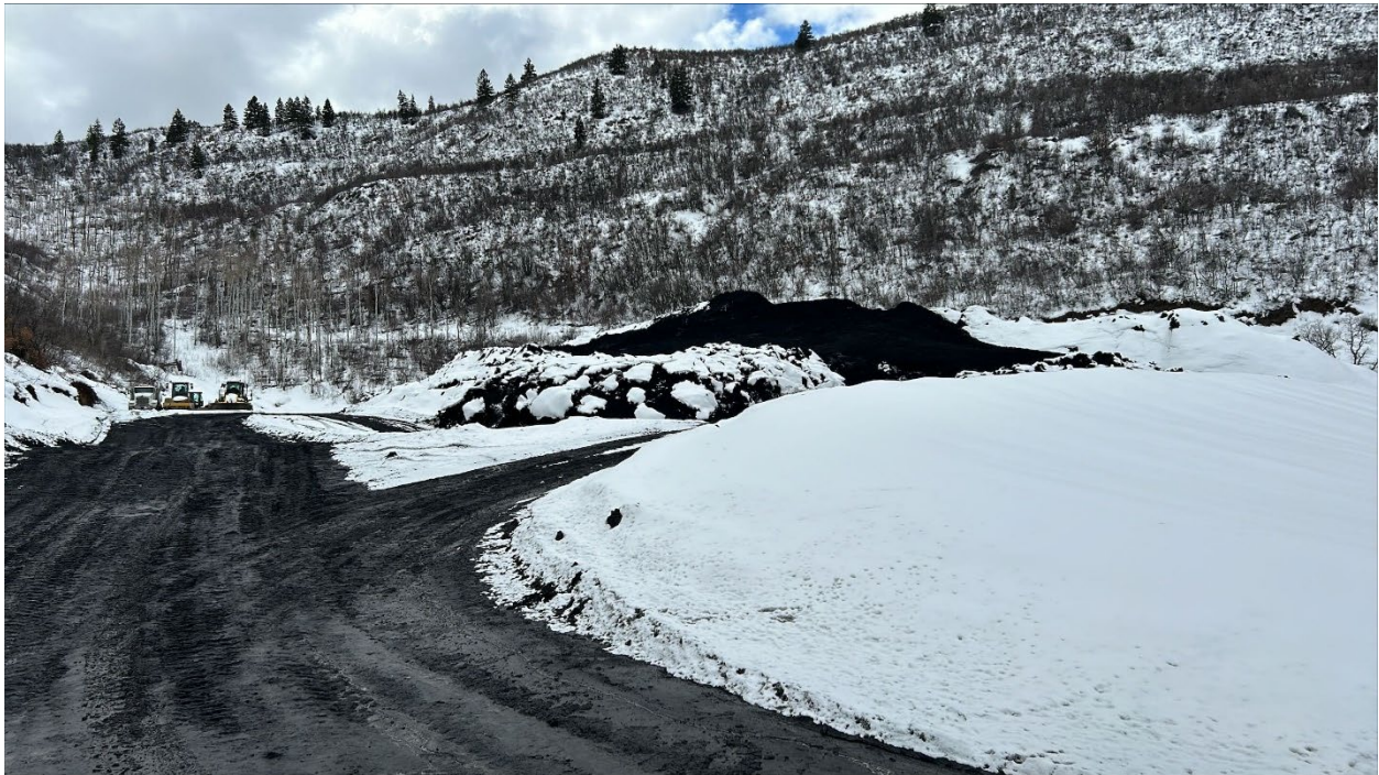
Figure 1: Loosely piled material on RPEE (1 of 3)