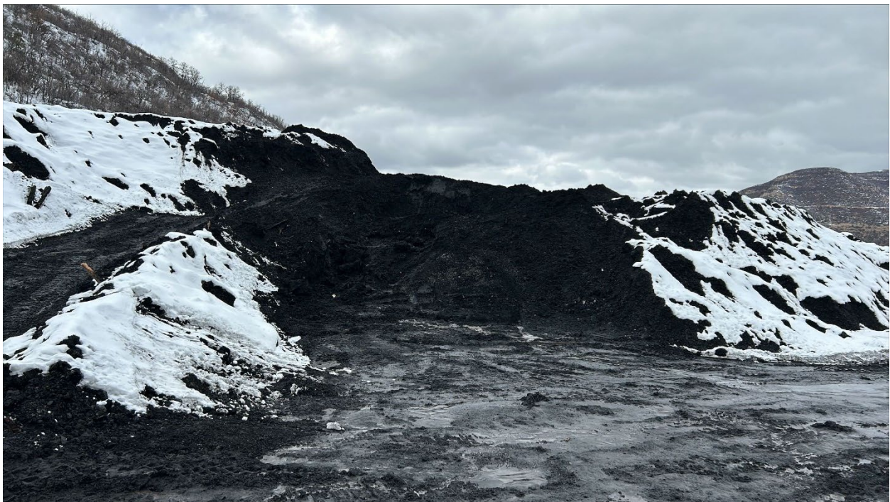
Figure 2: Loosely piled material on RPEE (2 of 3)

Number of Partial Inspection this Fiscal Year: 6