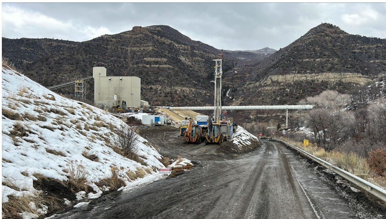
Figure 6: Box Canyon North Well under construction

Number of Partial Inspection this Fiscal Year: 6