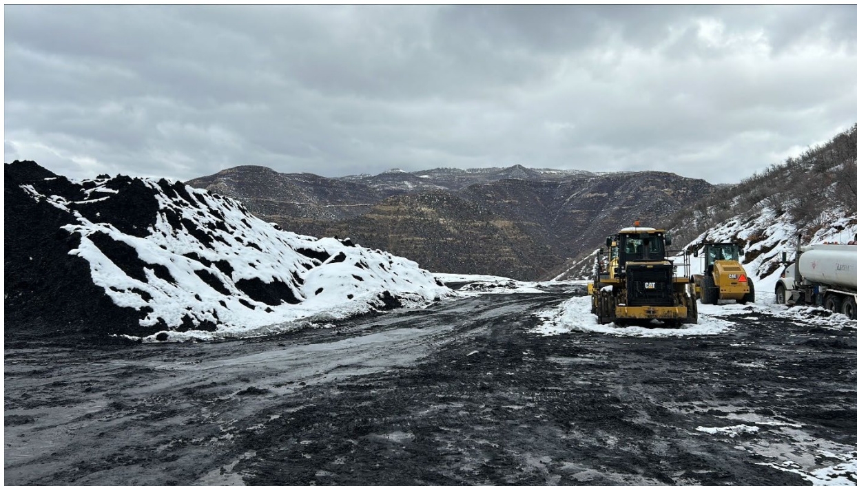
Figure 3: Loosely piled material on RPEE (3 of 3)