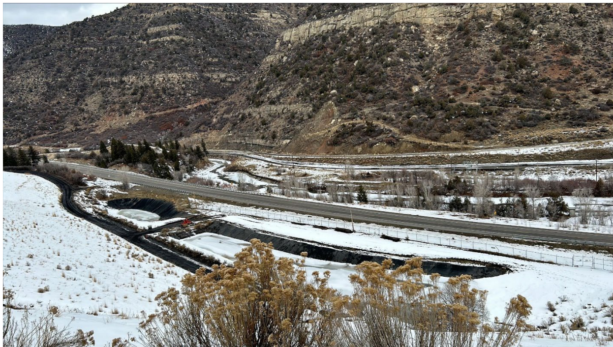
Figure 5: RPE pond