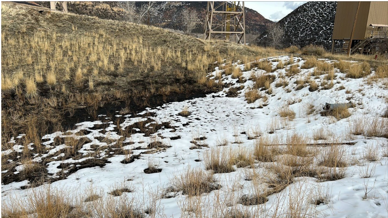
Figure 5: Sediment pond

Number of Partial Inspection this Fiscal Year: 5