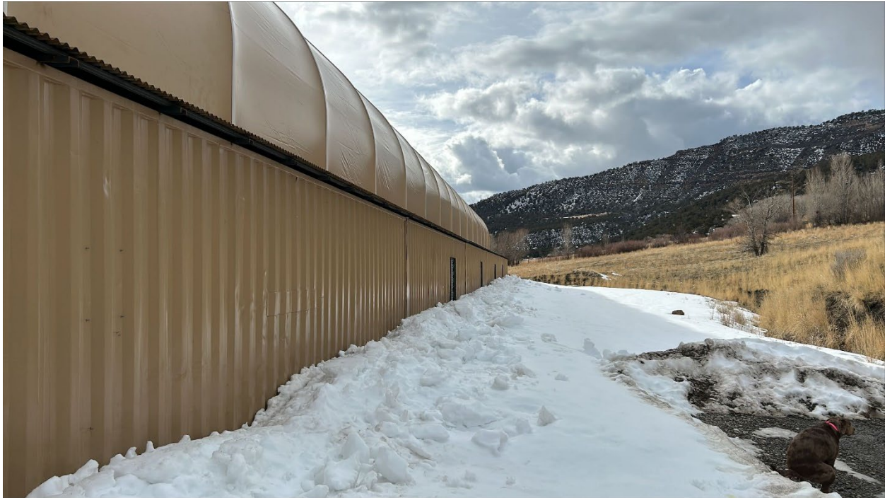
Figure 4: Snow shed from roof on north side of temporary building