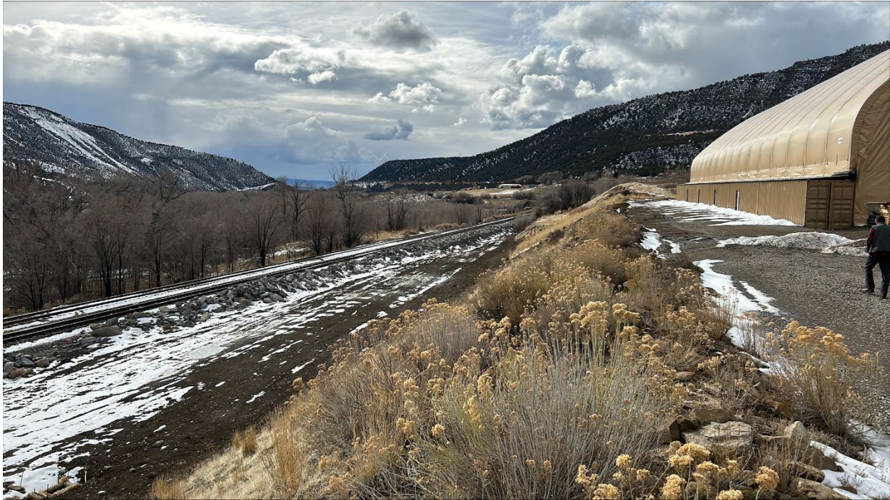
Figure 1: Southern edge of lower pad and embankment

No enforcement actions were initiated as a result of this inspection, nor are any pending.