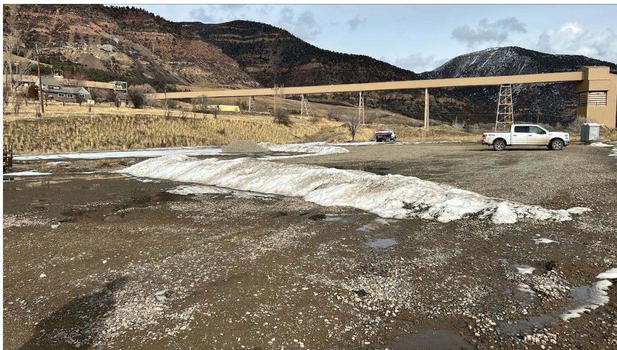
Figure 3: Graveled area at western end of lower pad draining well

Number of Partial Inspection this Fiscal Year: 5