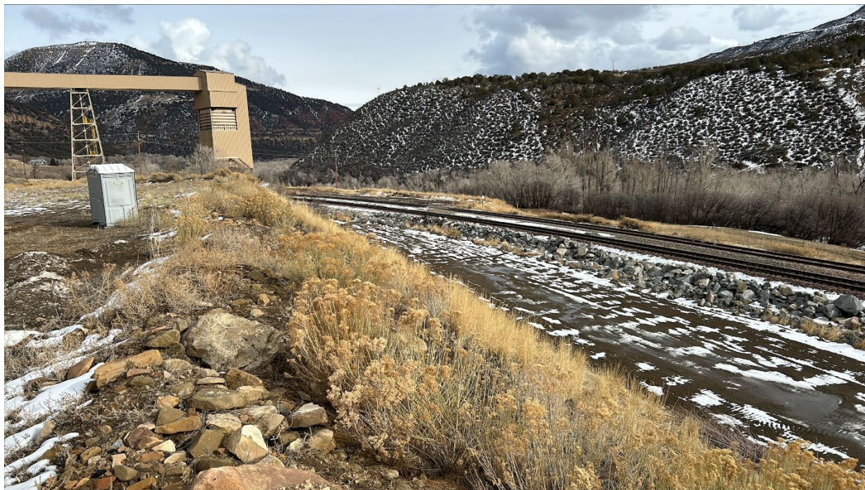
Figure 2: Portaloo on the lower pad