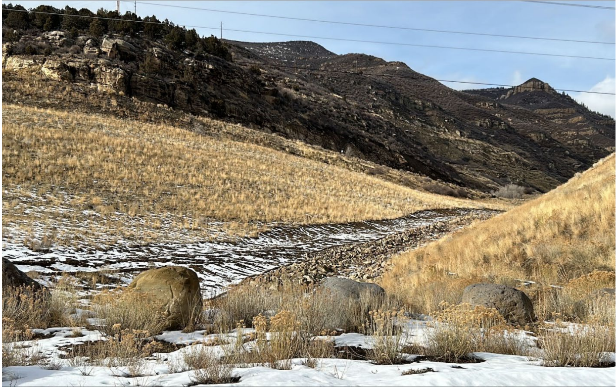
Figure 1: Lower section of reclaimed Elk Creek channel

Number of Partial Inspection this Fiscal Year: 5