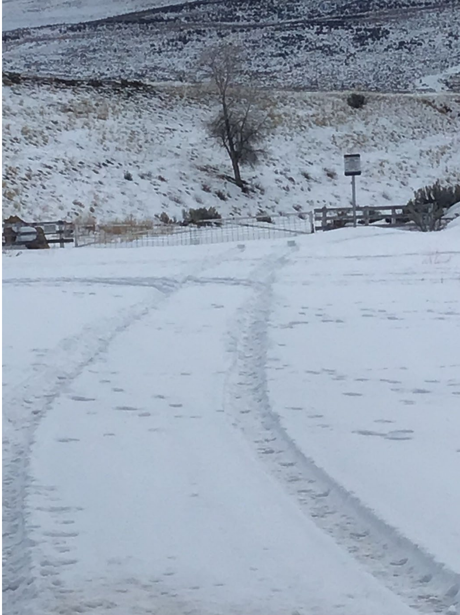
Photo 1: Mine Identification sign at site entrance for Highway 13.

No enforcement actions were initiated as a result of this inspection, nor are any pending.