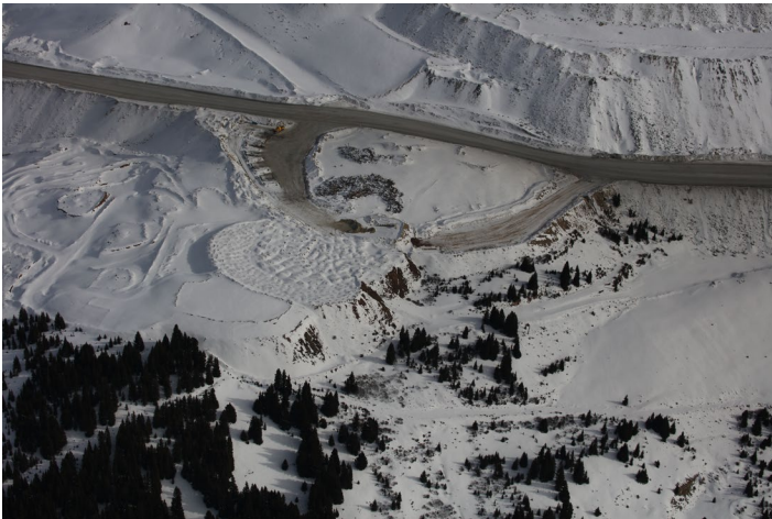
North 40 OSF

No problems or violations were noted during this inspection.