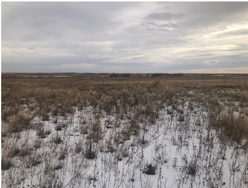
Looking east from Area 43 (in foreground) towards the reclaimed Long Term Spoil Area

Number of Partial Inspection this Fiscal Year: 4