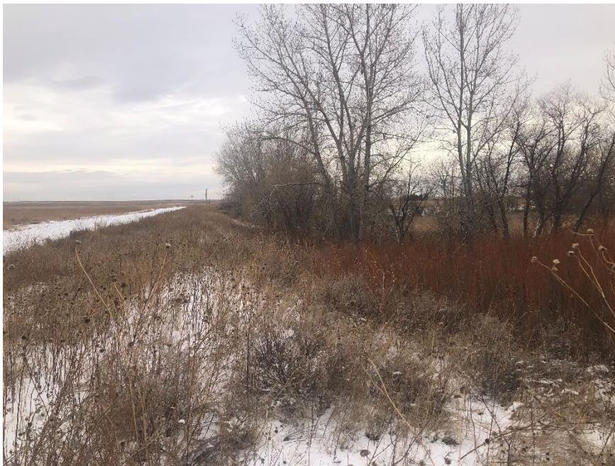
Sediment Pond 2, looking east at embankment

Number of Partial Inspection this Fiscal Year: 4