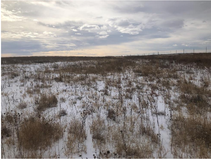
East end of disturbed area, looking south with Area 35 on the left