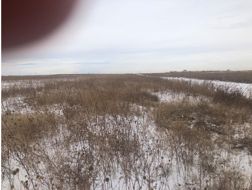
Looking northwest along the north (down gradient) boundary