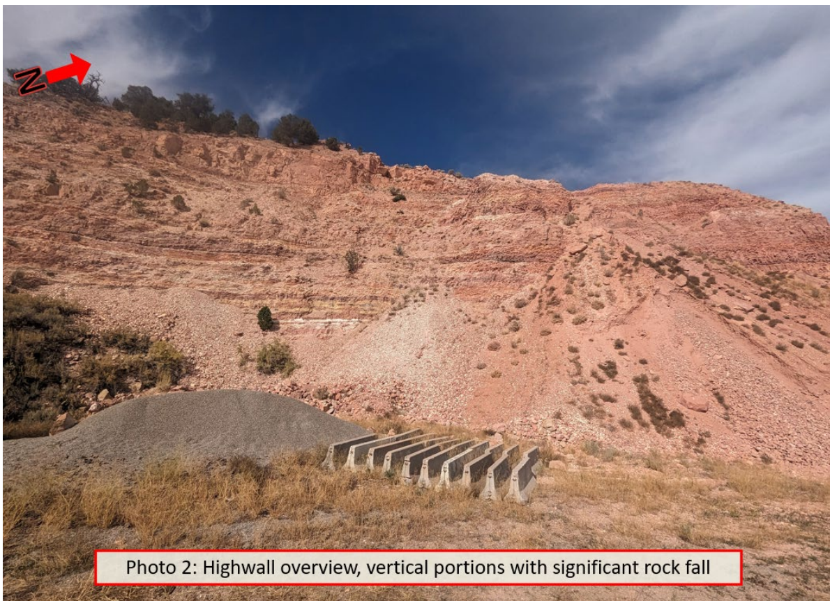
Photo 2: Highwall overview, vertical portions with significant rock fall