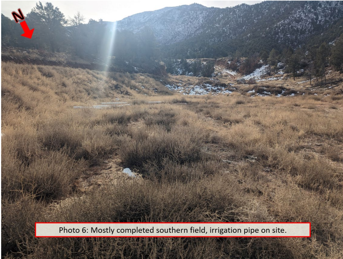
Photo 6: Mostly completed southern field, irrigation pipe on site.