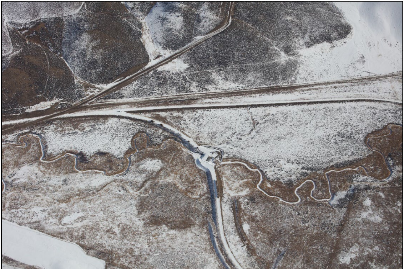
Photo 1: View of the Tracks-to-Trails entry to the east, equipment used in culvert repair in the area is visible along the path.

Number of Partial Inspection this Fiscal Year: 5