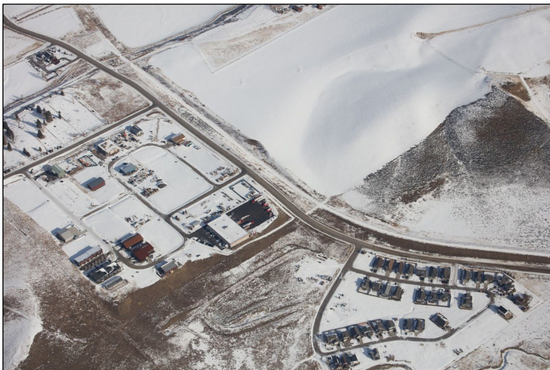
Photo 3: The trail continues along CR 37; a small dirt parking lot is located at the beginning of the trail.

Number of Partial Inspection this Fiscal Year: 5