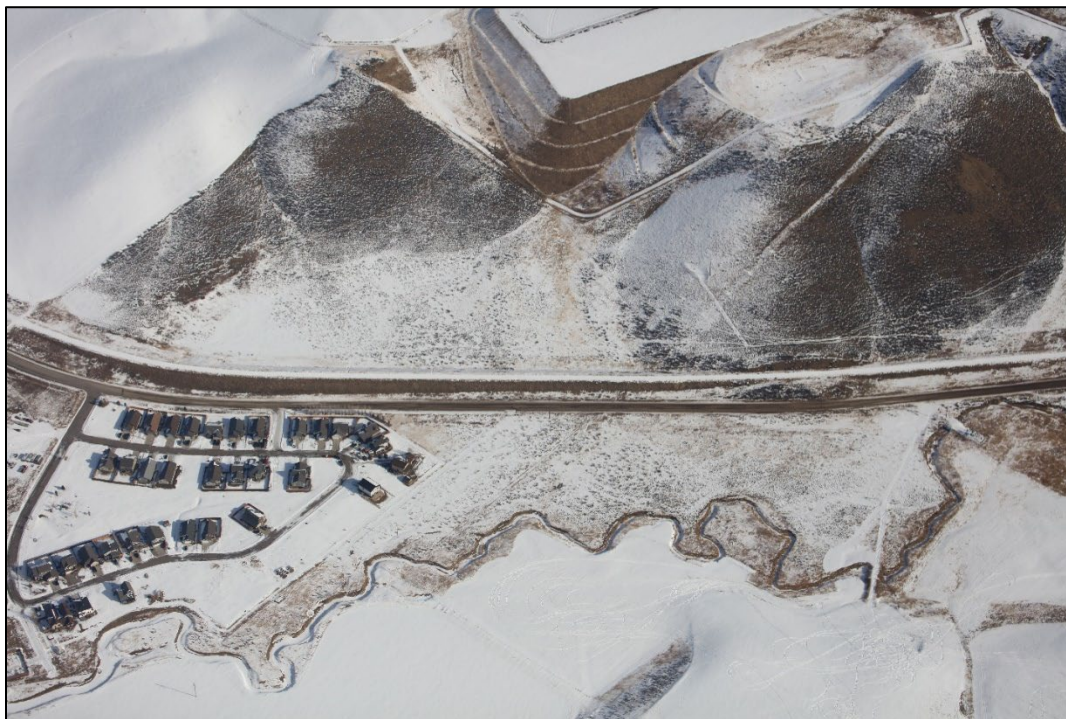
Photo 2: View of the Tracks-to-Trails recreational loop along CR 37.