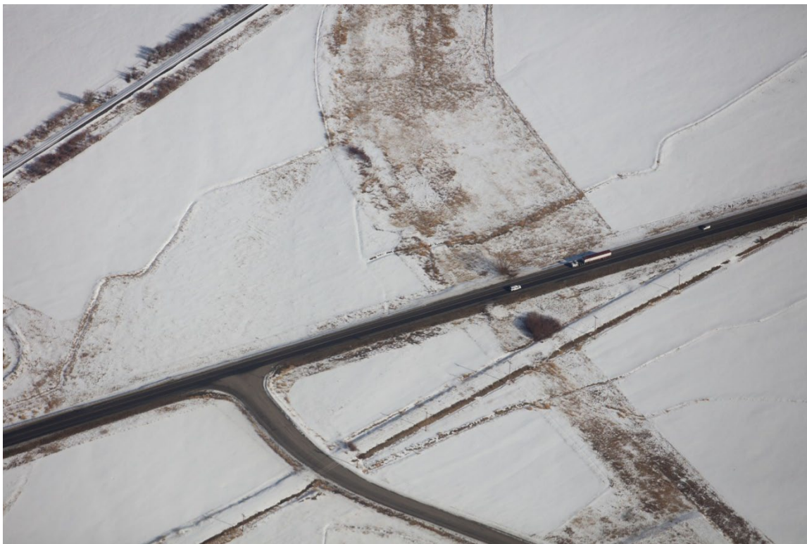
Photo 7: While snow covered, the existing vegetation in the 2.3 acres of disturbance looks to be well established.

Number of Partial Inspection this Fiscal Year: 5