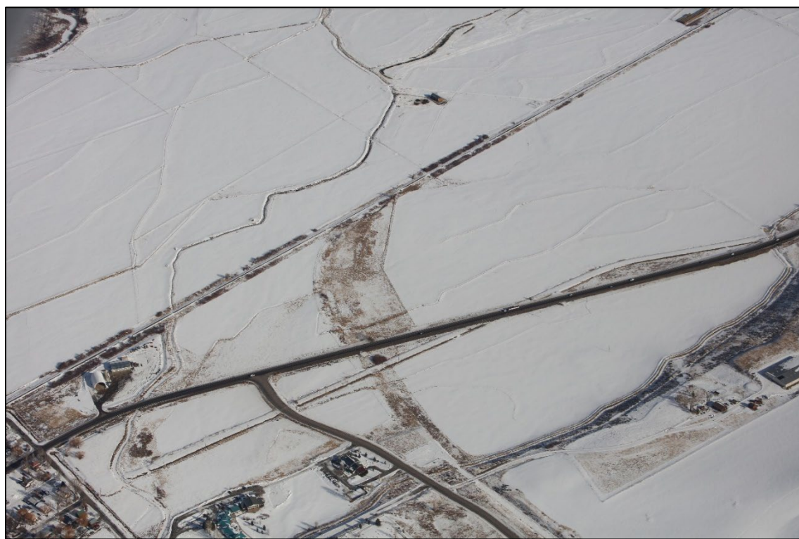
Photo 5: Another view of the 6.8 acres of unreleased agricultural fields located at the intersection of Hawthorne St / CR 37 and Hwy 40.

Number of Partial Inspection this Fiscal Year: 5