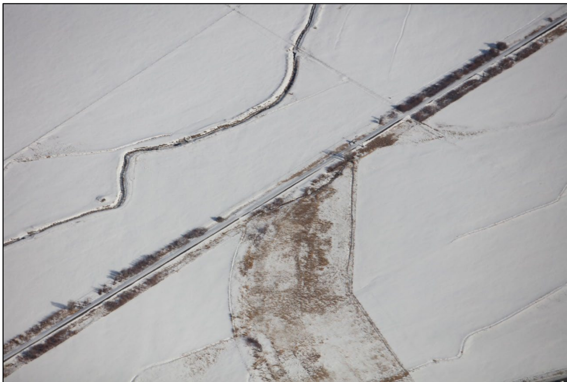
Photo 6: While snow covered, the existing vegetation in the 2.3 acres of disturbance looks to be well established.