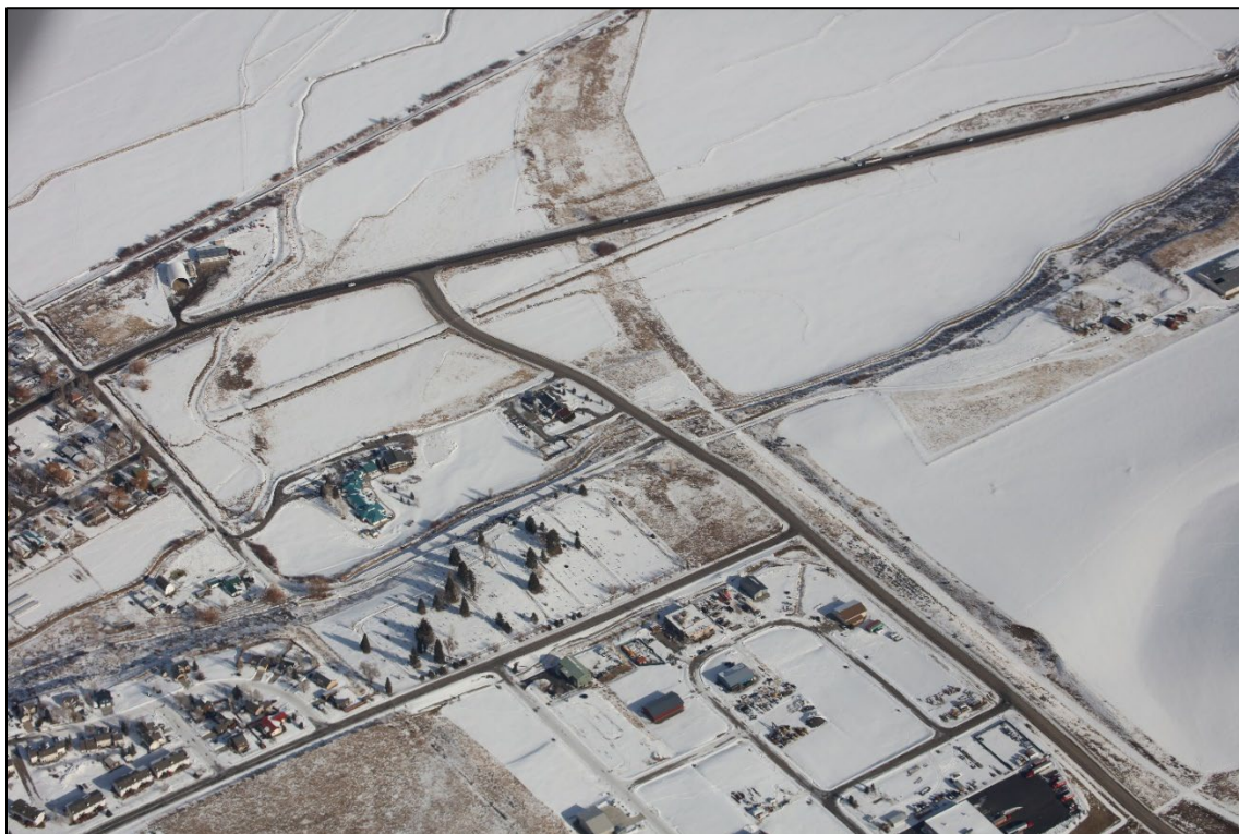
Photo 4: View of the unreleased agricultural area in the northern most permit boundary.