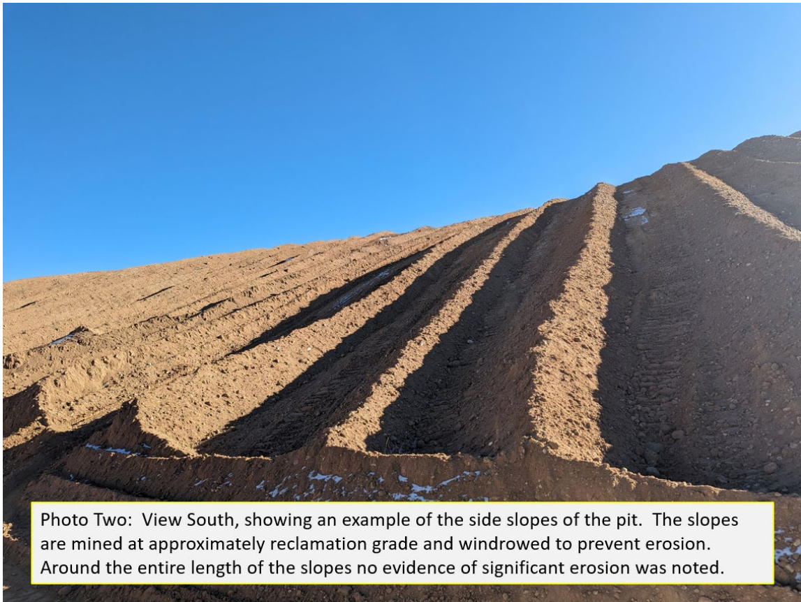
Photo Two: View South, showing an example of the side slopes of the pit. The slopes are mined at approximately reclamation grade and windrowed to prevent erosion. Around the entire length of the slopes no evidence of significant erosion was noted.