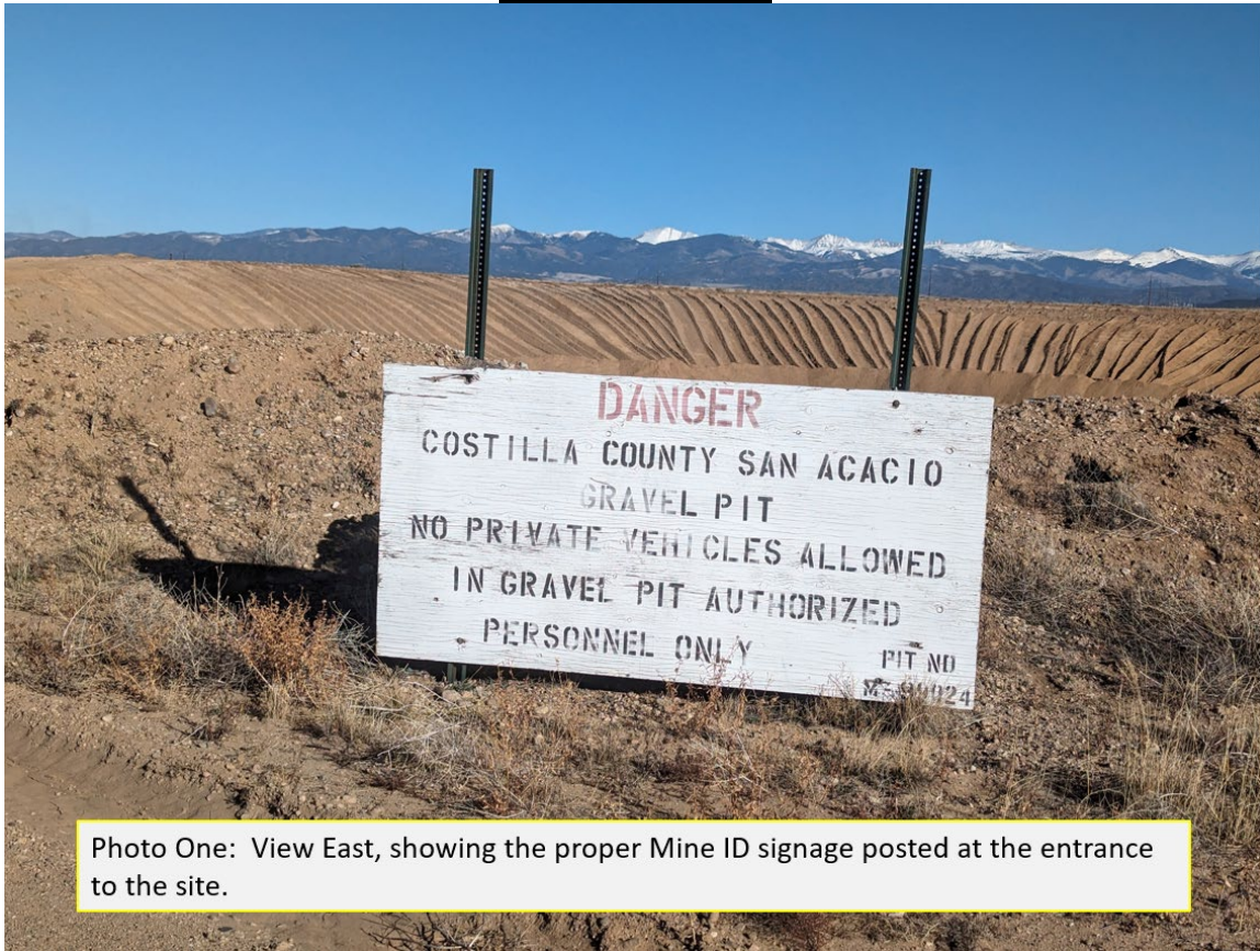
Photo One: View East, showing the proper Mine ID signage posted at the entrance to the site.