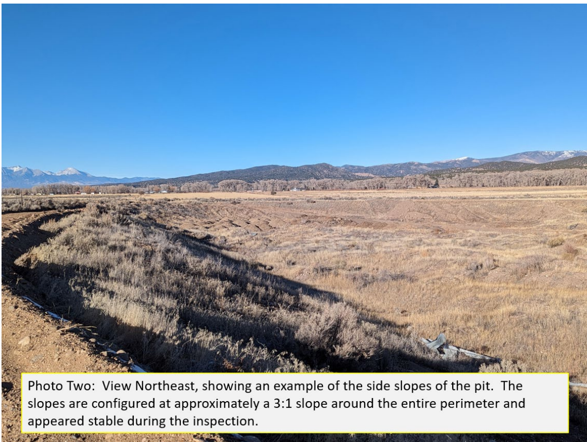
Photo Two: View Northeast, showing an example of the side slopes of the pit. The slopes are configured at approximately a 3:1 slope around the entire perimeter and appeared stable during the inspection.