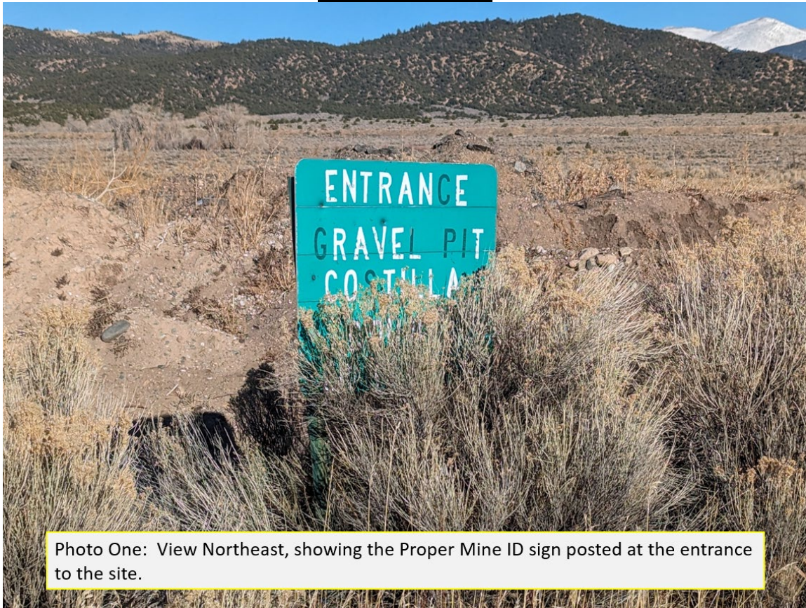
Photo One: View Northeast, showing the Proper Mine ID sign posted at the entrance to the site.