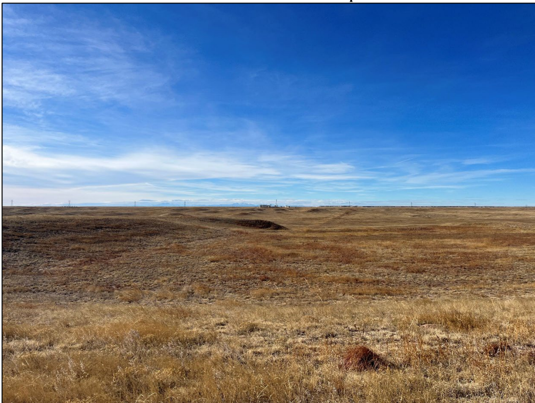
Photo 6: View to the west from the access road of the reclaimed pit floor.