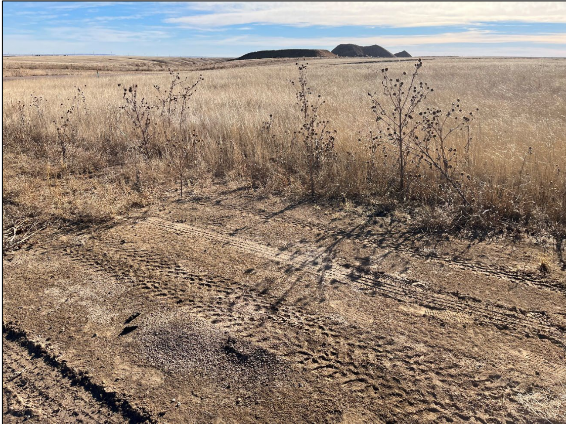
Photo 3: Bare spots are visible along the partially reclaimed access road.