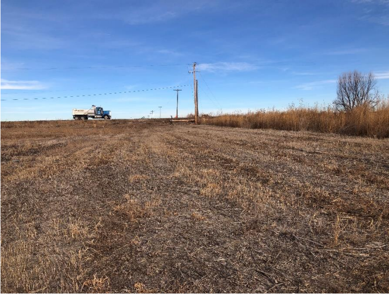
Looking north at access to O Street, at northeast corner of site