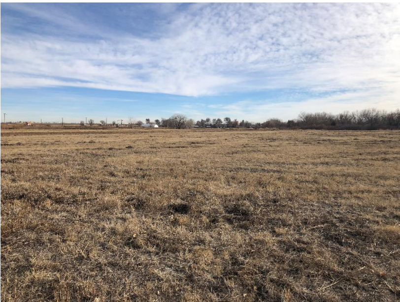
Northern portion of site, looking northeast