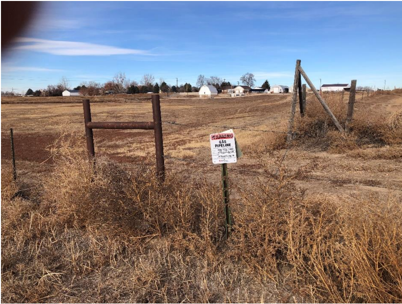
Gas pipeline sign near entrance on west side