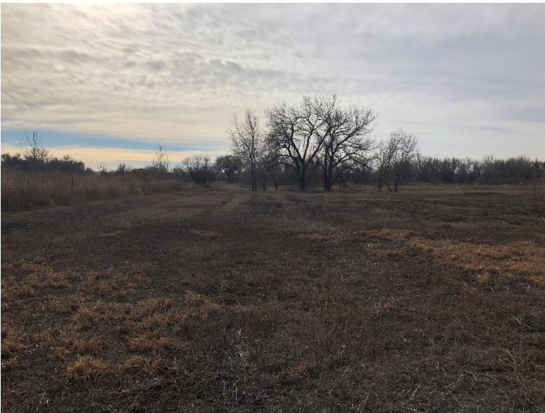
West side, looking south