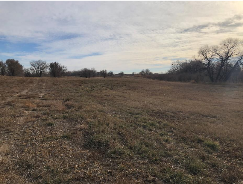
Middle of site, near reclaimed gas facility, looking east