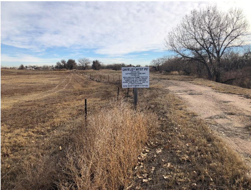
Entrance sign on 35 th Avenue (west side)