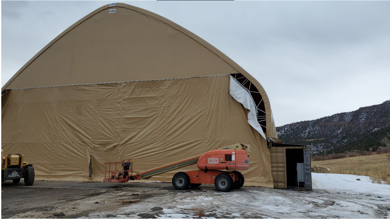
Figure 1: Outside of temporary building, from the east