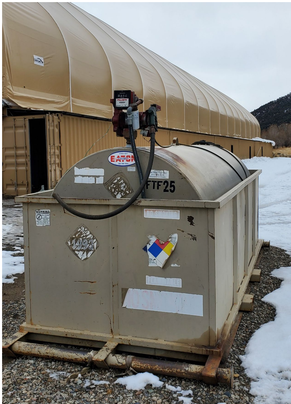
Figure 4: Fuel tank with secondary containment

Number of Partial Inspection this Fiscal Year: 4