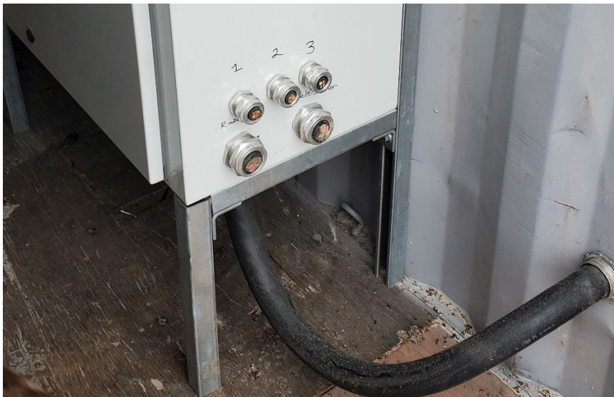
Figure 2: Copper cables cut during theft

Number of Partial Inspection this Fiscal Year: 4