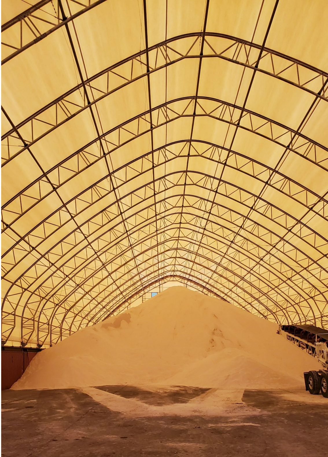
Figure 3: Inside of temporary building

Number of Partial Inspection this Fiscal Year: 4