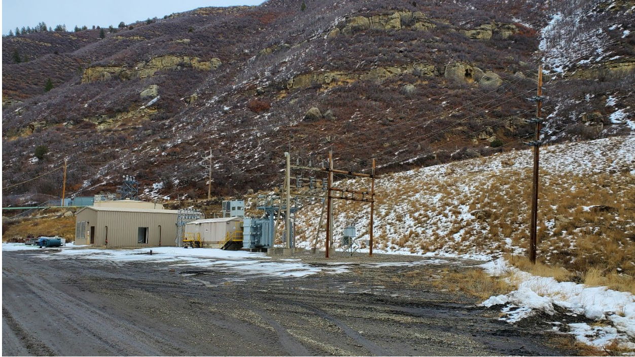
Figure 1: Partially dismantled sub-station

Number of Partial Inspection this Fiscal Year: 4