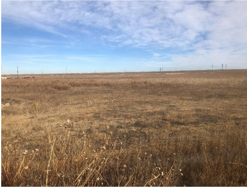
Area 38 – reclaimed topsand pile, looking northeast