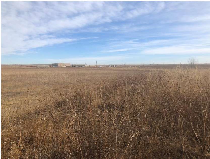
Area 34, looking southeast

Number of Partial Inspection this Fiscal Year: 4