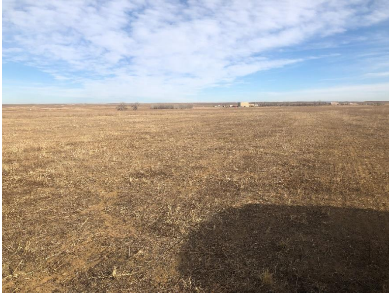
West side of Area 36 – recently harrowed and seeded