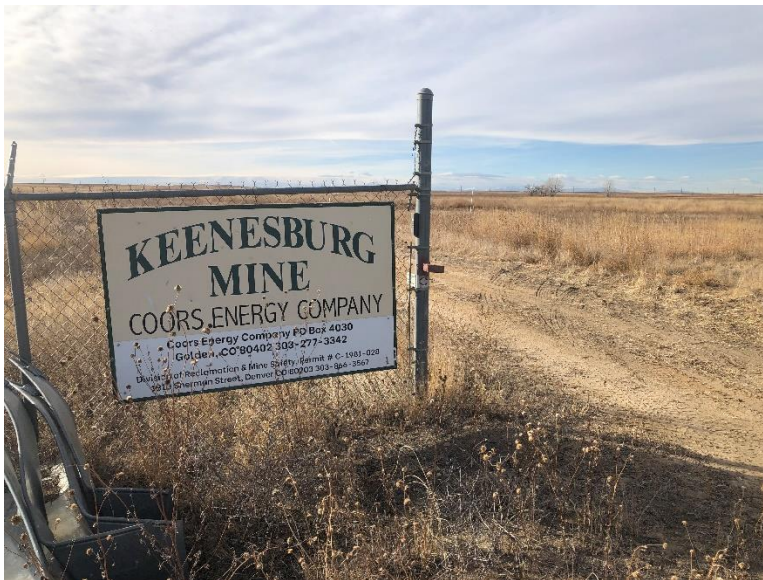
Entrance sign at gate

Number of Partial Inspection this Fiscal Year: 4