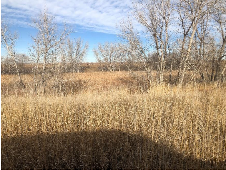
Sediment Pond 2, looking across pond at spillway