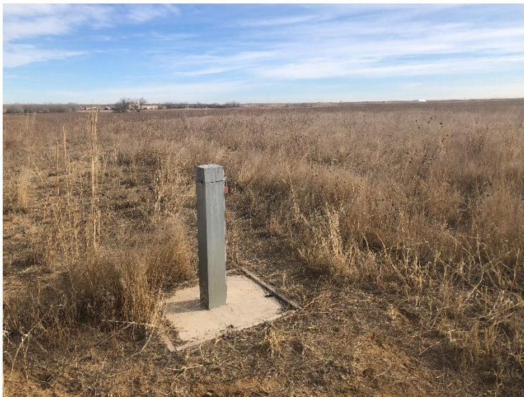
West side of Area 37, with monitoring well

Number of Partial Inspection this Fiscal Year: 4