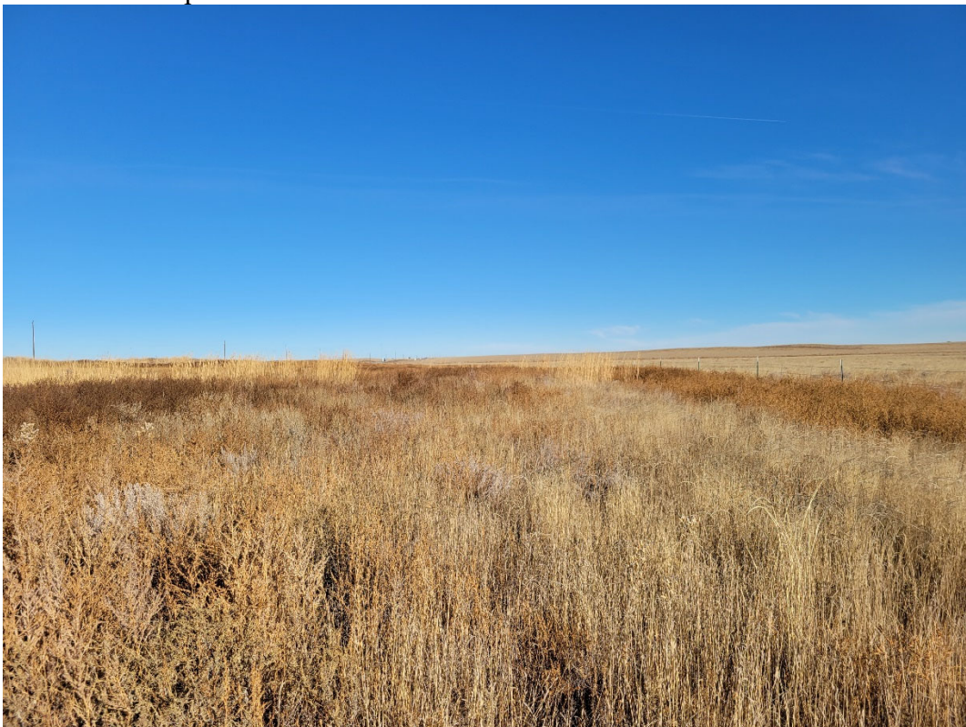
Photo 2: View looking north along the eastern boundary. Swath of dense grass observed growing along the eastern side of the permit area.