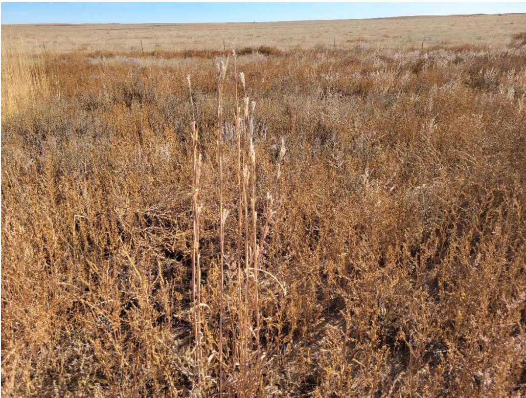
Photo 4: Desirable species noted across the site, including Little bluestem, buffalograss, and western wheatgrass