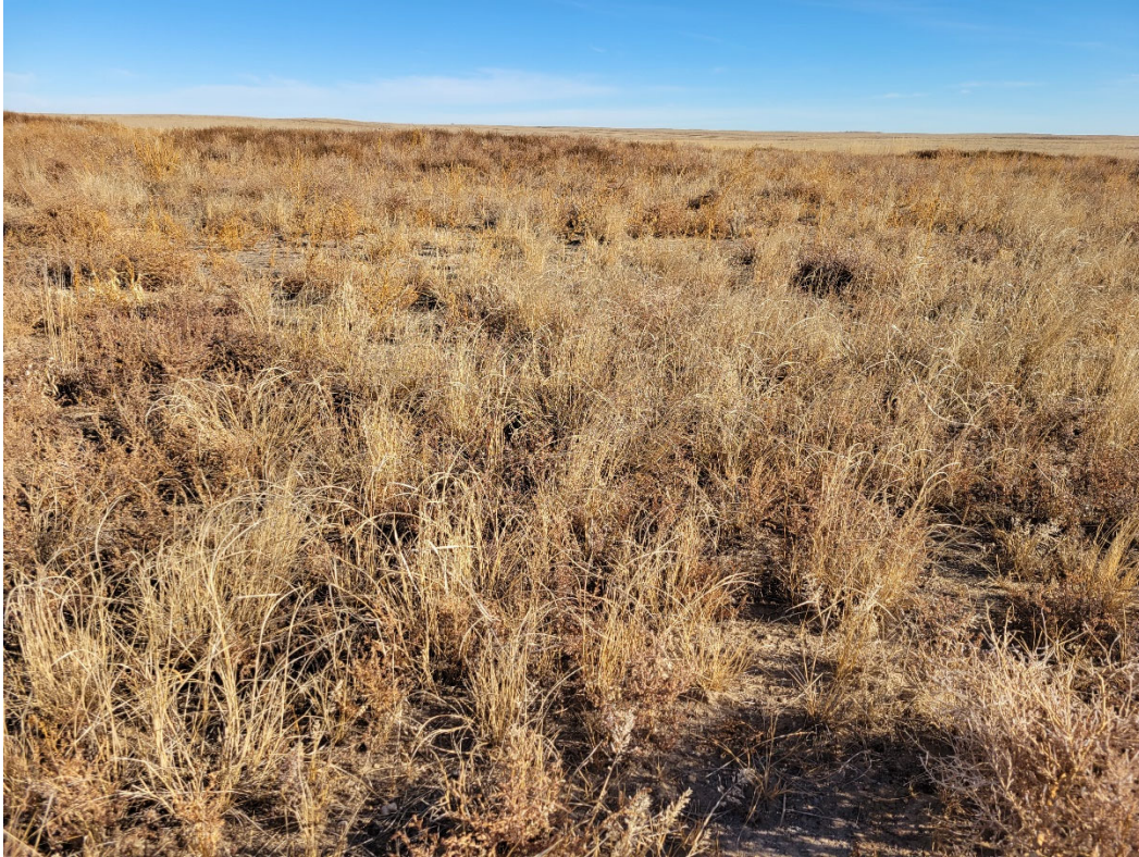
Photo 1: View looking east from the entrance to the site. Patches of grasses observed interspersed with annual weeds.