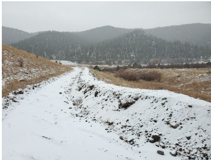
Photo 6: Looking south along the repaired berm along west side of DWDA #1.

Drainage Control; Surface Stabilization; Placement: