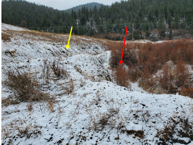
Photo 9: Yellow arrow – side of berm/slope where processed water flows into D6. Red arrow – side of berm/slope where clean water flows through D7.

the ditch and cause sediment to discharge into the clean water ditch D7 that discharges to the river. During the October 2023 inspection, the Operator stated that they had hydro-mulched the northwest side of the Soil Storage Area in an attempt to stabilize the slope. They also stated that they are unable to safely get equipment in the area to mechanically stabilize the slope and berm separating the treated water run-off from the clean water ditch. NECC has been monitoring this area. The slope appears to be stable at this time (Photo 9).