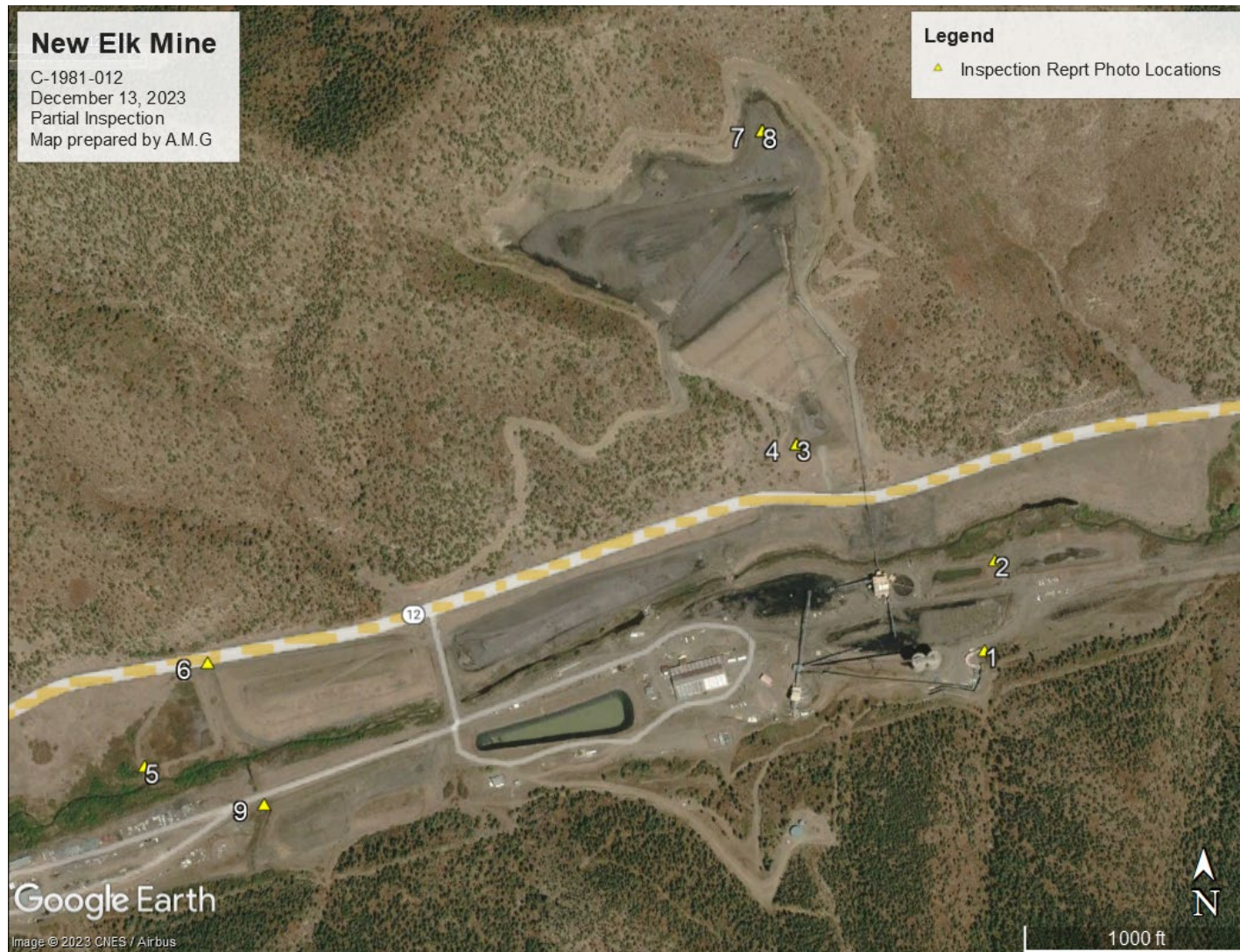
Figure 1: Map displaying the photo locations for the inspection photos referenced in this report. Google Earth Pro imagery dated June 2020.

Number of Partial Inspection this Fiscal Year: 4