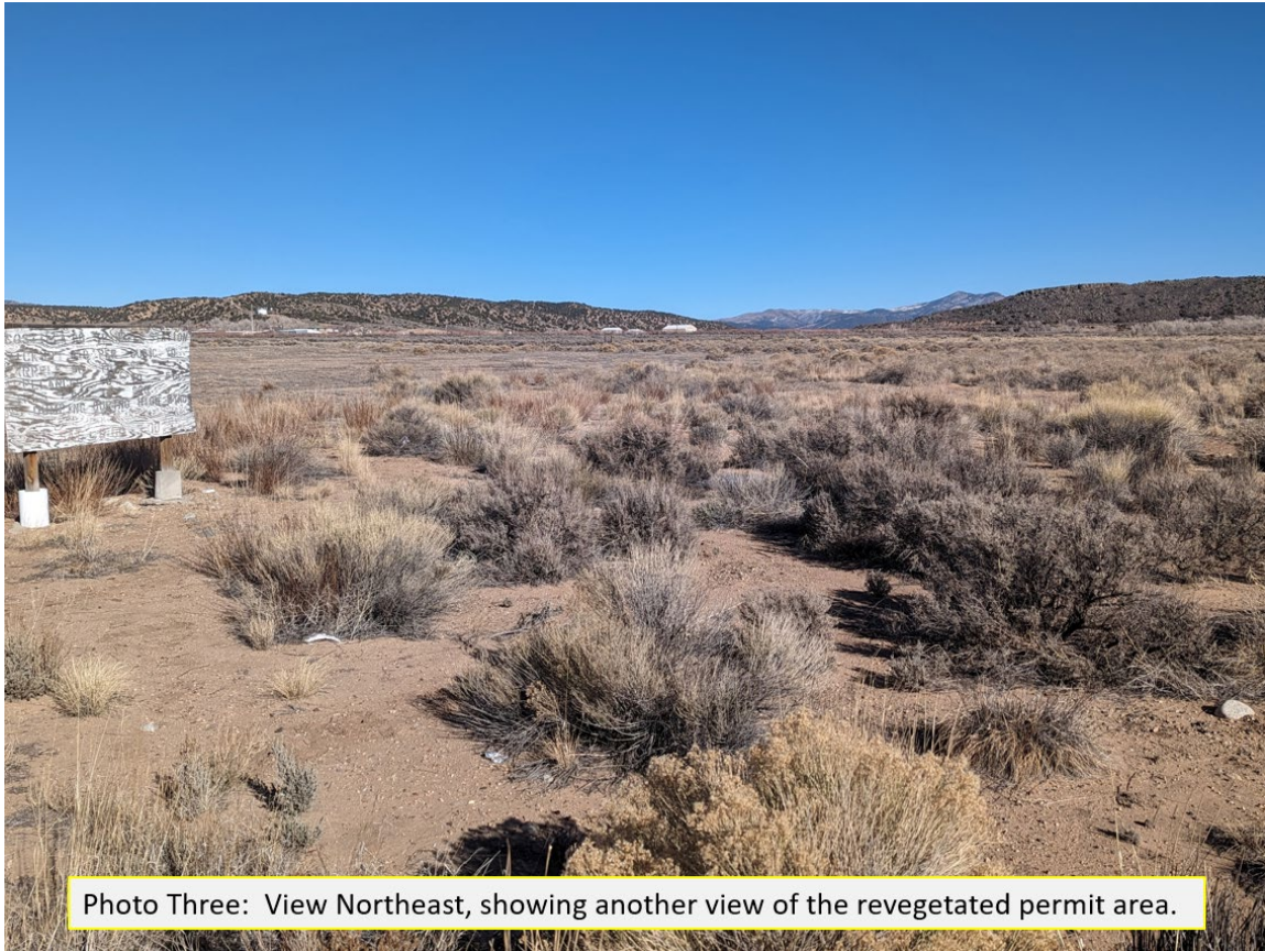
Photo Three: View Northeast, showing another view of the revegetated permit area.

Leroy Medina, David Perales Costilla County P.O. Box 100 San Luis, CO 81152