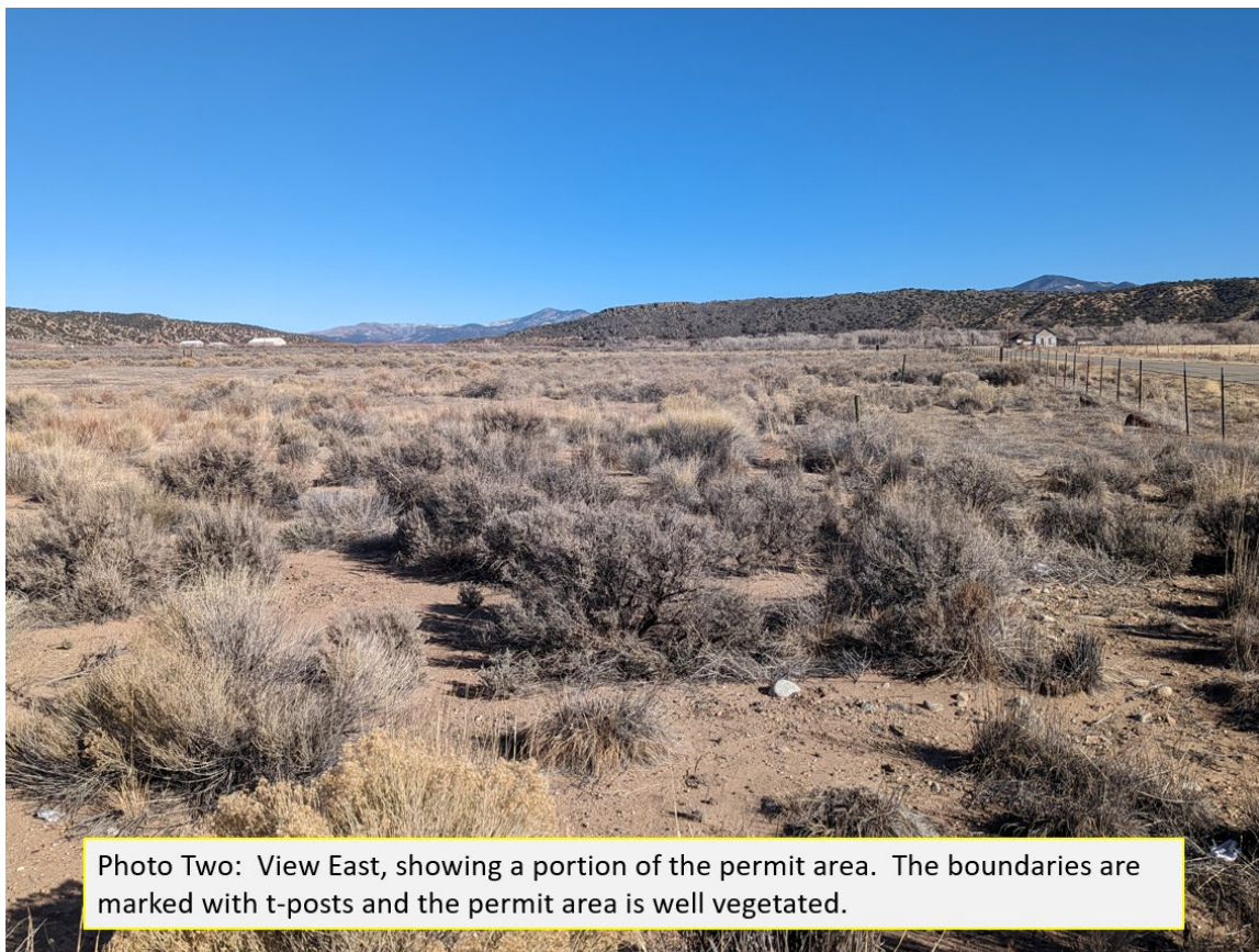
Photo Two: View East, showing a portion of the permit area. The boundaries are marked with t-posts and the permit area is well vegetated.