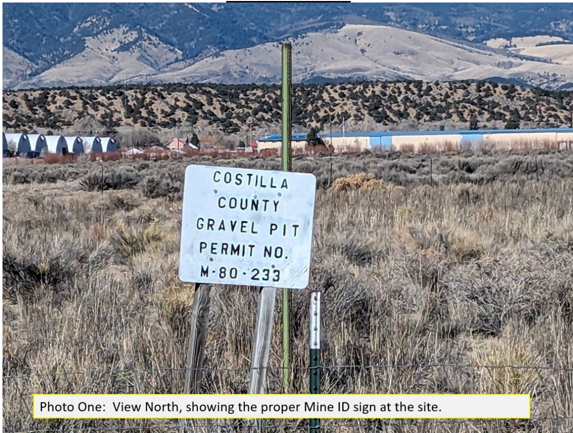
Photo One: View North, showing the proper Mine ID sign at the site.