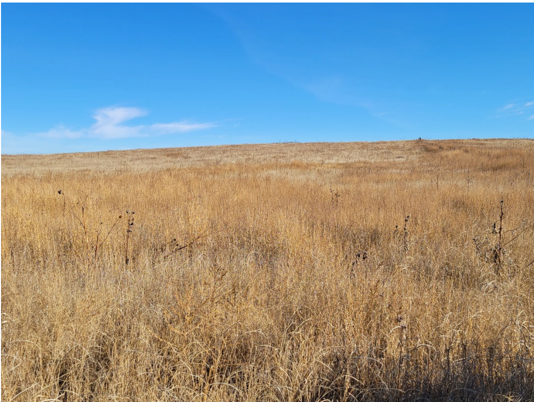
Photo 6: View from the southwest corner looking east along the southern permit boundary.