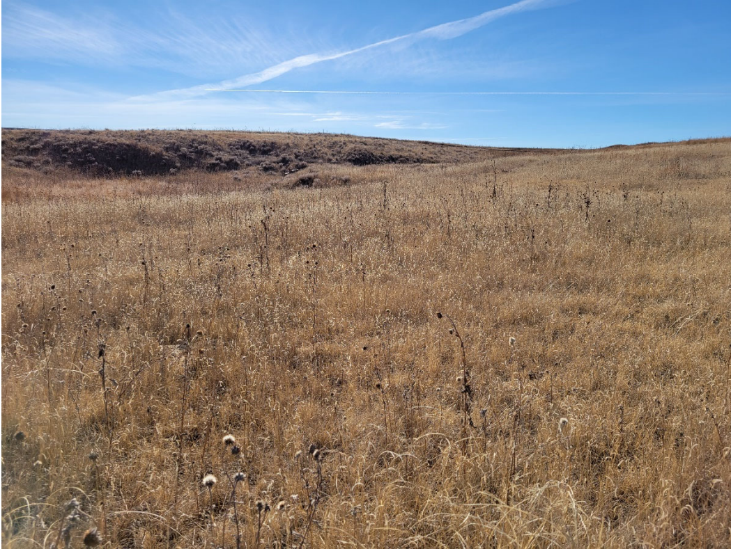
Photo 5: View looking south at berm that separates the permit area from the Union Pacific Railroad right-of-way in the southeast corner of the proposed permit area.