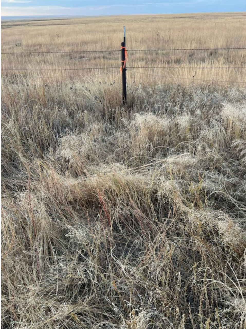
Photo 9: Looking south at barbed wire fence and boundary marker on the southern permit boundary.