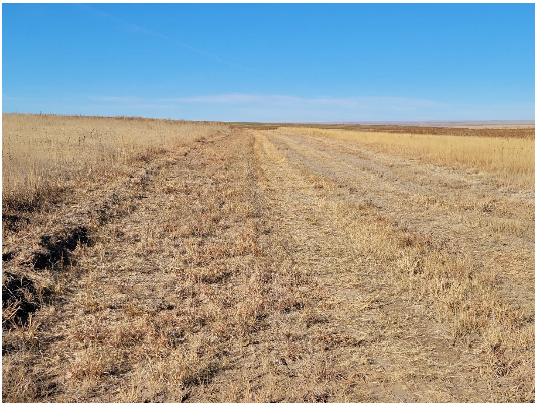
Photo 4: View looking northwest down the access road. Proposed permit area is on the left side of the photo. CRP planted field on the right side.