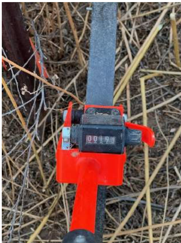
Photo 8: Measuring tape showing distance from southern permit boundary to Union Pacific Railroad right-of-way. Photo shared by Operator.