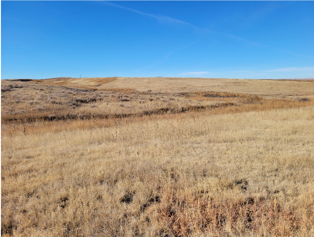
Photo 1: View looking west across the permit area from the eastern side.