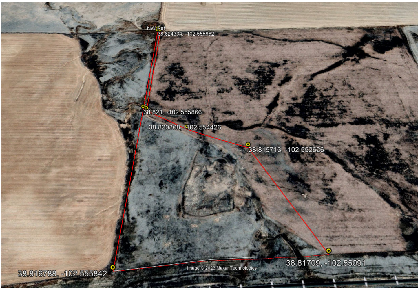
Figure 1: Google imagery from March 2020. Red boundary indicates proposed permit boundary. GPS points provided by Operator.