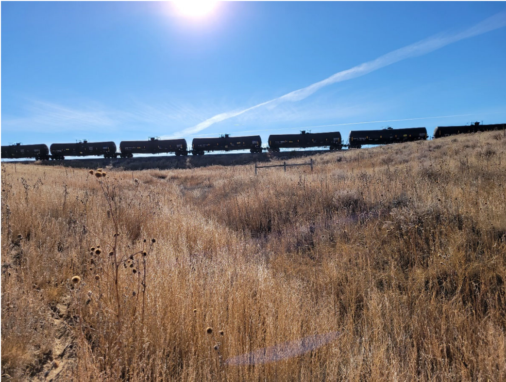
Photo 7: View looking south at the adjacent Union Pacific Railroad right-of-way from the southeast corner of the proposed permit area.