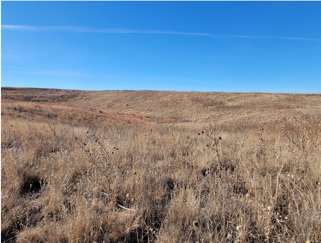
Photo 3: View of the former Larsen Pit mining area in the center of the proposed permit area.