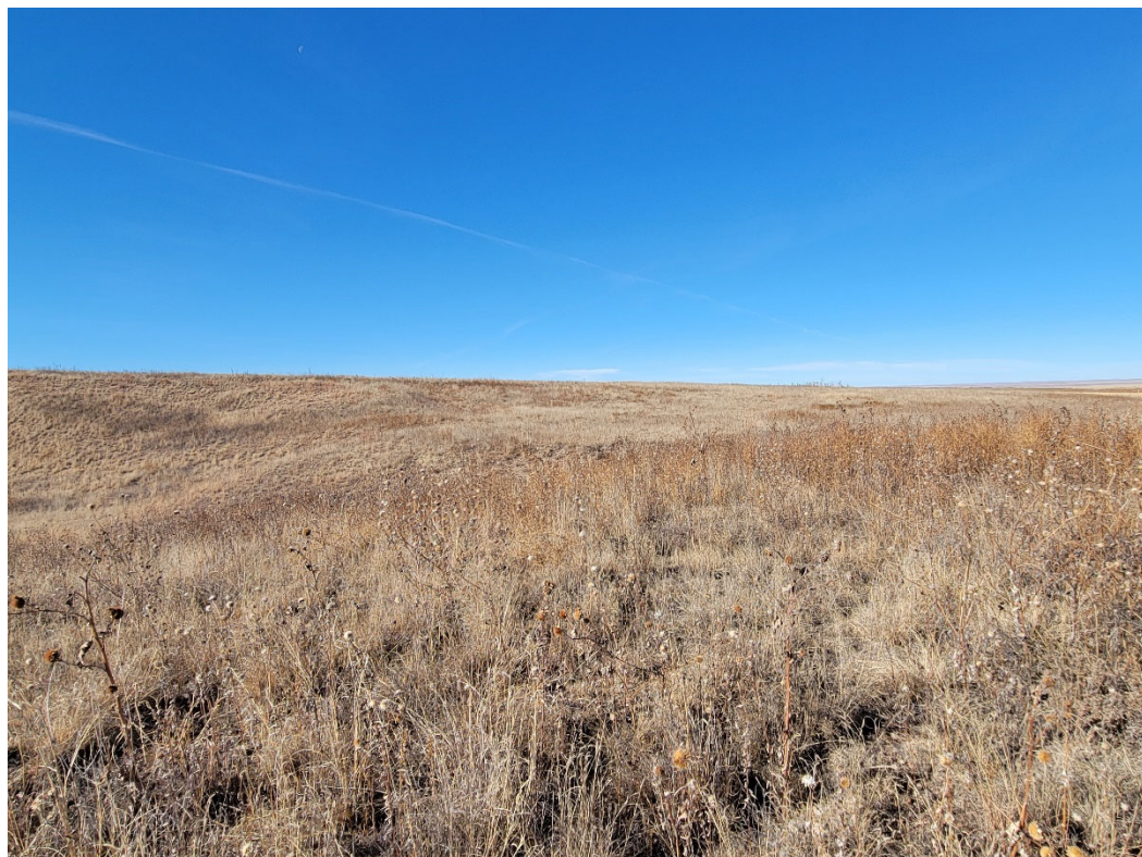
Photo 2: View looking west across the permit area from the center of the proposed permit area.