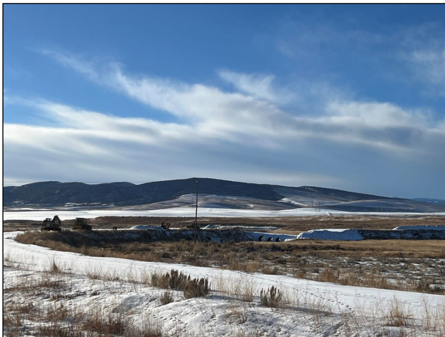
Photo 3: View south of Sage Creek Trail recreation loop where work on culvert replacement continues.

Number of Partial Inspection this Fiscal Year: 4