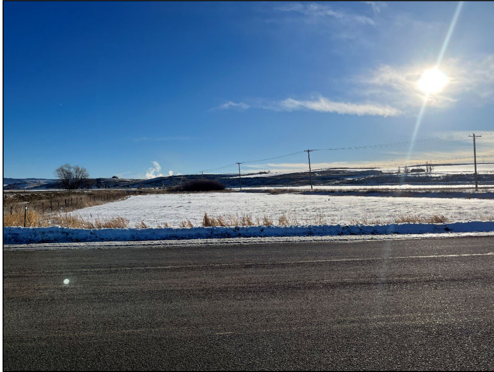
Photo 2: View east of the agricultural hay field located adjacent to Hwy 40, not yet released.