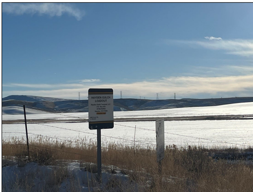
Photo 7: Secondary mine signage located at the western end of the TAHR.

Number of Partial Inspection this Fiscal Year: 4