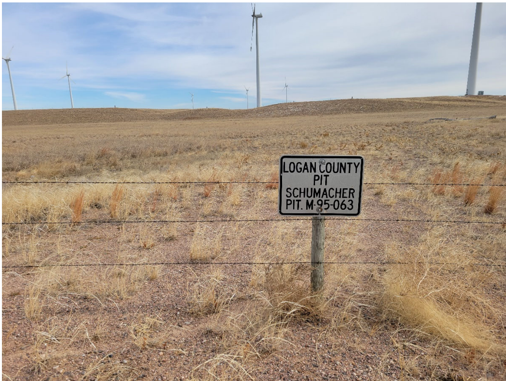
Photo 4: View of the mine sign posted at the entrance to the site. Grasses are filling in across the former entryway.