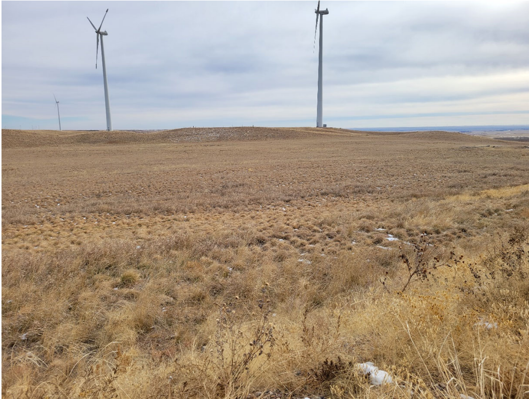
Photo 3: View looking southeast across the reclaimed pit from the entrance.