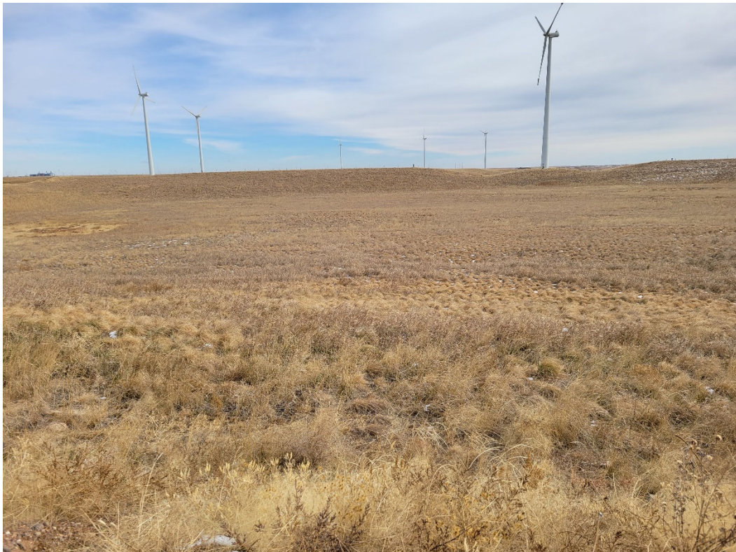
Photo 2: View looking east across the reclaimed pit from the entrance.