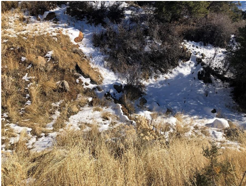
Straw bales at reclaimed Pond 4, below the East Mine

Number of Partial Inspection this Fiscal Year: 4