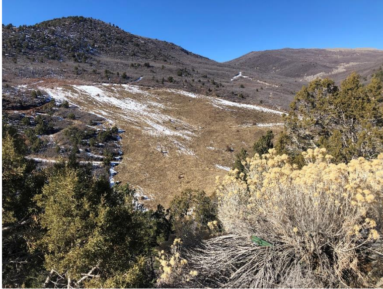
West Mine from Johnson Road