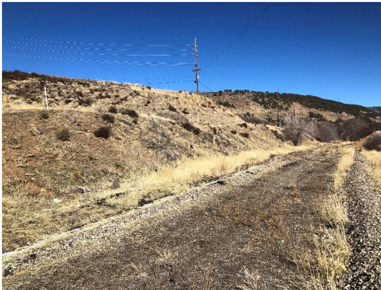
West side of slope below the loadout

Number of Partial Inspection this Fiscal Year: 4