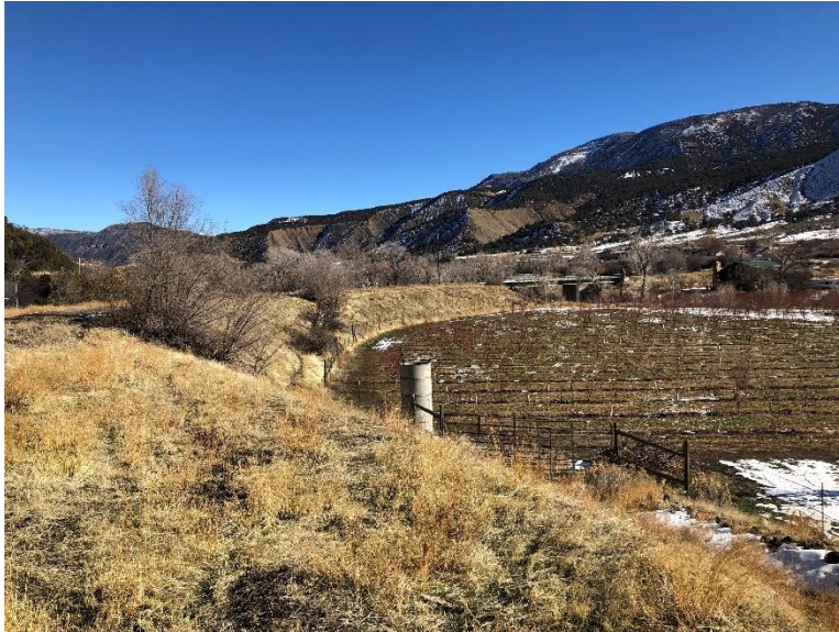
East side of slope below the loadout with bridge in background