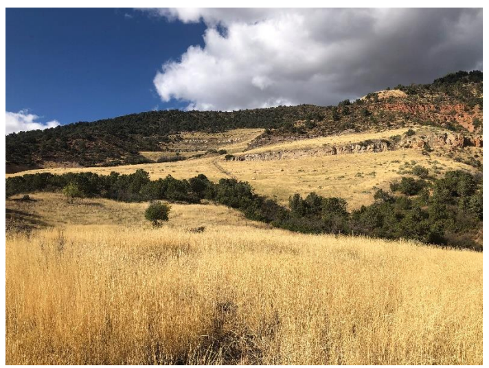
East Mine, October 4, 2023

Bowie No. 1 Mine PERMIT NUMBER C-1981-038