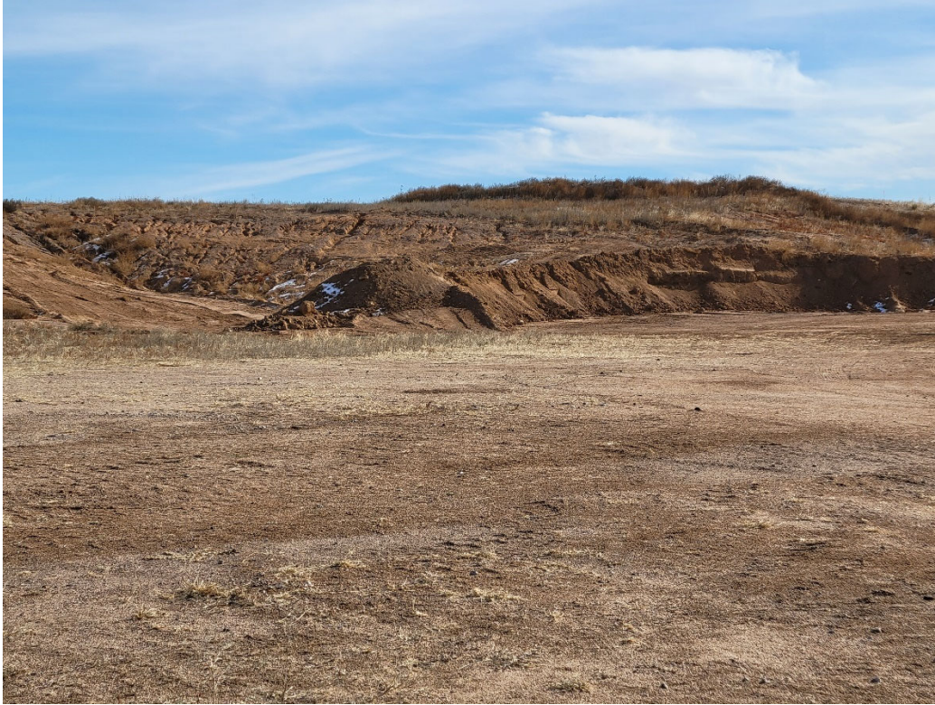
Photo 7: Looking east across the pit floor in the existing permit area.