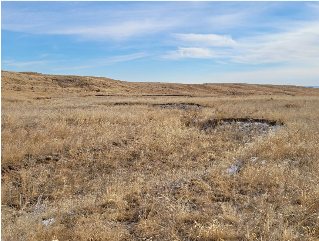
Photo 5: Looking southeast at McCracken Draw that runs between the existing and proposed permit areas.