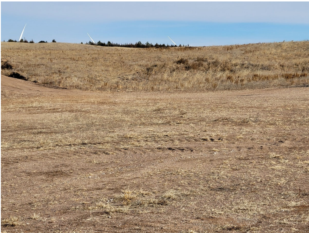
Photo 8: Looking northeast from the pit floor at revegetated slopes in the existing permit area.