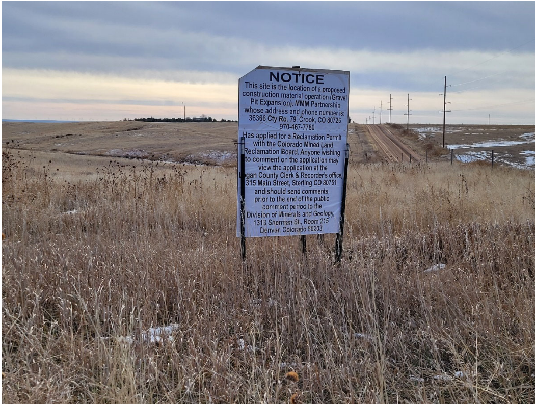
Photo 9: Notice sign posted at the entrance to the site is visible from the county road.