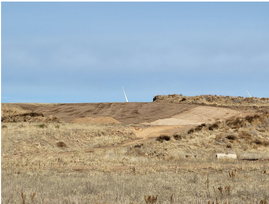
Photo 6: Recently topsoiled area in the northwest corner of the existing permit area.