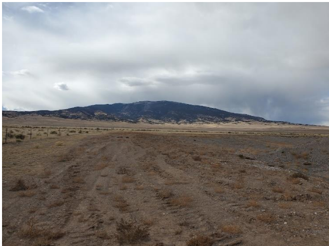
View to the west showing the southwest corner of the permit boundary. The fence line marks the permit boundary.