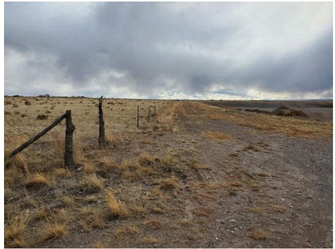
View to the south showing fence line that marks the eastern permit boundary.