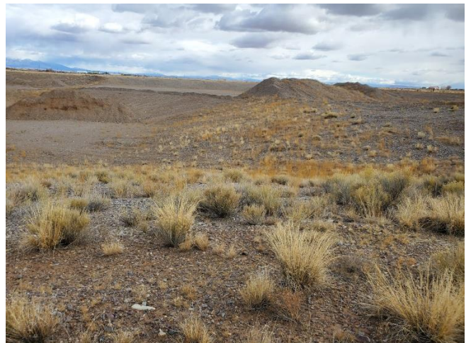
View to the southeast showing the mining area of the pit. Material is extracted at reclamation grade.