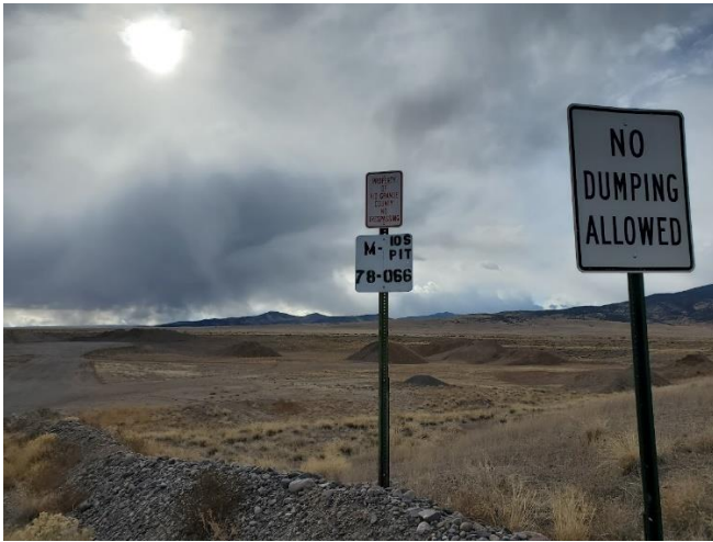
View to the south showing proper Mine ID signage posted at the entrance.