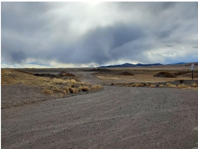
View to the southwest showing an overview of the pit. No evidence of exposed ground water