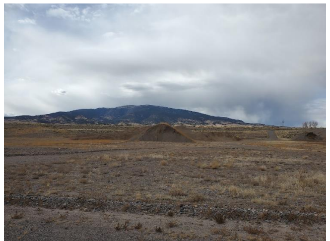
View to the west showing material stockpiles on the pit floor.