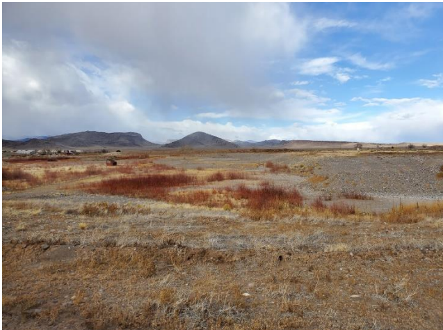
View to the north of eastern edge of the pit. Material is being excavated at reclamation grade.