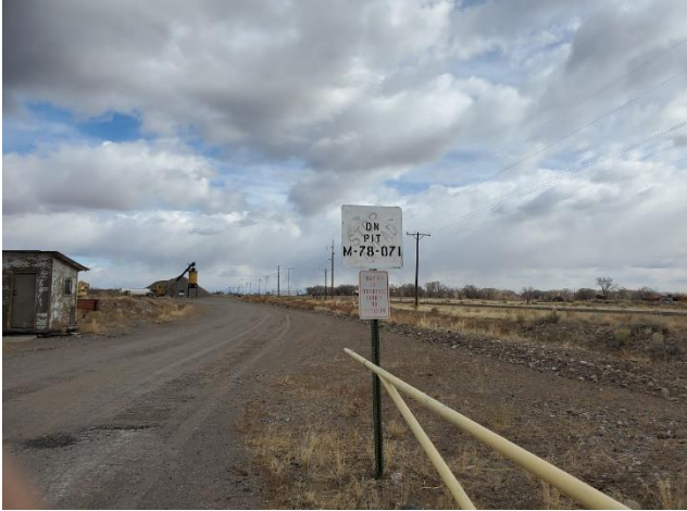
View to the east of proper Mine ID signage posted at the entrance.