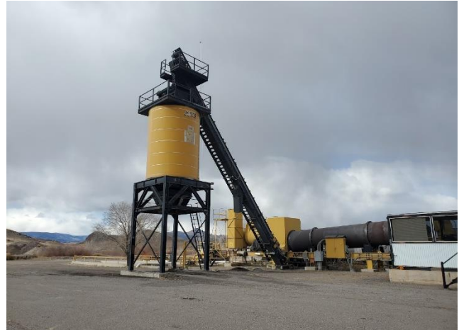
View to the north of asphalt plant on site. Plant was not active at the time of the inspection.