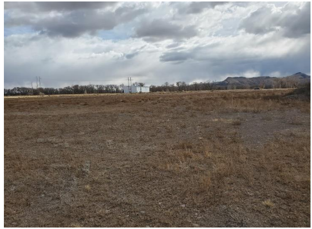
View to the east of undisturbed ground within the permit area.