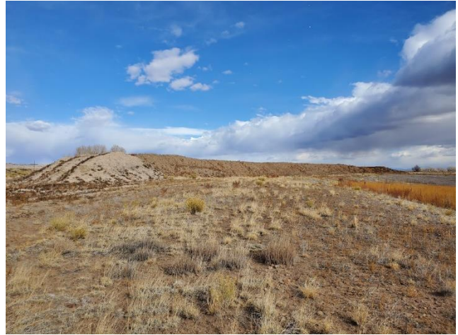
View to the northeast of principle topsoil stockpile along the northern permit boundary.