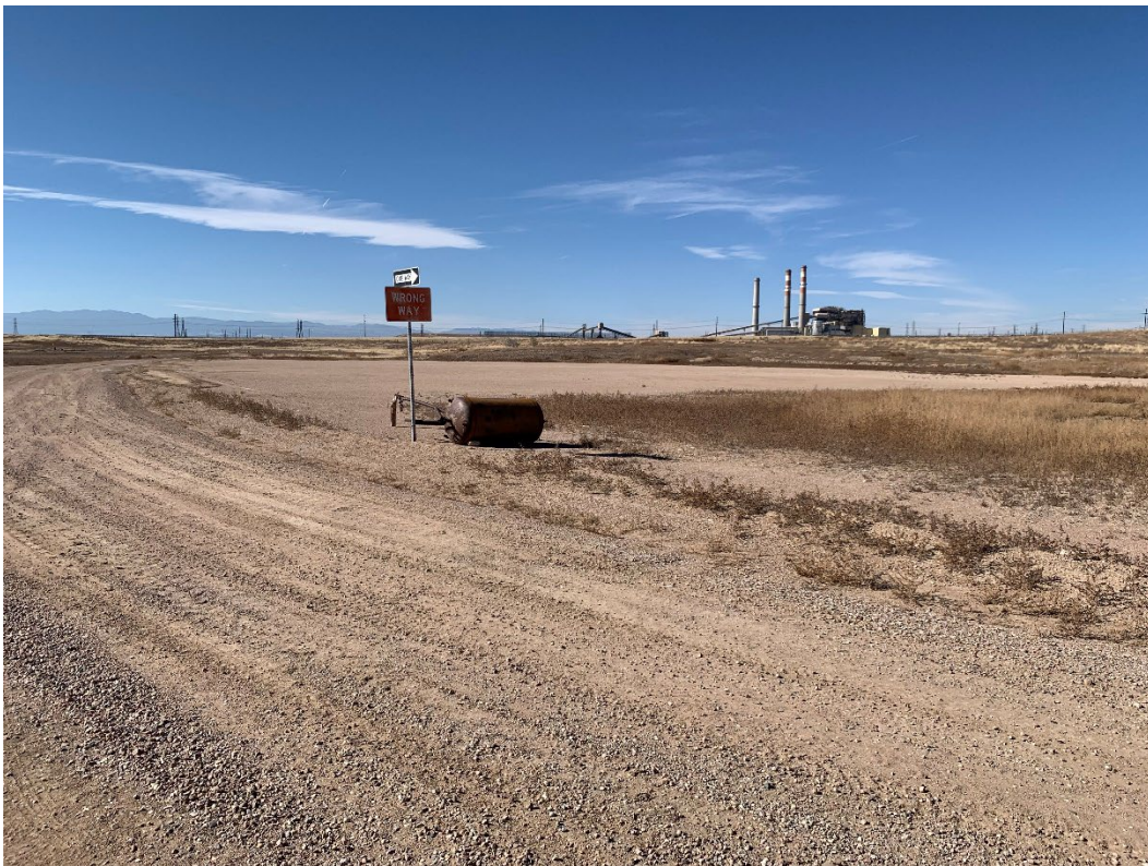
Photo 4 – The seed mix did not sprout in this area southwest of the feedlot.