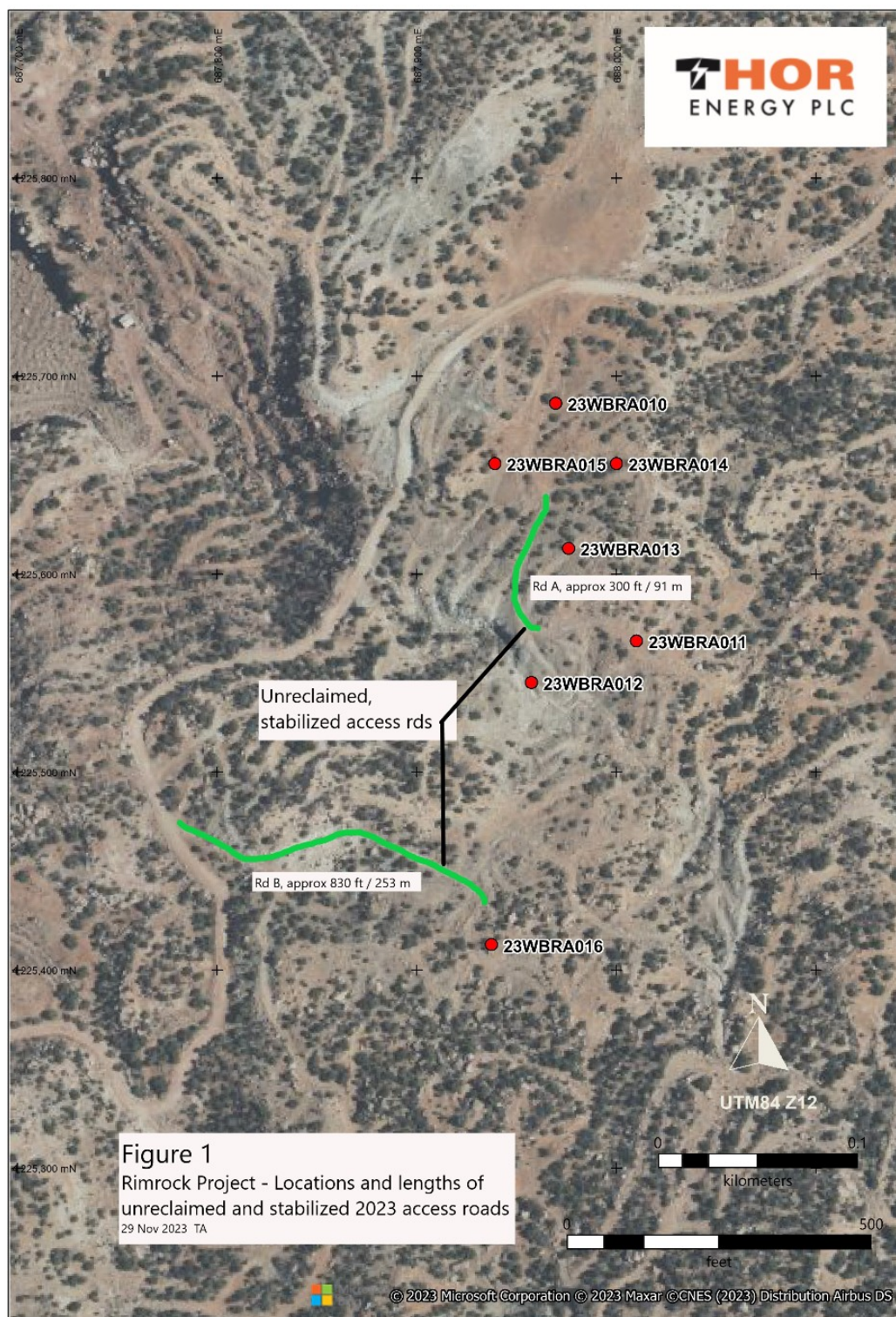
Figure 1: Location of Rimrock unreclaimed roads

American Vanadium Pty Ltd ACN 628 536 292 ABN 83 628 536 292