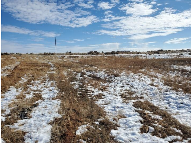
View to the northeast of northeast corner of the reclaimed areas.