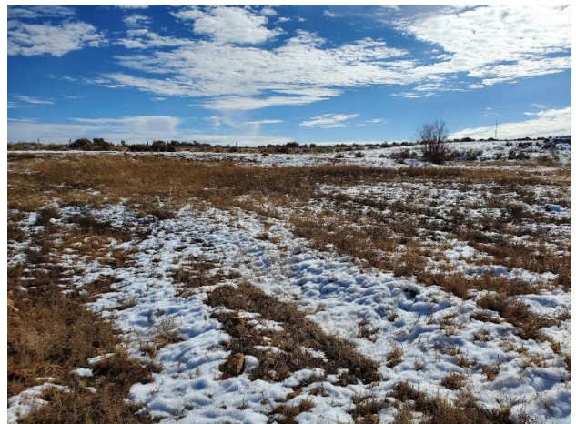
View to the southeast of southeast corner of the mining area.