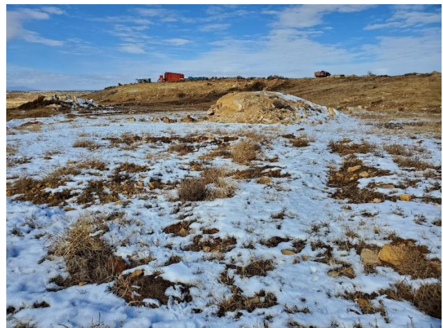
View to the northwest of northwest corner of the reclaimed area. Rock outcrop can be seen in the foreground. Undisturbed ground adjacent to the permit area can be seen in the background of the photo.