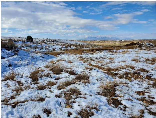
View to the southwest of southwest corner of the reclaimed pit.