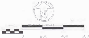
Exhibit F Reclamation Plan M-1992-069 - 83rd Joint Venture Weld County