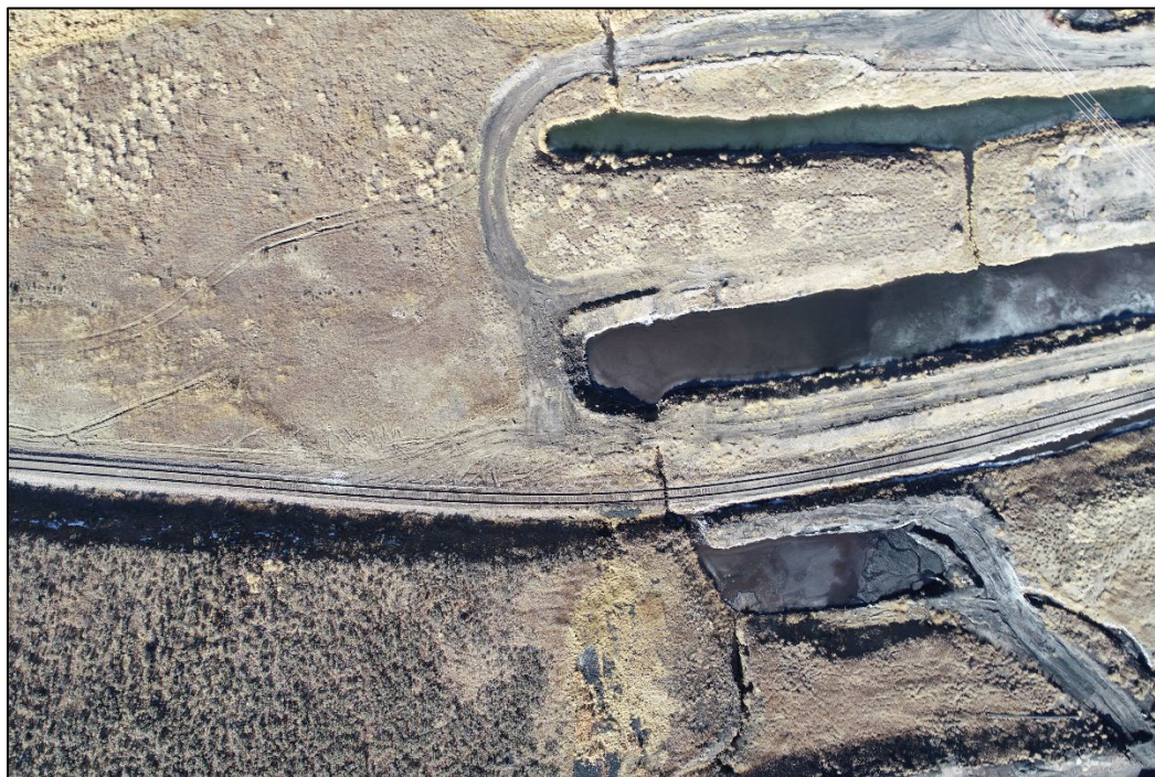
Figure 6: Double celled Ponds B and southern sump.

Number of Partial Inspection this Fiscal Year: 4