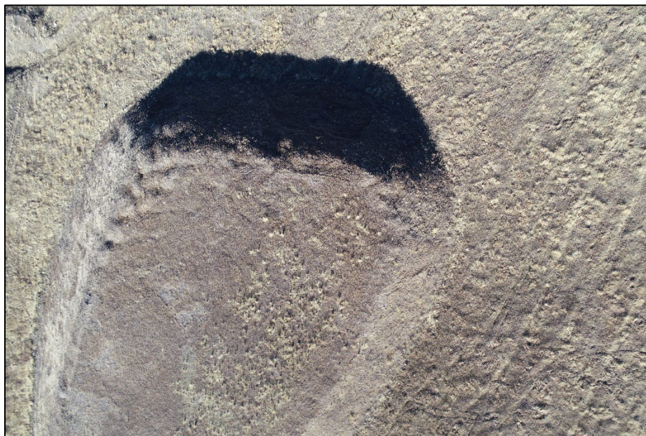
Figure 10: Topsoil stockpile located to the northeast of the Refuse Pile.

Number of Partial Inspection this Fiscal Year: 4