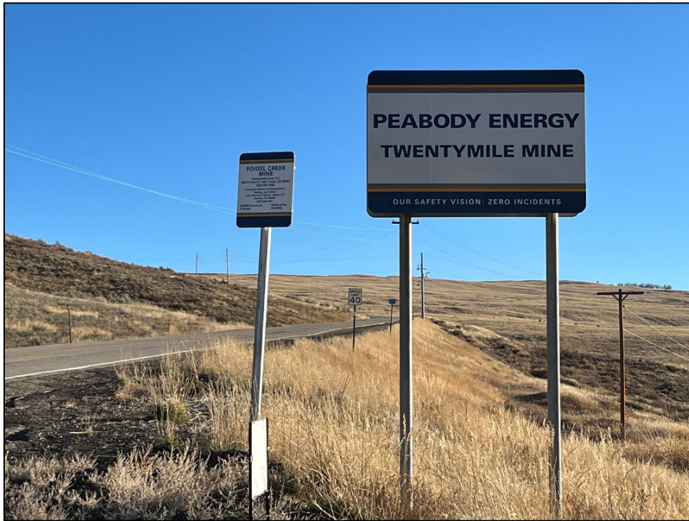
Photo 1: Mine identification sign located at the site entrance road.