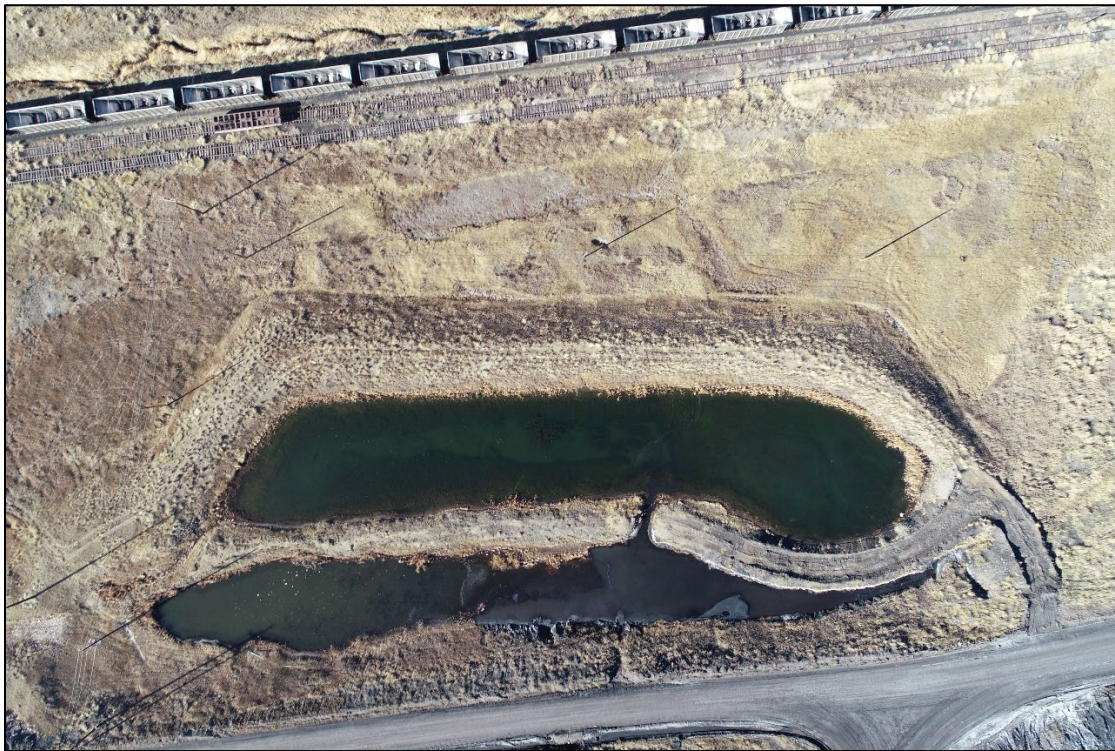
Figure 5: Double celled Pond E.