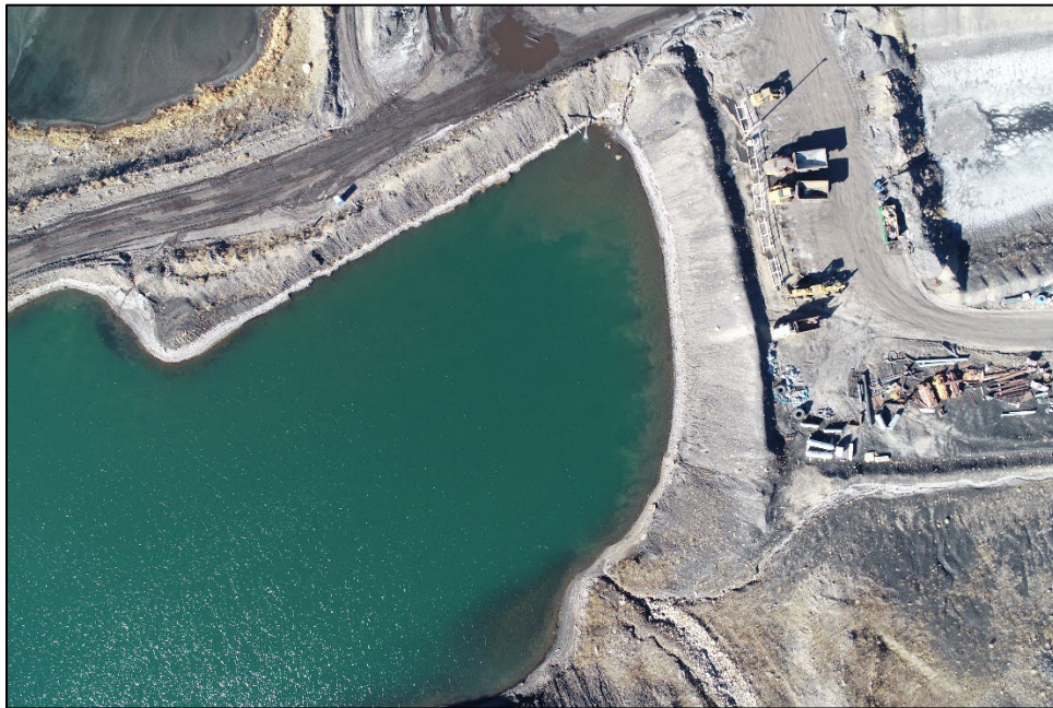
Figure 2: Northeastern end of the Pit Pond.

Number of Partial Inspection this Fiscal Year: 4