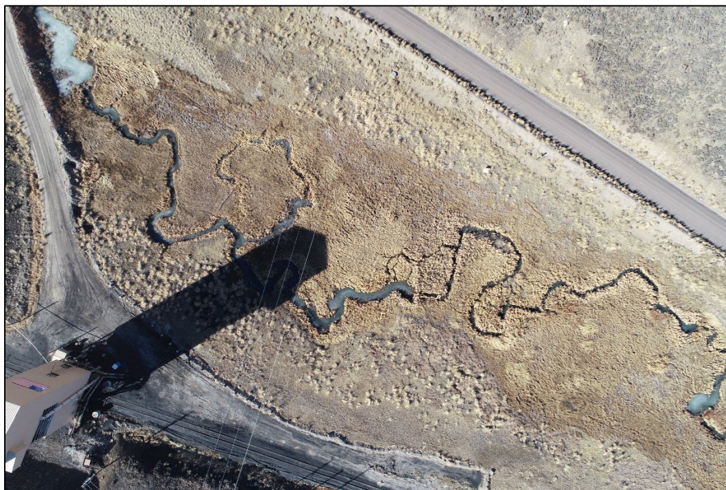
Figure 8: Train Loadout area and Foidel Creek.

Number of Partial Inspection this Fiscal Year: 4