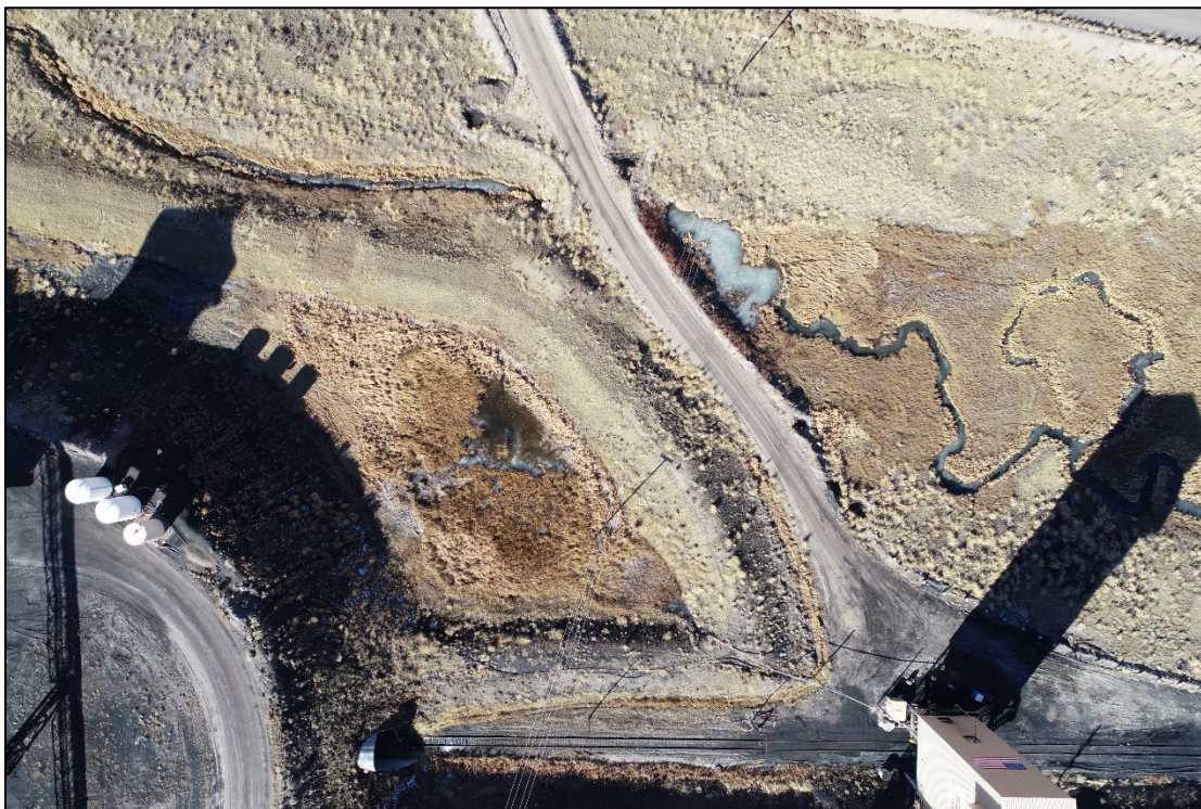
Figure 9: Pond C near the Train Loadout.