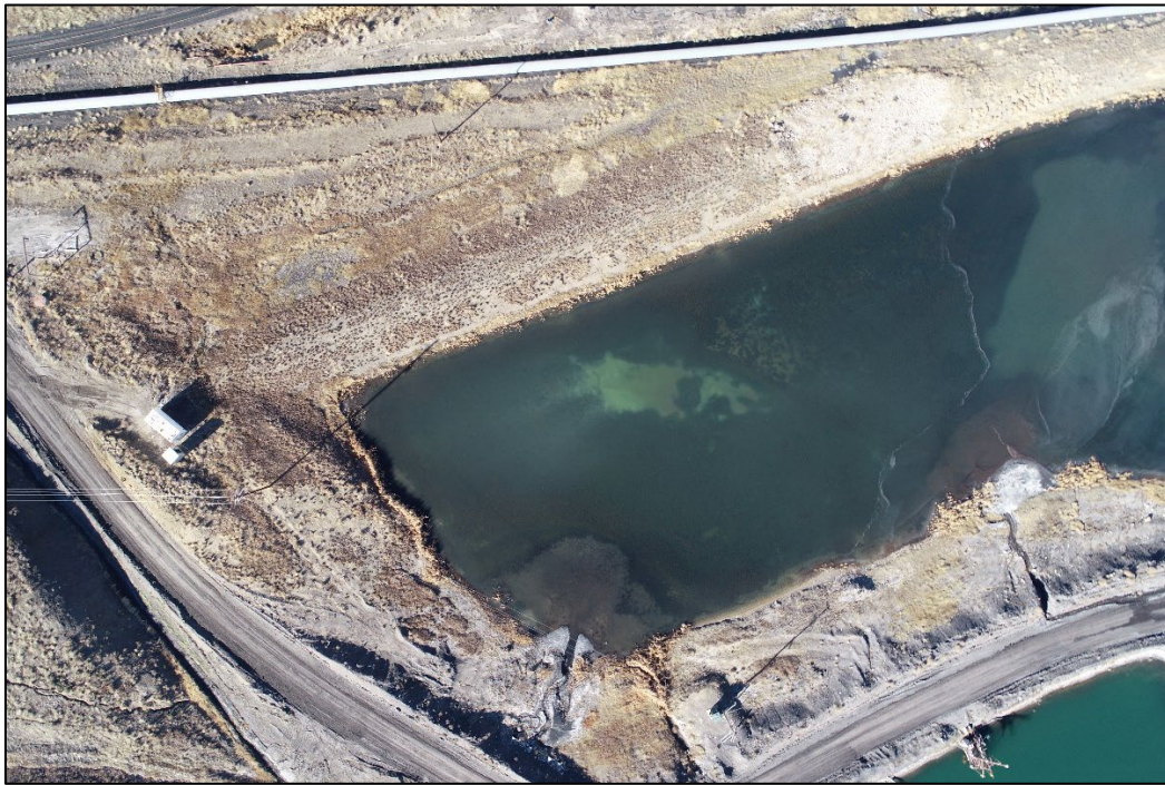
Figure 4: Northern extent of Pond D.

Number of Partial Inspection this Fiscal Year: 4