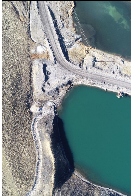
Figure 3: Southwestern end of Pond D and the Pit Pond.