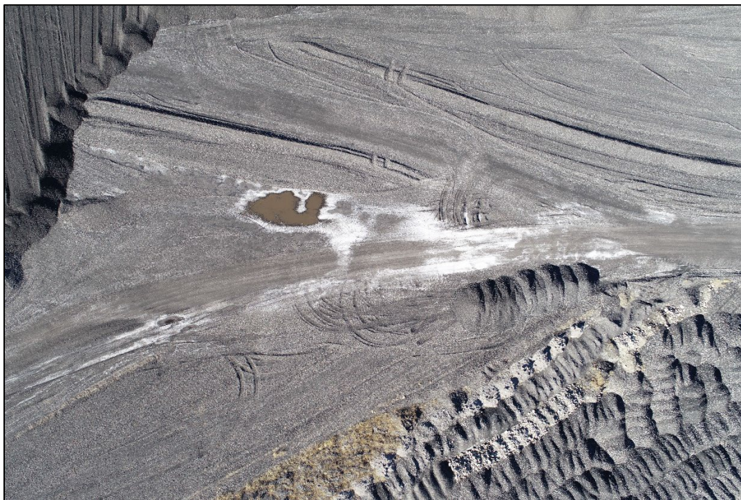
Figure 7: View atop the Refuse pile on the eastern side, a small amount of standing water is visible.