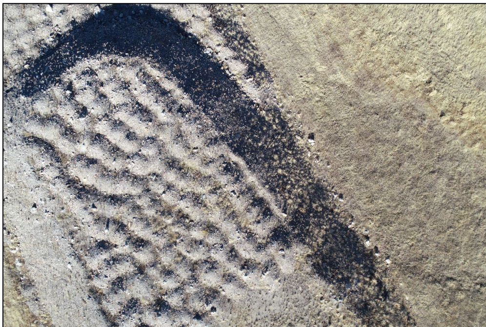
Figure 11: Topsoil stockpile located to the east of the Refuse Pile.