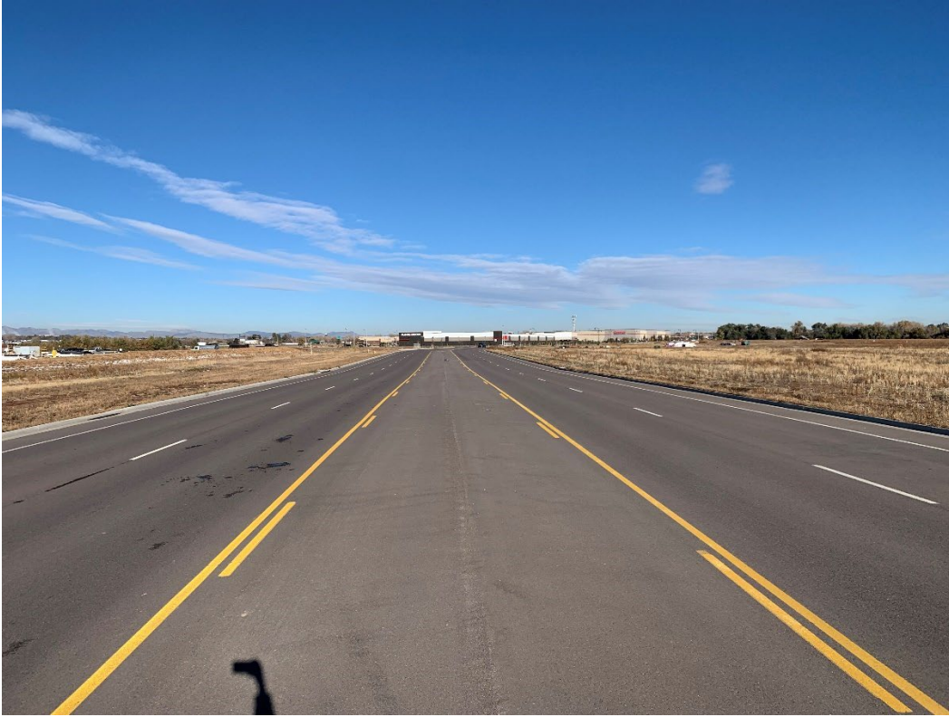
Photo 2 – Weitzel Road, facing north towards the commercial district of Timnath