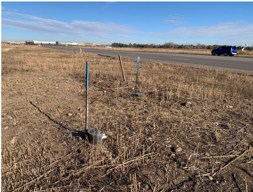
Photo 4 – Water valve casings installed along the west side of Weitzel Road