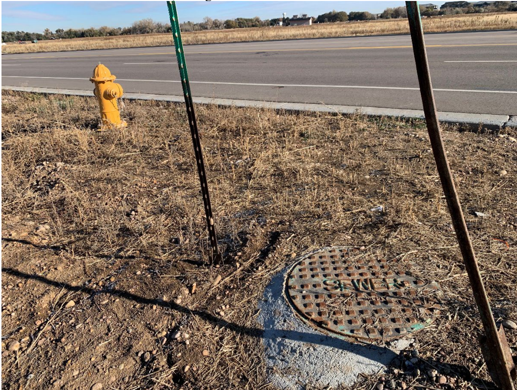
Photo 3 – Municipal utilities installed on west side of Weitzel Road