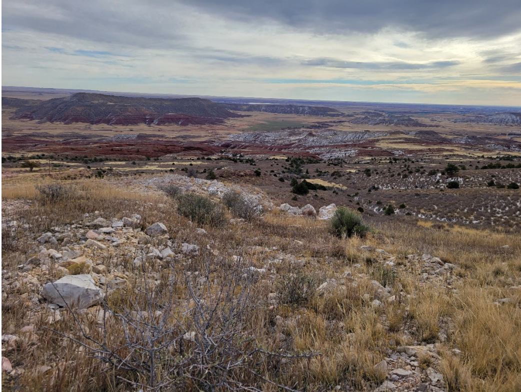
Photo 3: View looking southeast at undisturbed portion of the permit area from the southern edge of the Phase 1 mining area.