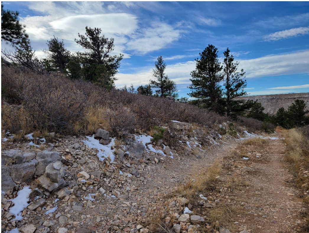
Photo 4: Two track road that runs along a ridge in the western portion of the permit area. This road will remain after release.