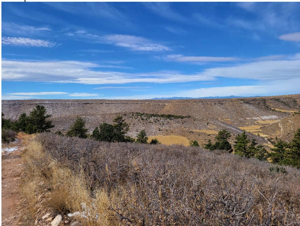
Photo 2: View looking southwest across undisturbed portion of the permit area south and west of the Phase 1 area.