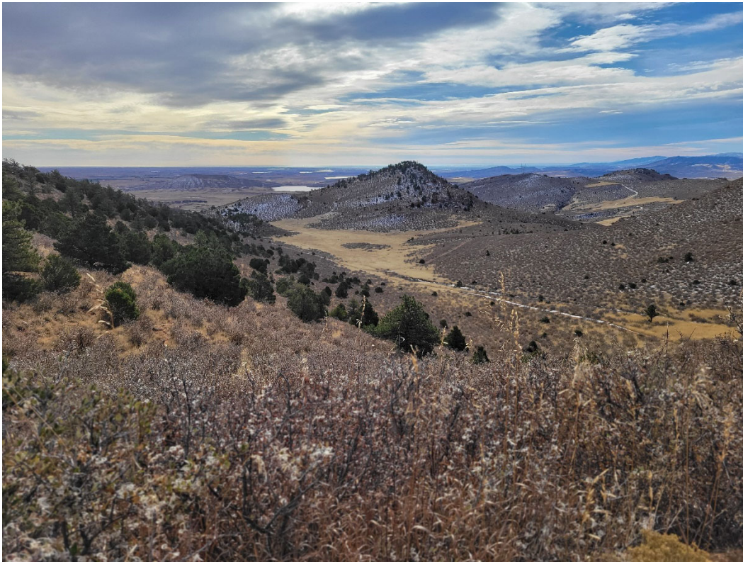
Photo 1: View looking southeast down an undisturbed valley at the southern end of the permit area.