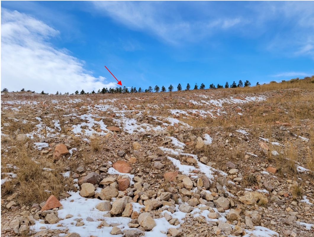
Photos 5 & 6: Reclaimed slope in the southeastern portion of the 35-acre disturbance area. Native grasses and shrubs noted growing in the trenches and along the edges, gradually filling in the disturbed slope. Arrow points to tree islands at the top of the slope.