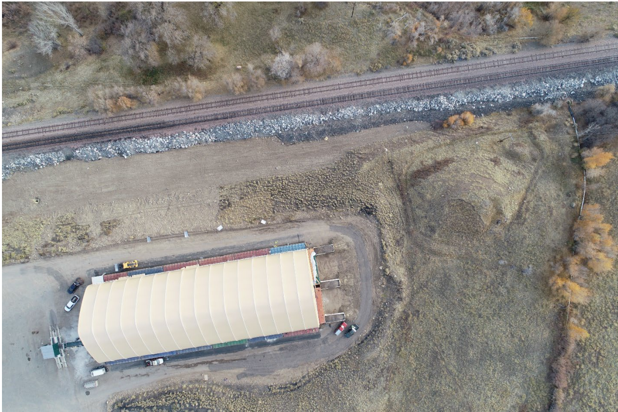
Figure 1: Drone image showing railroad track, topsoil stockpile, western end of lower pad and temporary building

Number of Partial Inspection this Fiscal Year: 4