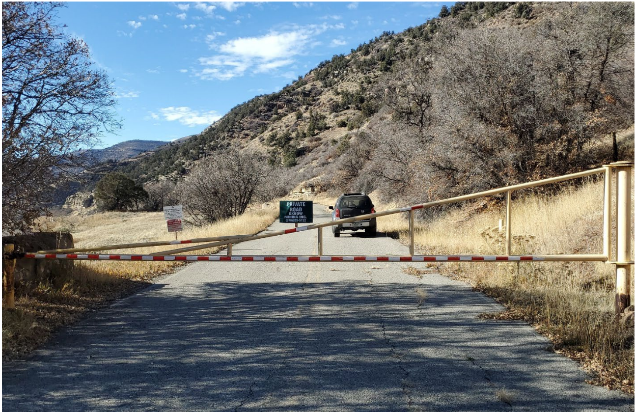
Figure 1: Locked gate at east entrance