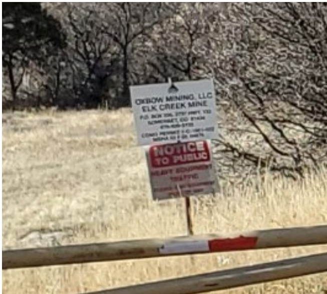
Figure 2: Mine ID sign

Number of Partial Inspection this Fiscal Year: 4